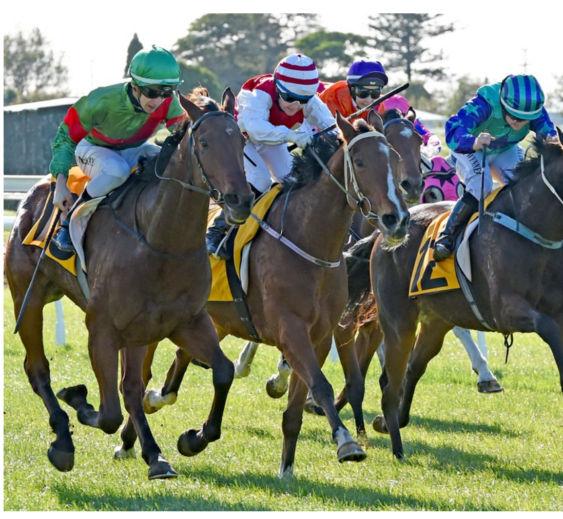
She's Poppy (green colours) comes with a well-timed finish to overpower the odds-on favourite Ladies First.

"She doesn't carry a lot of condition so you don't have to do a lot with her which makes it easier in a way as she goes better when she's fresh.