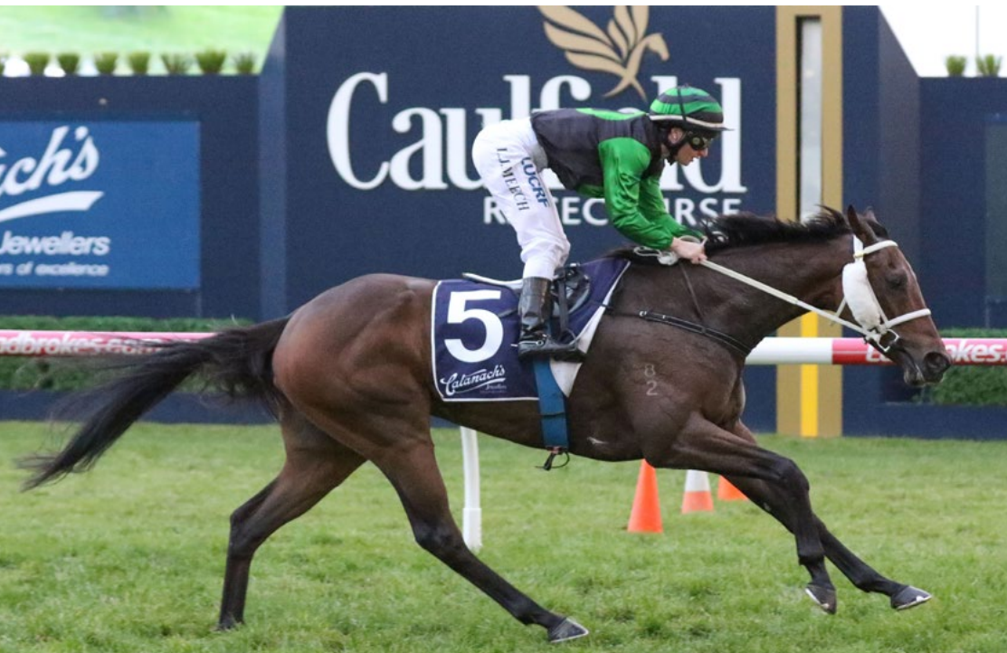
(Our) Peaky Blinders scores at Caulfield