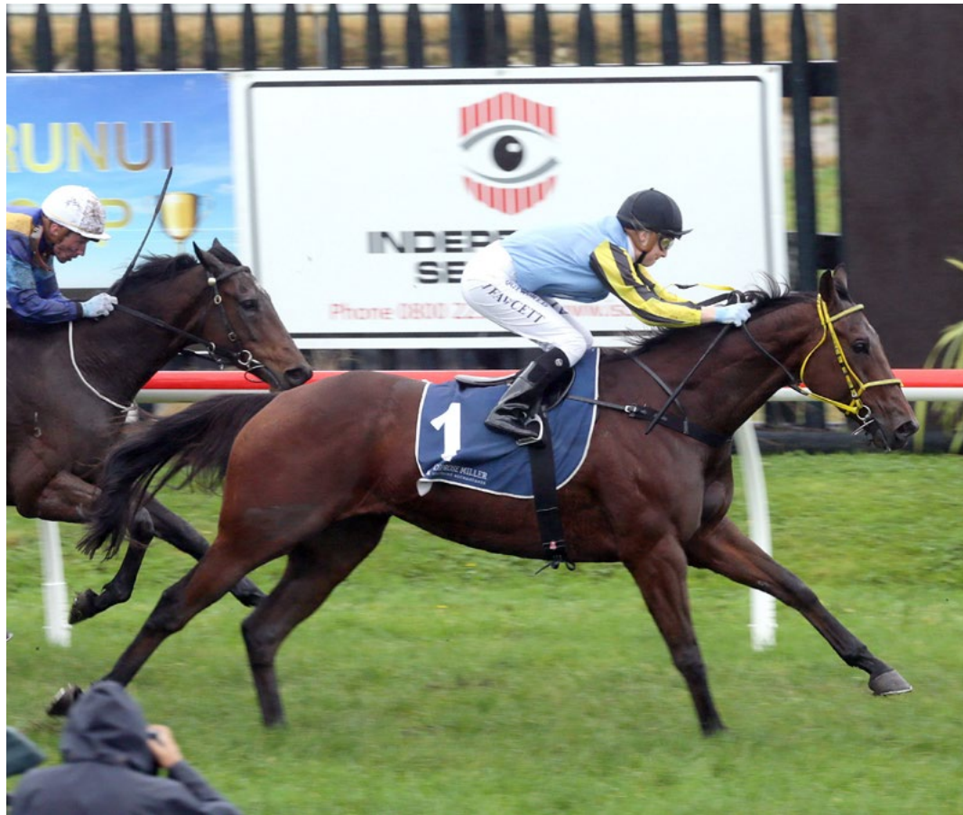
Winter track specialist Admiral salutes the judge at Rotorua

handed so that's another box we can tick off."