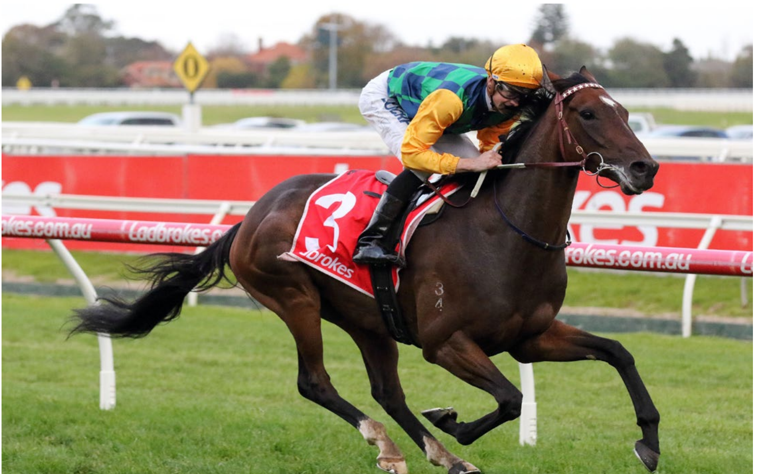
Lucky For All made it three straight Australian victories with a win at Caulfield on the weekend