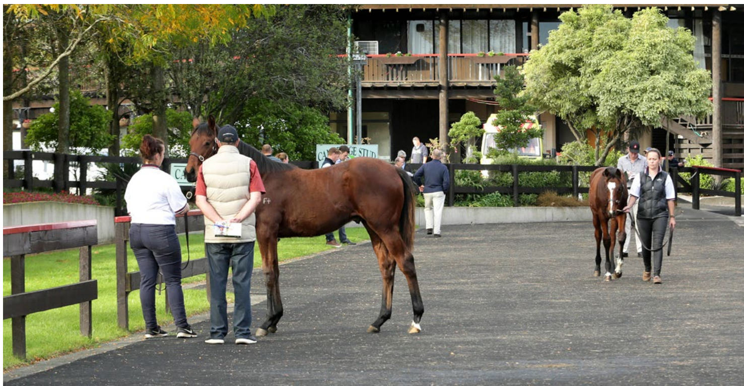
The annual New Zealand Bloodstock National Weanling, Broodmare and Mixed Bloodstock Sale starts at Karaka today.

New Zealand Bloodstock's annual National Weanling, Broodmare and Mixed Bloodstock Sale kicks off at 10am at Karaka today with an outstanding catalogue of proven and up-and-coming sires, both in the weanling category and among the covering sires of the broodmares.