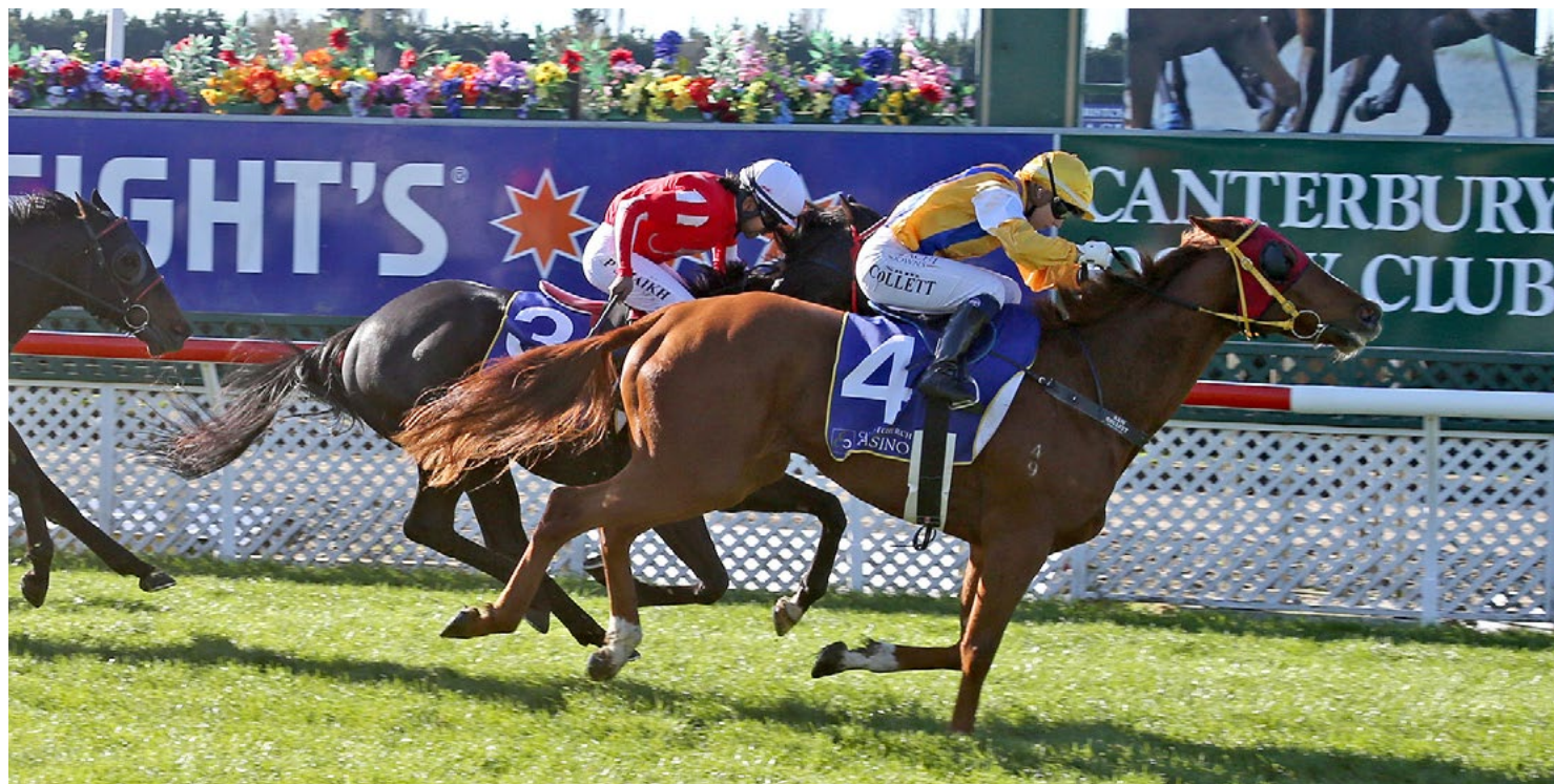
Handy sprinter Five Kings causes an upset at Riccarton