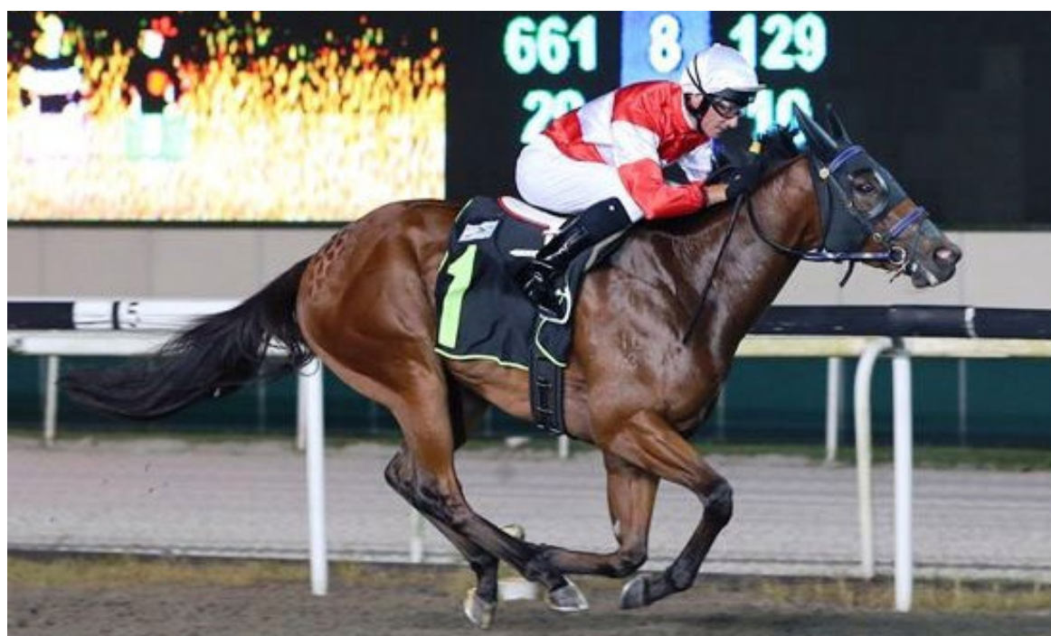
Darc Bounty gets his third win from six starts at Kranji.