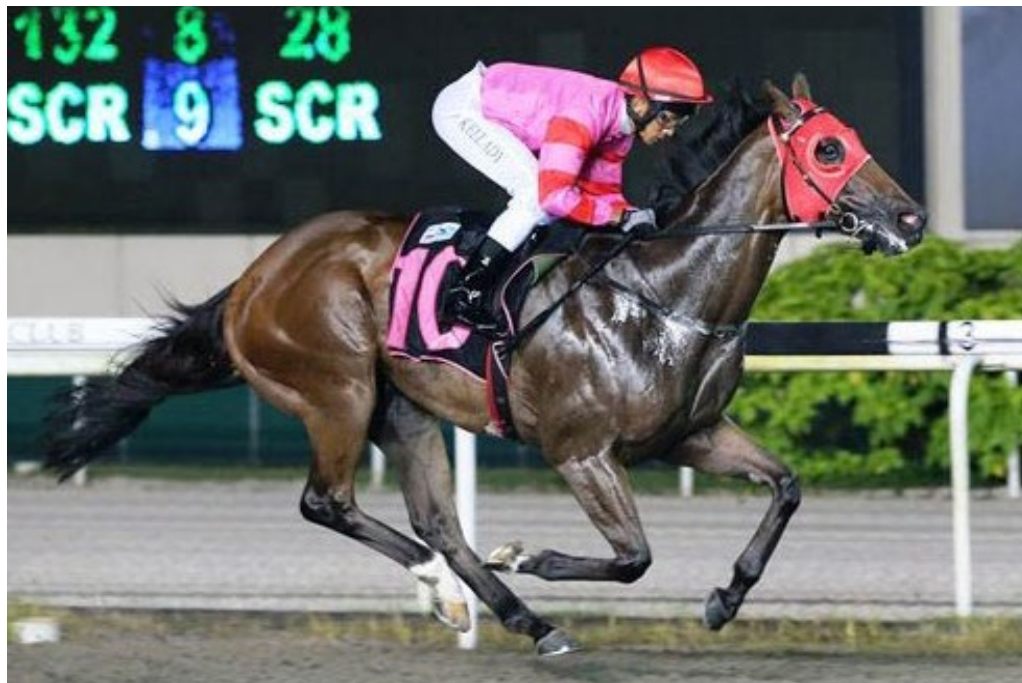
Caorunn shows his true class at Kranji.