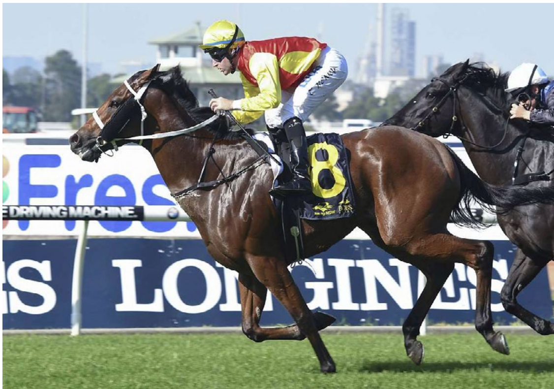
Having his first start in Australia, New Universe runs out a decisive winner against the three-year-olds at Rosehill.

Kawaikini (All American) made his run with New