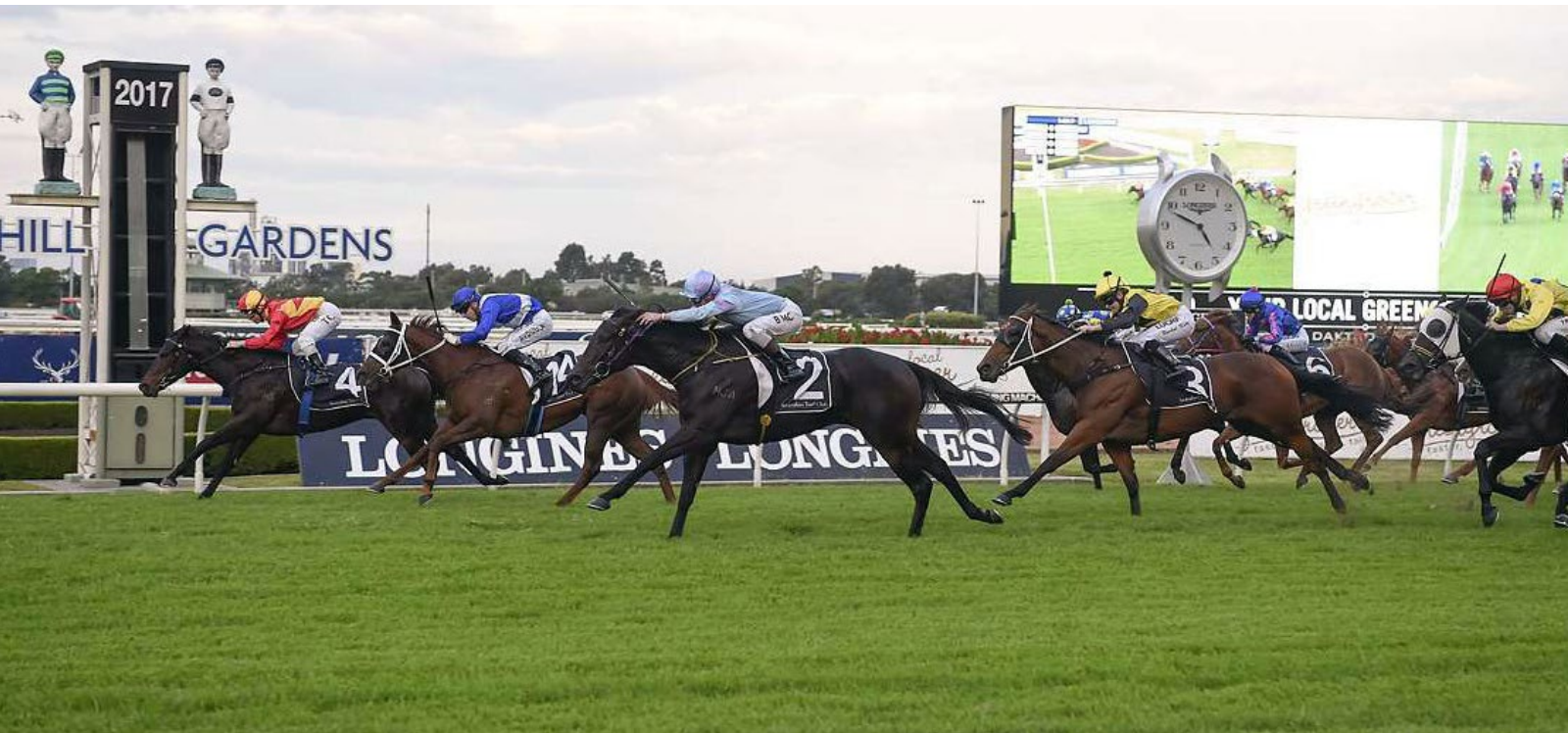
Bonny O'Reilly refuses to concede as the dead-heaters In Times Of War (#14) and Machinegun Jubs (#2) put her to the test at Rosehill.