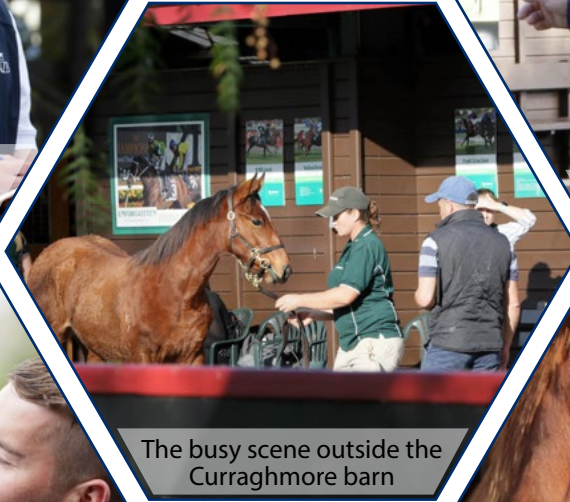
The busy scene outside the Curraghmore barn