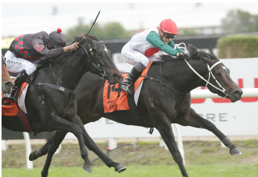
Power Dream (inner) stretches her neck out to secure a gritty win at Te Rapa