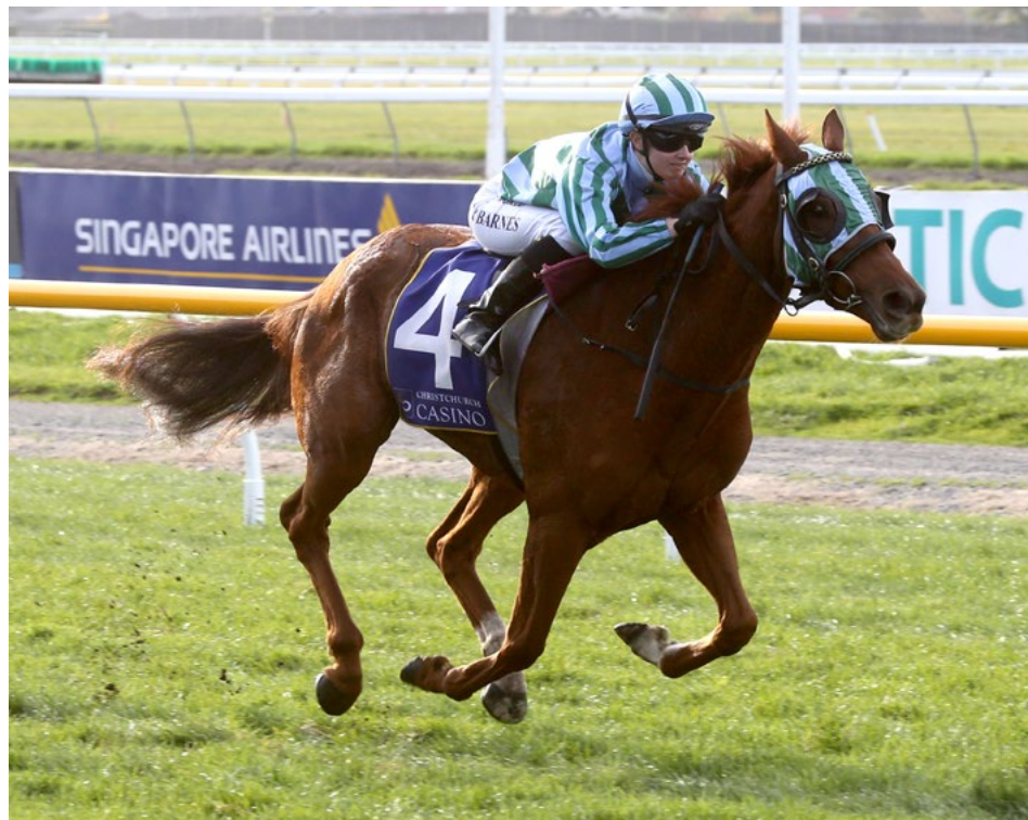
Son Of Zac clears out from his rivals at Riccarton