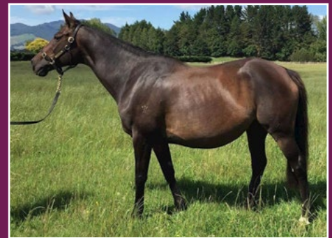
3 IN 1 PACKAGE - WINNING MARE WITH JAKKALBERRY FOAL AT FOOT AND IN FOAL TO JAKKALBERRY