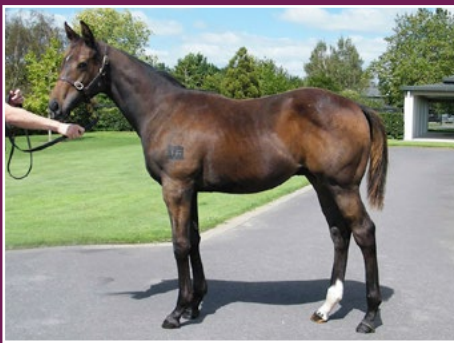
WEANLING COLT BY FERLAX