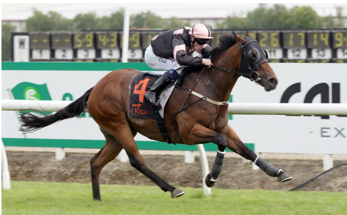
Pinzalot gives his rivals windburn with an impressive display of sustained speed