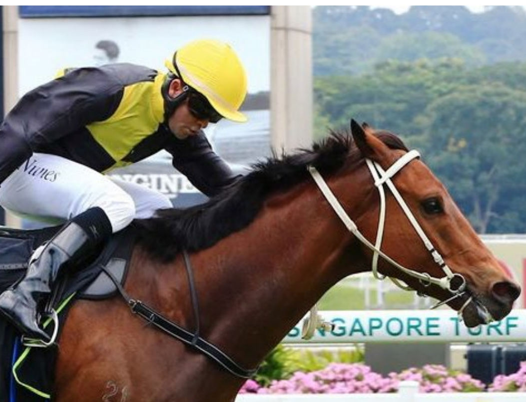
Darci's Boy lands his first win for the Lincoln Farm Stable