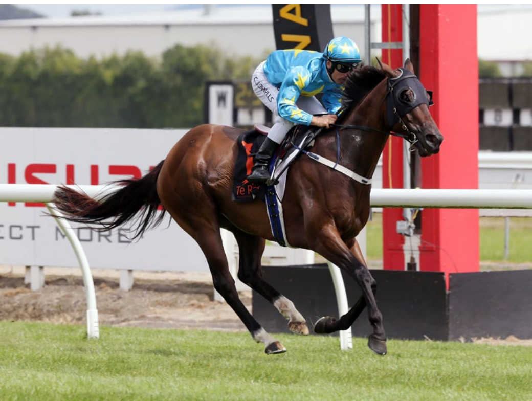
Irish Moon leads all the way to add another Te Rapa victory to his resume'