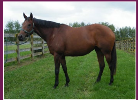
1/2 TO ART SUCCESS IN FOAL TO FERLAX