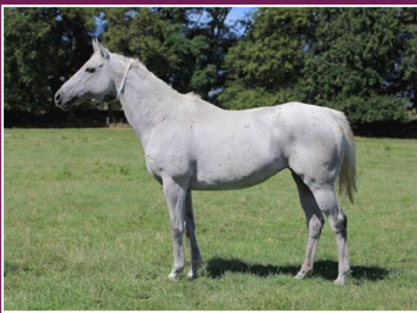
PROVEN MARE IN FOAL TO PINS