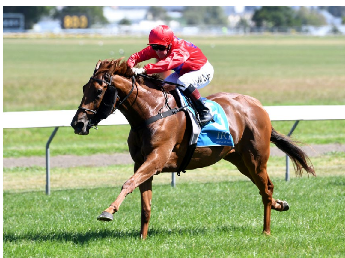
Gr. 1 Wellfield New Zealand Oaks contender Dreamcrafter

"She has improved with each run and she'll have a go at the Oaks and then go for a deserved break."