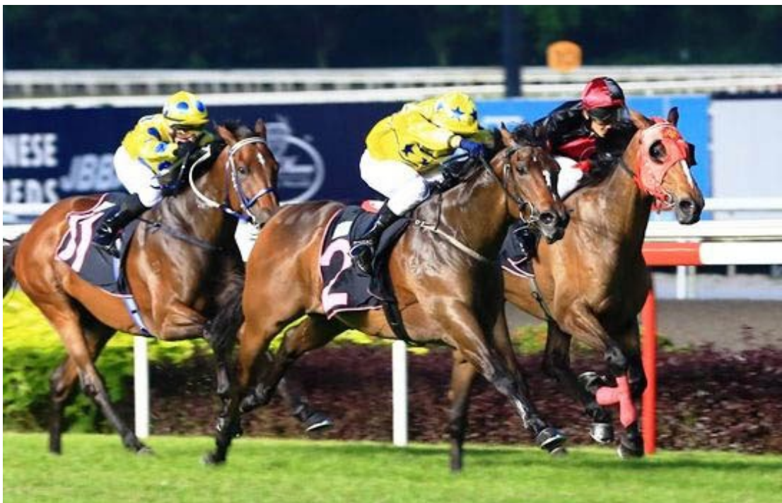
Chalaza accounts for Elise at Kranji on Friday night.

In a race dominated by New Zealand-breds, Chalaza went on to score by a length from Elise (NZ) (Faltaat) with Miss Blanchett third