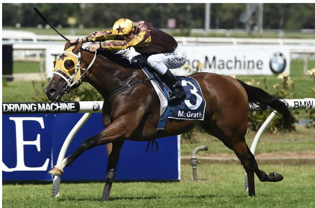
Tavago strides home well clear of his opposition in the Sky High Stakes.