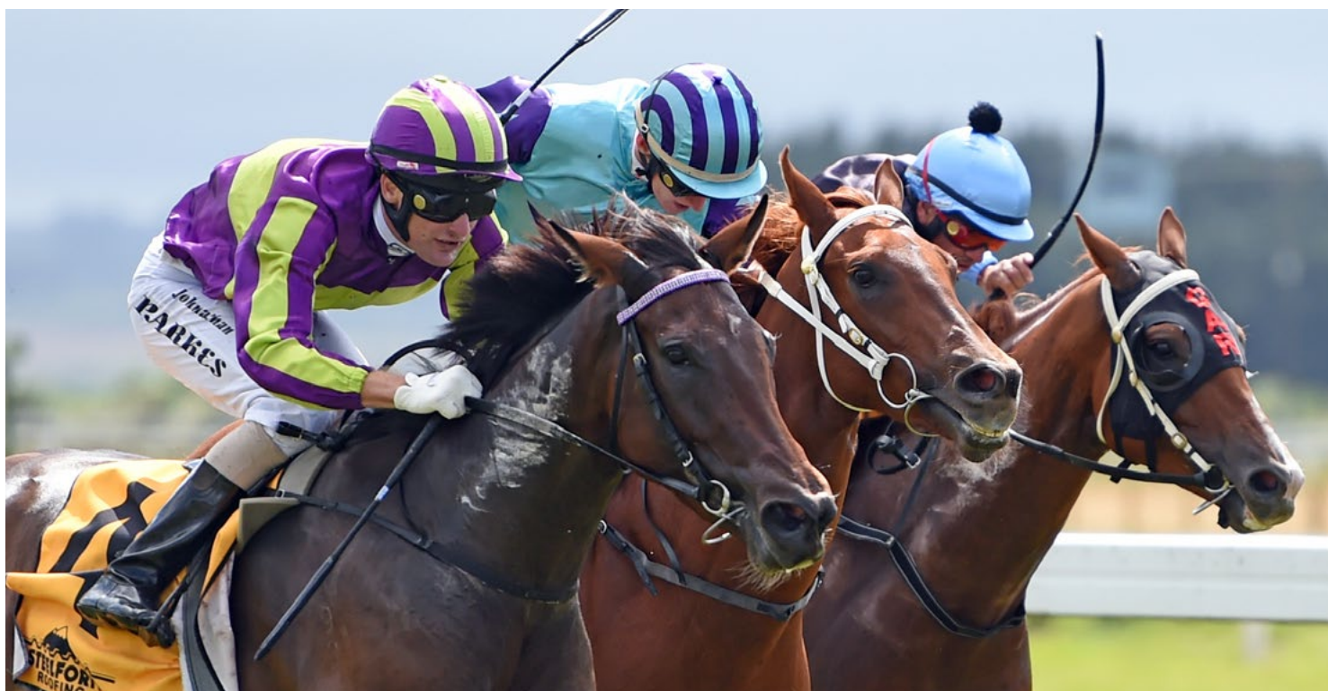
Regal Winks' finishing burst takes her past the R65 sprinters at Hawera.