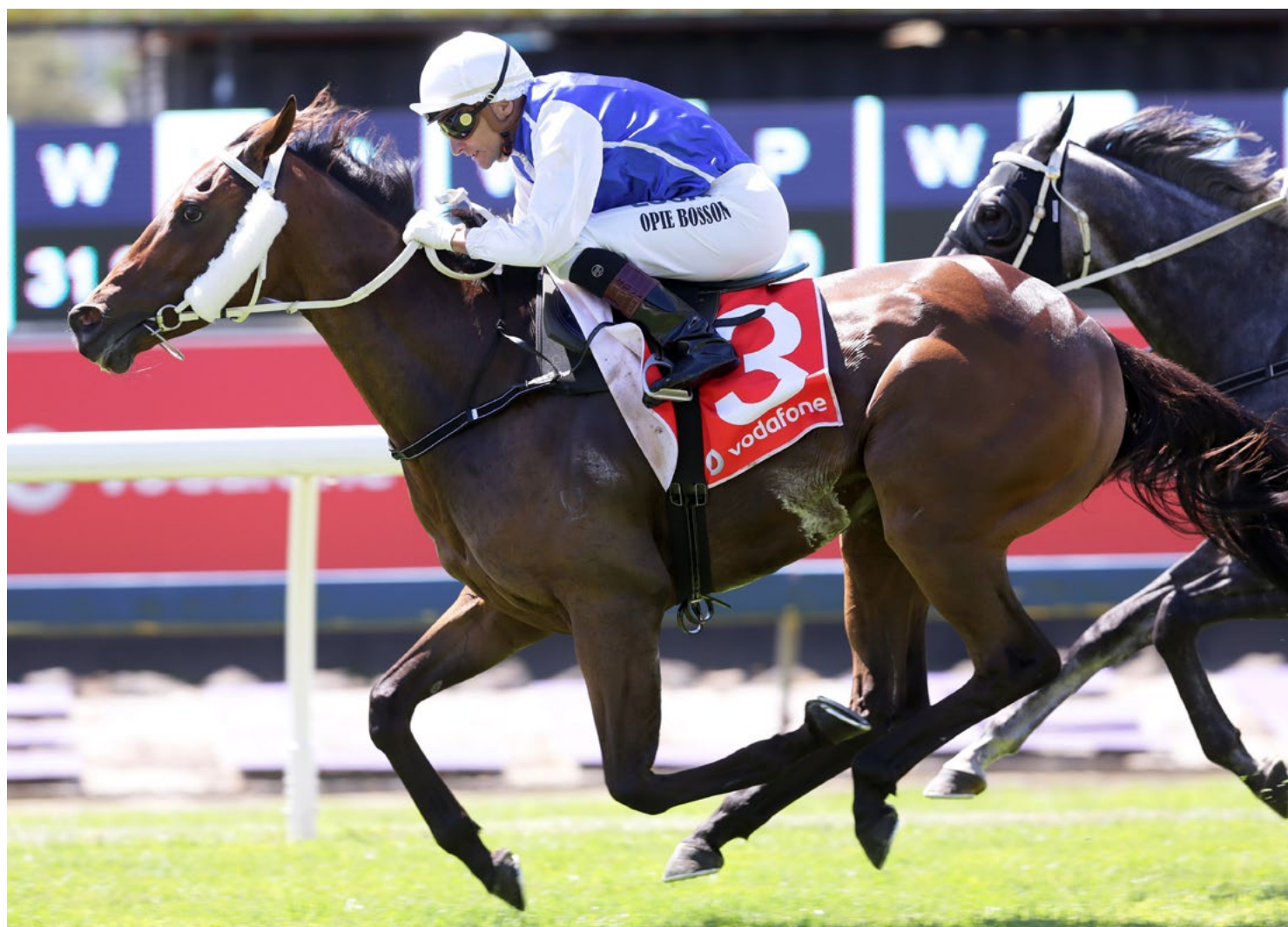
Peaky Blinders wins on Derby Day.