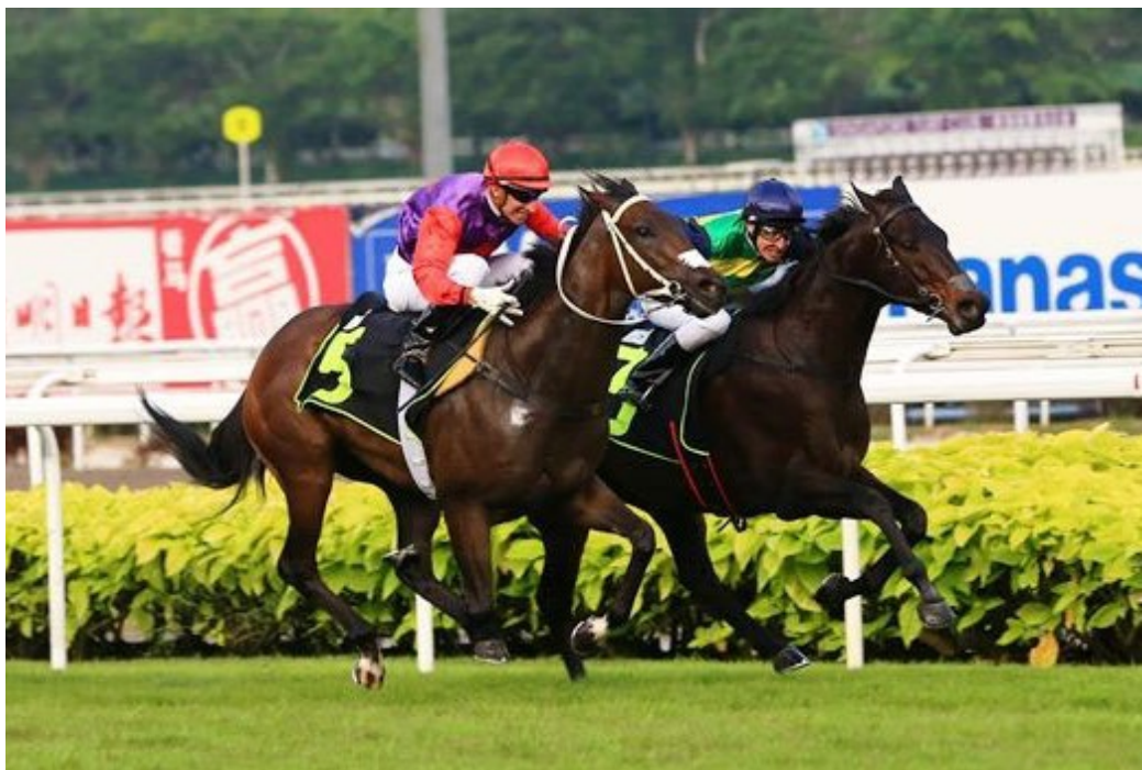
Copacabana (blue cap) does enough to maintain a margin over Justice Light.

"We're also very happy with Athena's run. She is looking