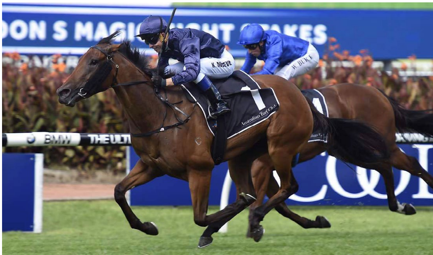
Tulip is untroubled winning the Magic Night Stakes.

New Zealand Bloodstock Premier Yearling Sale graduate Tulip (Pierro) has firmed dramatically with bookmakers for the Golden Slipper but the filly's owners remain undecided whether the Magic Night Stakes winner will back up into the $A3.5 million race.