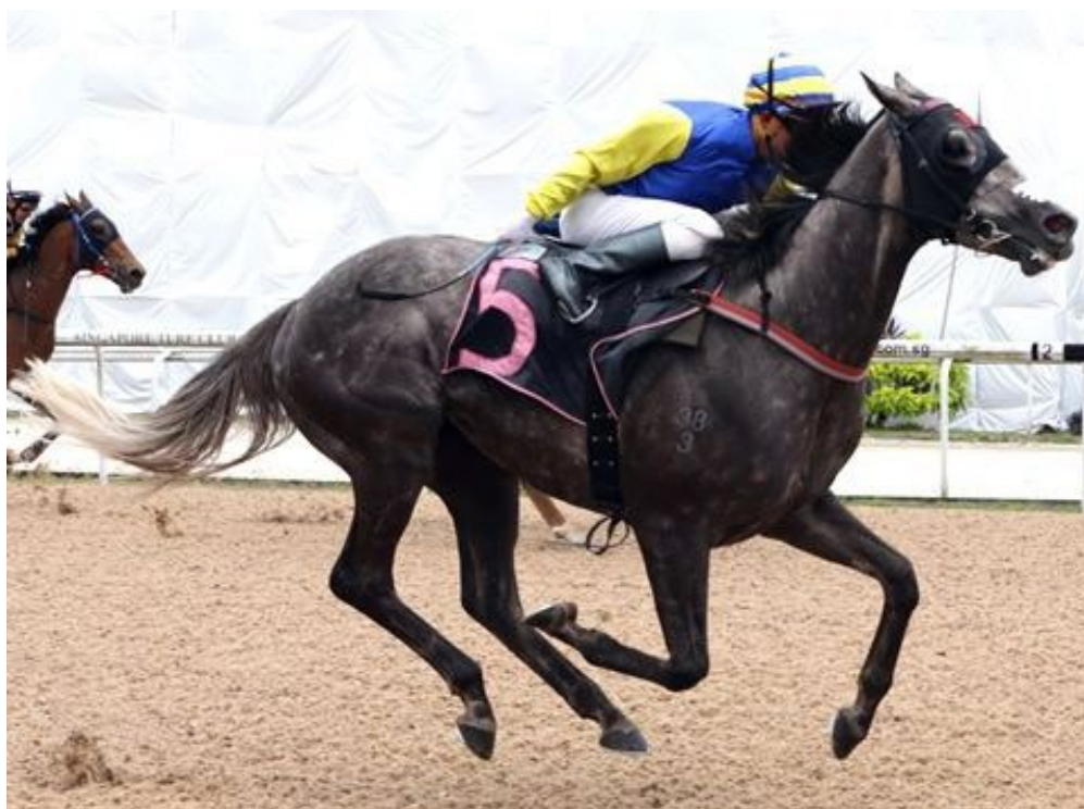
El Tordillo scores at Kranji