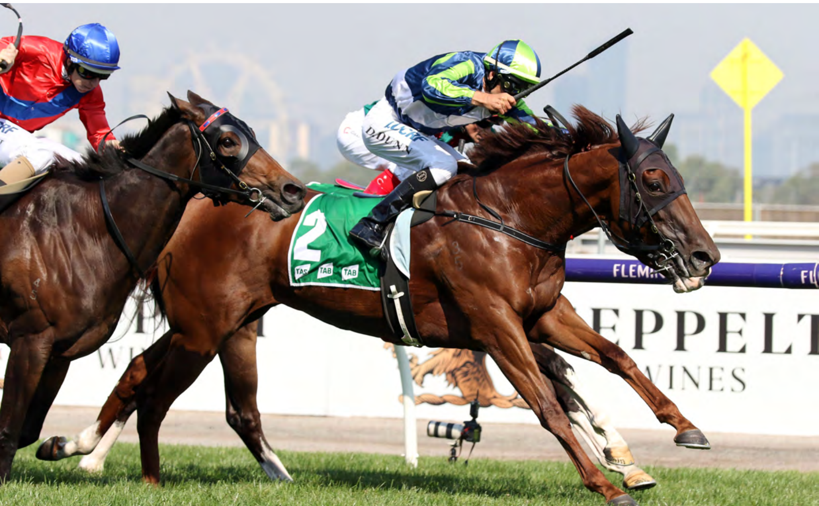
Gr.2 Kewney Stakes winner Spanish Whisper

Former New Zealand-trained filly Spanish Whisper (Lope De Vega) made a stunning return to the winner's circle on Saturday when she overcame a wide run to take out the Gr.2 Kewney Stakes (1400m) at Flemington.