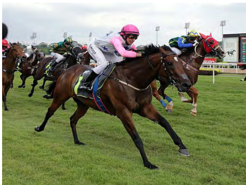
Debt Collector storms to a remarkable victory at Kranji