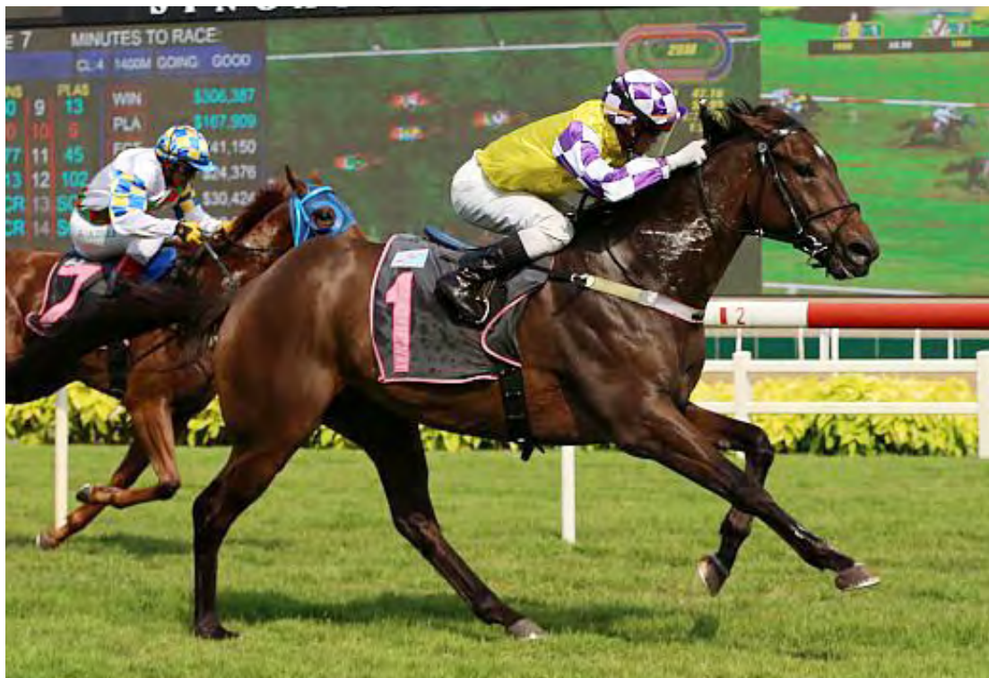
Sacred Croix wins his third in a row at Kranji