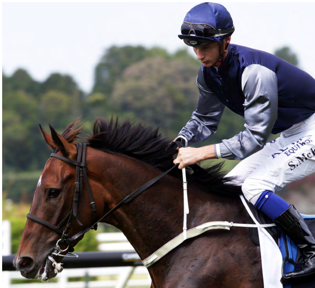
Sword In Stone could be set for a Queensland Winter Carnival campaign should a proposed sales deal not proceed

"There are two nice races at Ellerslie coming up so they would be our immediate targets. There is a three-year-old mile on March 30 and then the Championship Stakes (Gr.2,