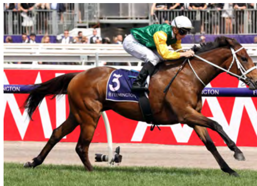
Shillelagh (NZ) (Savabeel)