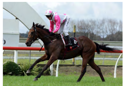
Blue Breeze (NZ) (Bullbars)

"I'm really happy with the way she is going," Thurlow said. "She has been doing a good job and everything is ticking over nicely. Full story here