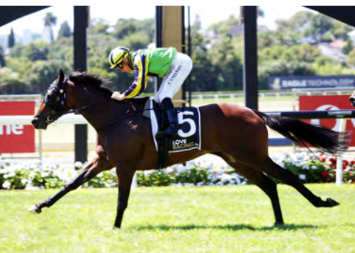
Gundown (High Chaparral)