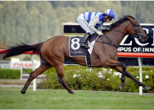
Supera (NZ) (Savabeel)

Breeders' Stakes (1600m) off the back of an unplaced run in the Gr.1 Haunui Farm WFA Group One Classic (1600m) at Otaki last month.