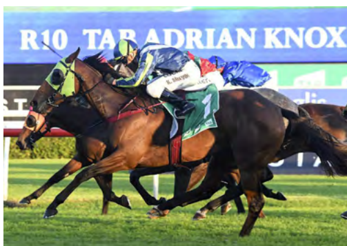
Luvaluva (NZ) (Mastercraftsman)

"It will be the lightest weight (56kg) he has carried in a very long time."