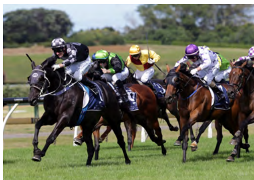
Five To Midnight (NZ) (Domesday)