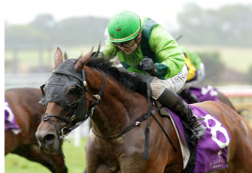
Zacada (NZ) (Zabeel)

Ladies First has won nine of her 24 starts to date including three at stakes level.