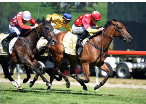
Madison County (NZ) (Pins)

A winner of six of his 28 starts for owners Archer Equine Investments, Charles Road will attempt 3200m for the fourth time on Saturday, having most recently finished seventh in the Gr.1 Melbourne Cup (3200m) at Flemington last November after challenging for the lead with 400m to run.