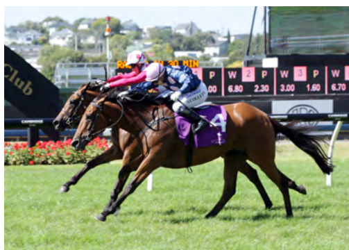
Glory Days (NZ) (Red Giant)

The Cambridge Stud principals will also have an eye on Sydney where their debutante Get Hitched (Lonhro), a $520,000 Karaka purchase, will be thrown in the deep end in the Gr.2 Reising Stakes (1200m) at Randwick. Full story here