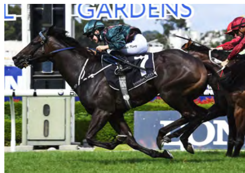
Lanciato (NZ) (Per Incanto)