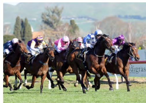
Charles Road (Myboycharlie)