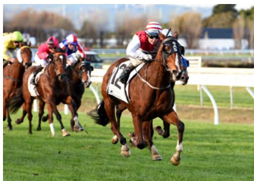
Ladies First (NZ) (Dylan Thomas)