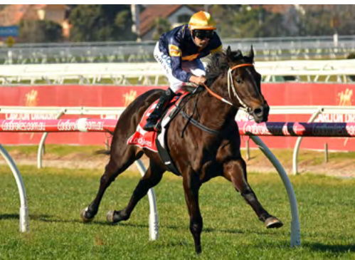
Brutal (NZ) (O'Reilly)