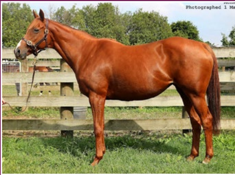
STAKES PLACED MARE IN FOAL TO POUR MOI