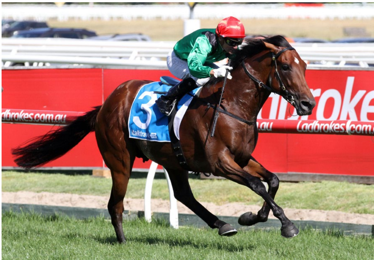
Multiple Group One winner Turn Me Loose captures the 2016 Futurity Stakes

"He's the best performed son of Iffraaj in the Southern Hemisphere with his three Group Ones wins and a pair of Group Two victories as well. At his peak he was such a powerful galloper and a real competitor in everything he did."