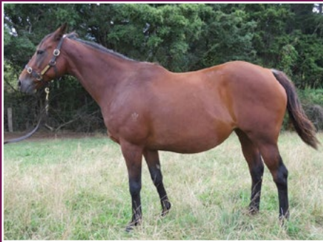
UNRESERVED WINNING MARE IN FOAL TO PROISIR