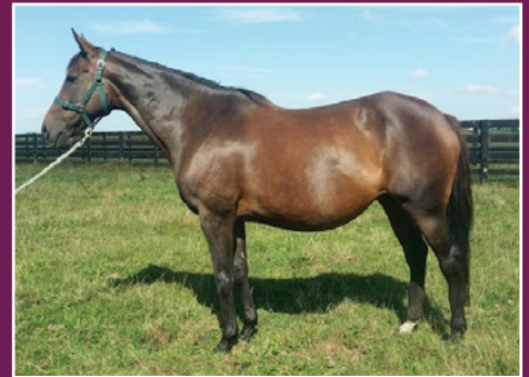
3 IN 1 PACKAGE - SIBLING TO 3 STAKES-WINNERS WITH SHOWCASING FOAL AT FOOT & IN FOAL TO BURGUNDY