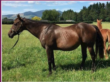
3 IN 1 PACKAGE - STAKES PLACED MARE WITH JAKKALBERRY FOAL AT FOOT & IN FOAL TO JAKKALBERRY