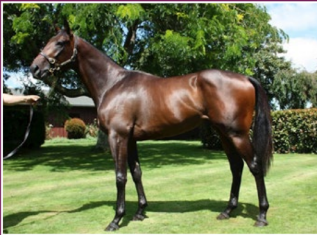
O'REILLY COLT FROM A REDOUTE'S CHOICE MARE