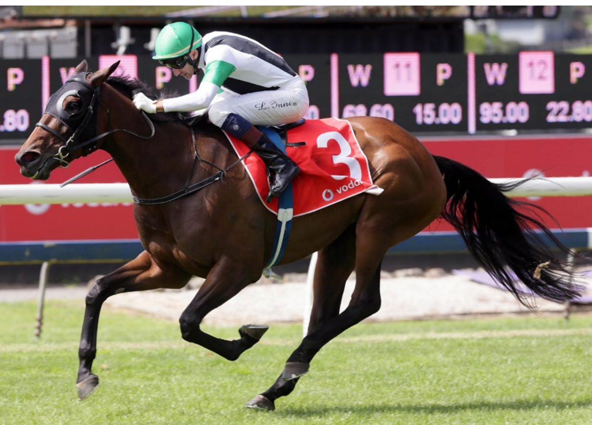
Chenille is likely to start favourite in this Saturday's Gr. 1 Barfoot & Thompson Auckland Cup after an authoritative win at Ellerslie