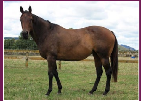
FUSIACHI PEGASUS MARE IN FOAL TO DALGHAR