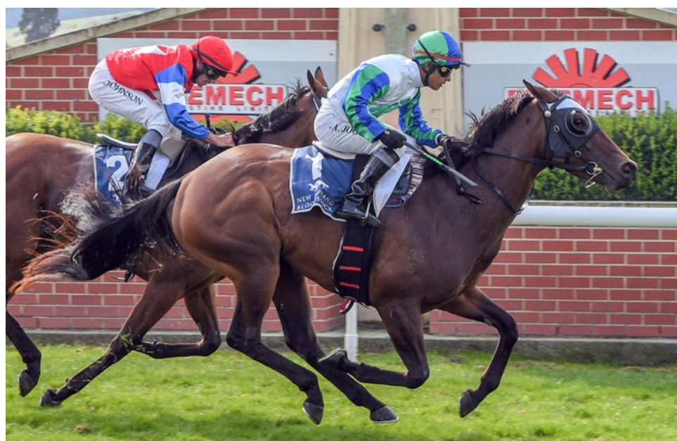
Residential makes it three wins on the trot as she dashes home at Wingatui