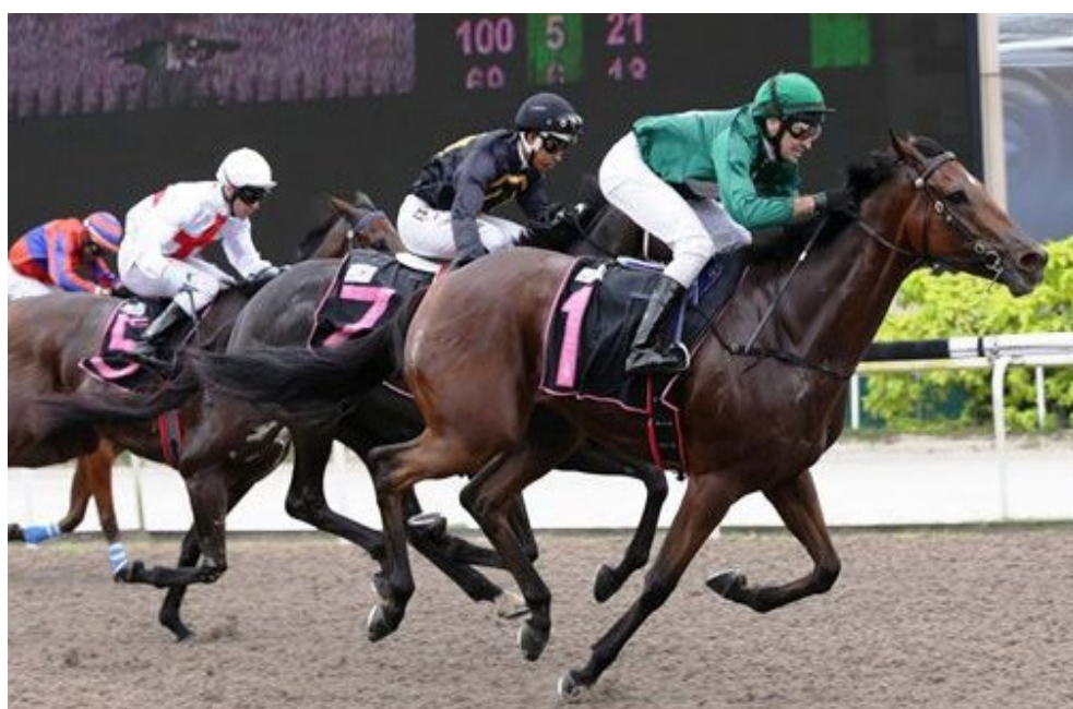
Gilt Complex completes a handy win at Kranji