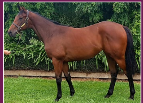
SUPER EASY FILLY OUT OF A GROUP TWO PLACED CENTAINE MARE.