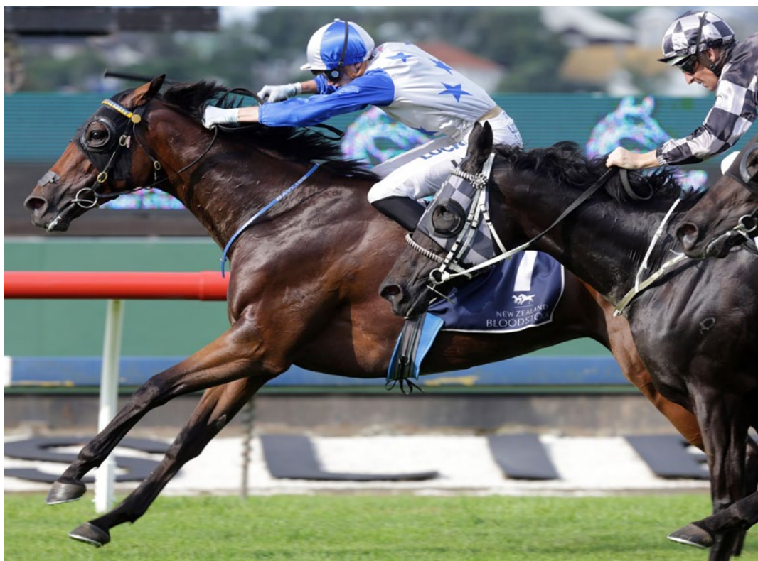
Charles Road wins on Karaka Million night to confirm his Gr. 1 Barfoot & Thompson Auckland Cup bid