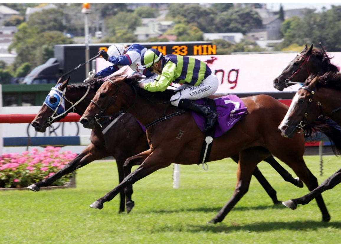
Yearn (blue and green stripes) collars Ruud Not Too (inner) at the Ellerslie winning post