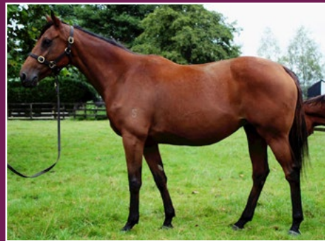
UNRESERVED 3 IN 1 LOT. MARE IN FOAL PLUS A RIP VAN WINKLE COLT.