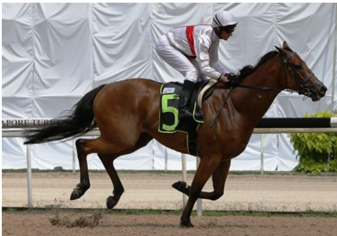
Hyde Park dashes clear at Kranji