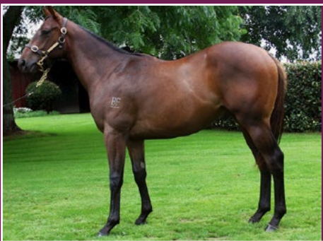
DALGHAR COLT. SECOND DAM HABIBTI, FAMILY OF HUMIDOR.