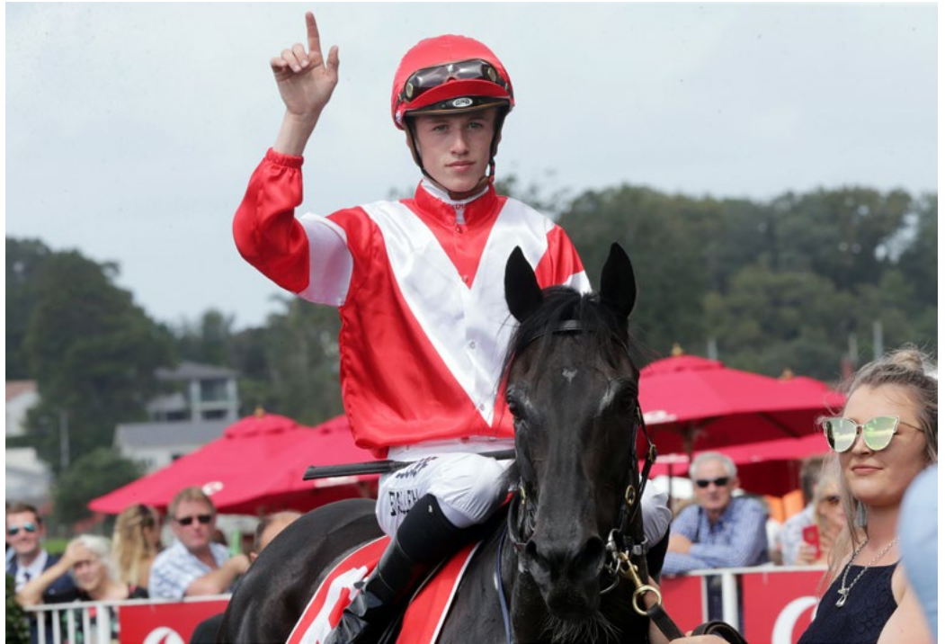
Saturday's victory could set up a shot at Derby glory in Australia for Mongolian Marshal