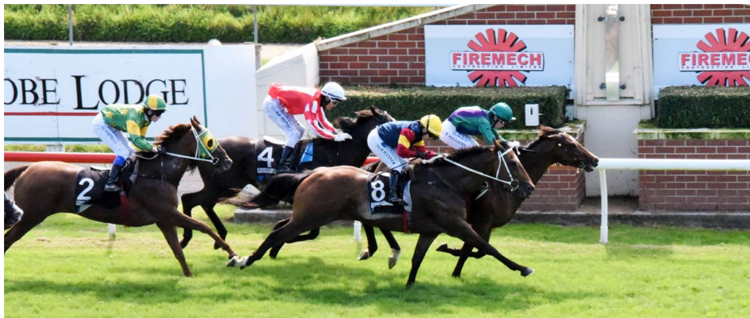
Don Carlo holds out all the challenges at Wingatui