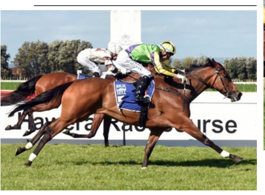
Francaletta (NZ) (High Chaparral)

Charm Spirit will return to Windsor Park Stud this coming breeding season where his service fee will be P.O.A.