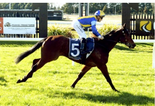
Lady Lira (NZ) (Per Incanto)

She put the Listed Courtesy Ford Ryder Stakes (1200m) in her sights, at a venue yet to be confirmed following drainage work at its usual Otaki home, with a dominant performance to win at Rotorua on Wednesday.