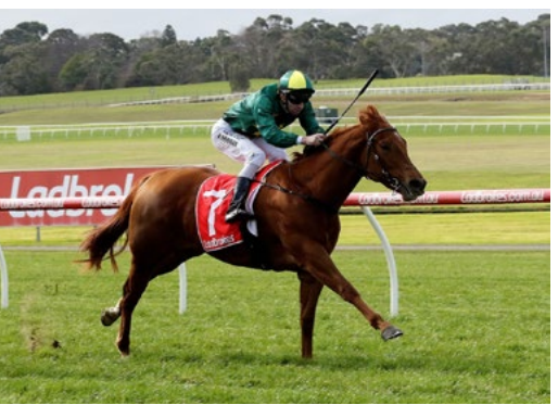
Trilli (NZ) (Per Incanto)

"The nice big roomy Caloundra track will really suit him and with a bit of moisture about we're happy. He did a bit of work yesterday and fitness wise I'm very happy where he is."