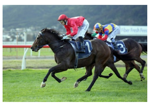
Ripnroll (NZ) (Rip Van Winkle)

The Cambridge trainer's plan was perfectly