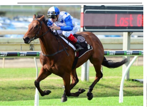
The Bostonian (NZ) (Jimmy Choux)

"I think it's a Heavy 8 at the moment. The track does dry well, but let's hope there is no rain cloud over it on the day of the race. The horse is well."