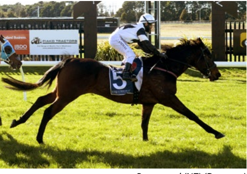
Perswayed (NZ) (Denman)

Lady Lira was purposefully kept wide in the running during the Christmas Fun Racing 28 2YO (1230m) and she proved far superior to Meryace (NZ) (Swiss Ace) and Red Forest (NZ) (Redwood), who were both making their first appearances. Full story here