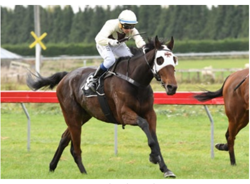
Under The Bridge (NZ) (Mettre En Jeu)

The four-year-old hasn't raced since he won over 2100m at just his second race day appearance at Woodville in May.