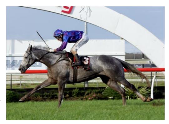
Megablast (NZ) (Shinko King)

Megablast has built up a handy record of