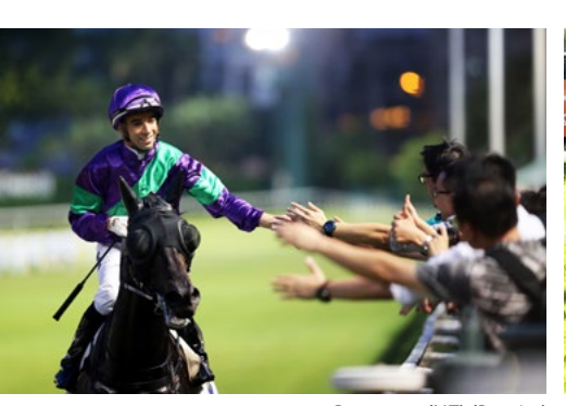
Penzance (NZ) (Pentire)