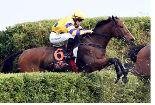
Justa Charlie (NZ) (Shinko King)

on August 5 and the Grand National Steeplechase (4500m) at the same track a fortnight later. Full story here