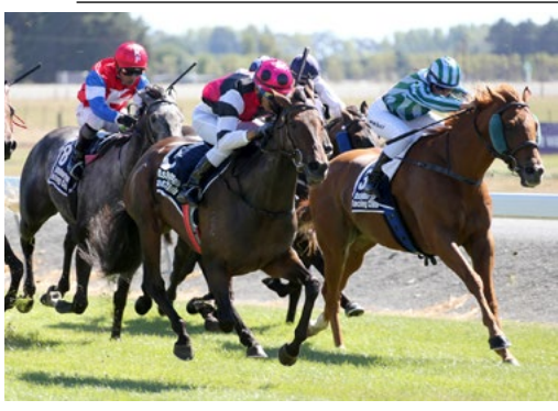
Flying Sardine (NZ) (Flying Spur)

At home, the rising 12-year-old has twice won the Waikato Steeplechase (4100m) and the Waikato Hurdles (2800m).