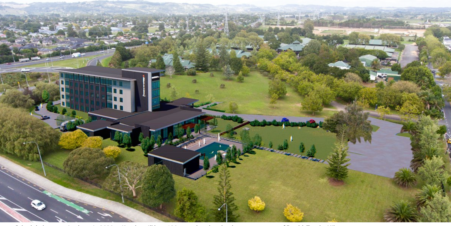
Scheduled to open its doors in 2020 at Karaka will be a 120-room hotel under the management of DoubleTree by Hilton

cheduled to open its doors in 2020, a new property will debut at Karaka with a 120-room hotel under the management of DoubleTree by Hilton.