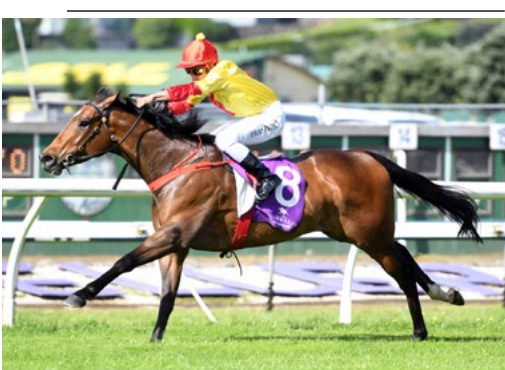
Fire Jet (NZ) (Tavistock)

"I'm hoping that she can be a Guineas filly," Warren said.