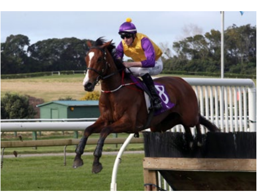
Monarch Chimes (NZ) (Shinko King)

on August 5 and the Grand National Steeplechase (4500m) at the same track a fortnight later. Full story here