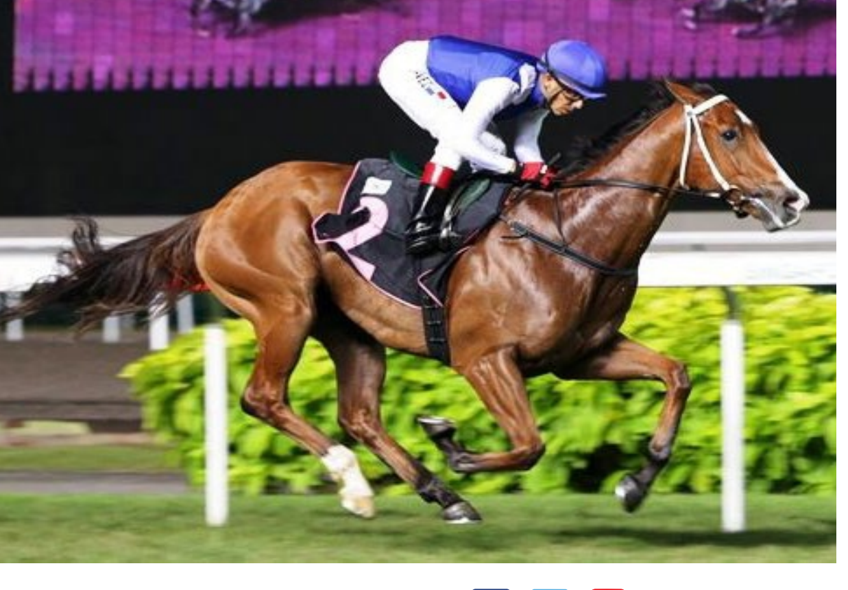
Ettijah debuts impressively at Kranji on Friday night.