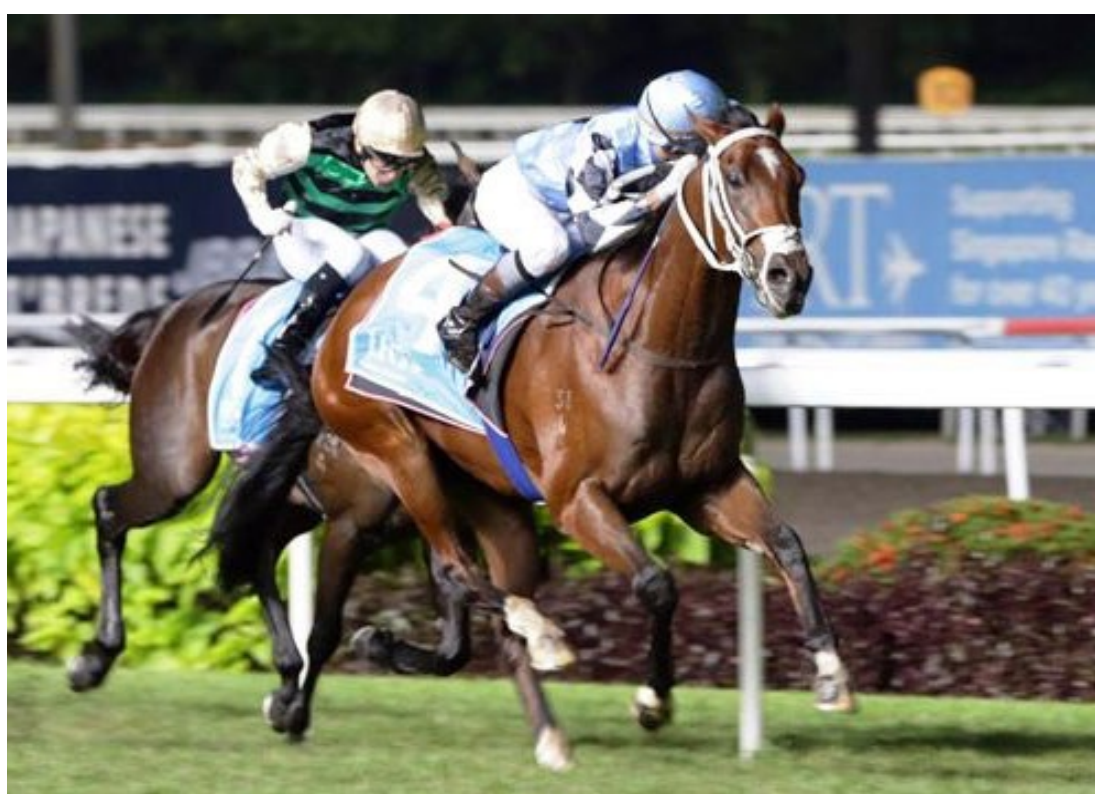
Ferocious is a cut above the juveniles at Kranji.

Even at the top of the straight, those who had punted the gelding down to second favouritism must have thought their chances were up in smoke but jockey Shafiq Rizuan had a lapful of horse and the moment he set Ferocious alight it soon became clear which way the race was going.