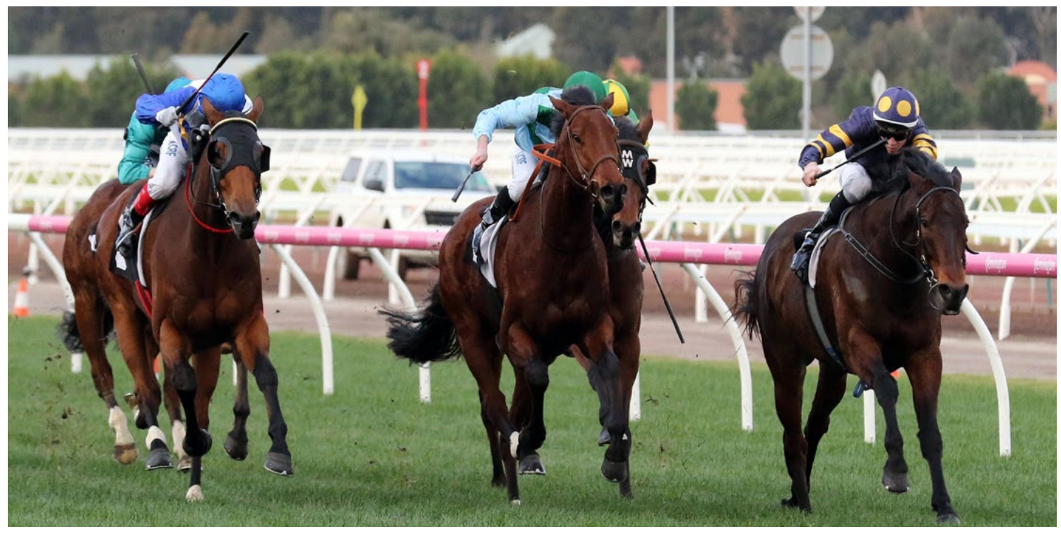
Riyadh (yellow spotted cap) capitalises on a rails run to take the lead in yesterday's Provincial Plate at Flemington.