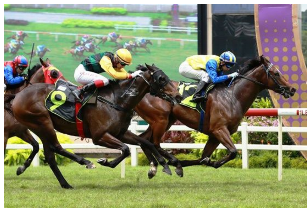
Autumn Assault runs out an impressive winner at Kranji

a little longer to launch him and even though he was stopping and waiting for another horse to come back, he did enough to get home.