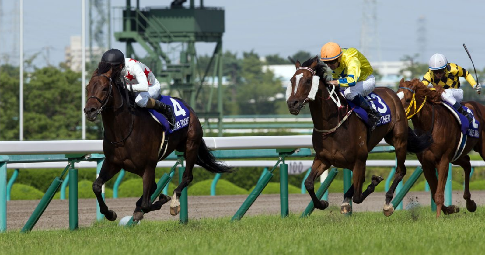
New Zealand bred, Hong Kong champion Werther (orange cap) finishes a gallant second at Hanshin

etbacks, an earthquake, weight loss, a wide draw and firm ground could not stop Werther's (NZ) (Tavistock) bid for glory in the Gr.1 Takarazuka Kinen (2200m), but a Rocket could as the champion stayer fell just short of victory at Hanshin Racecourse.