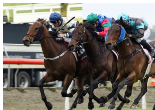
Prince Of Passion (NZ) (Castledale)