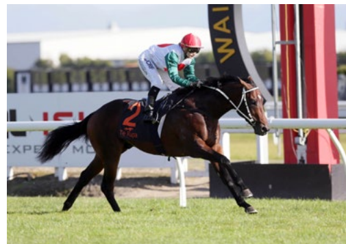
Ardrossan (Redoute's Choice)