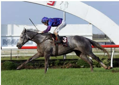
Megablast (NZ) (Shinko King)