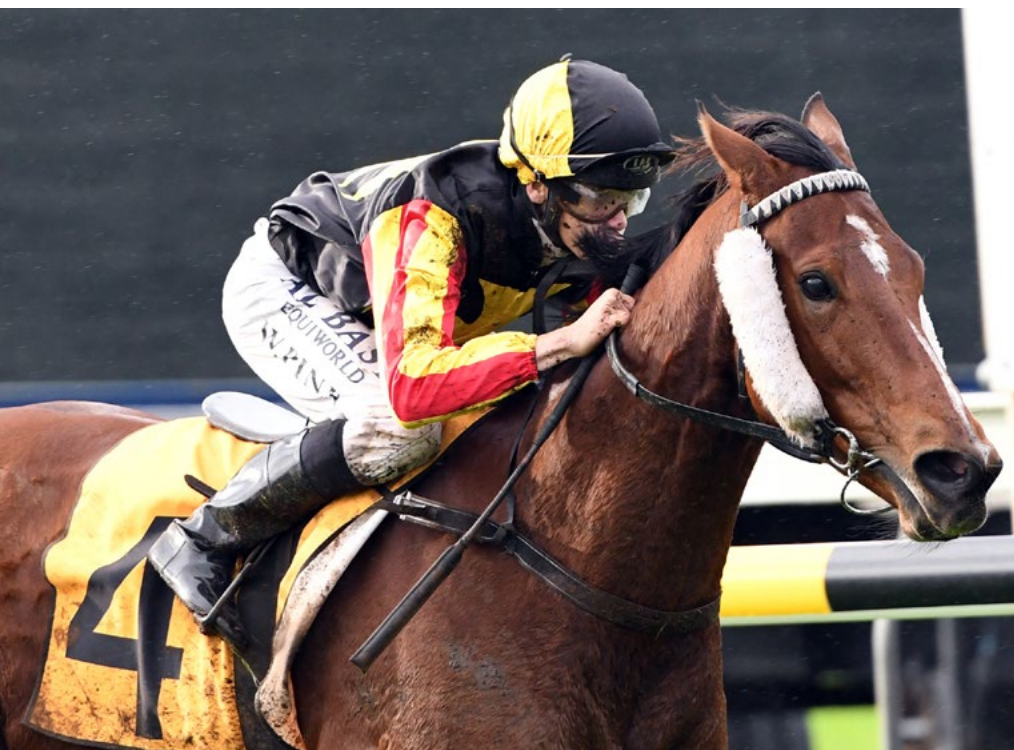
Art Deco will look to add to her Tauranga record in Saturday's Listed Woburn Farm Tauranga Classic