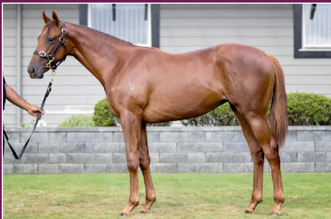
Lot 13 - Karaka Million Series eligible El Roca filly from multiple stakes winner Regal Kiss.

Last chance to secure a 2018 Karaka Million Series eligible yearling this season.