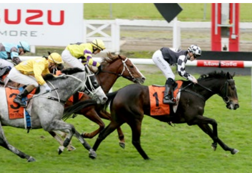
Darci Mac (NZ) (Darci Brahma)