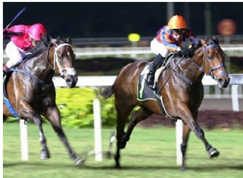
Sky Rocket (NZ) (Darci Brahma)

this. Some look like they will, but they don't in the end.