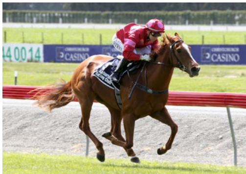
Prom Queen (NZ) (Super Easy)