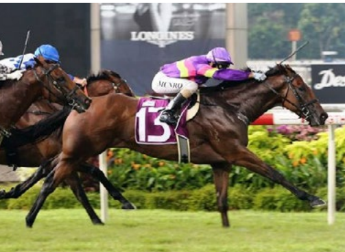
Countofmontecristo (NZ) (Echoes Of Heaven)