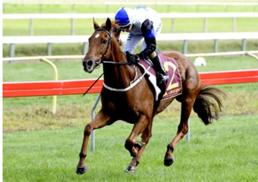
Roger That (NZ) (Shinko King)