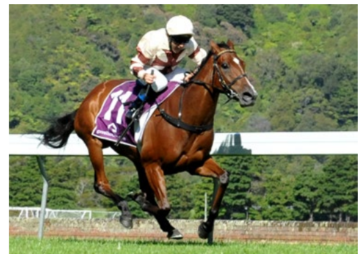
Aide Memoire (NZ) (Remind)

"They will run well and there is not much between them, but I think Underthemoonlight will be very hard to beat. I thought it was an outstanding performance at Te Rapa last start under the big weight."