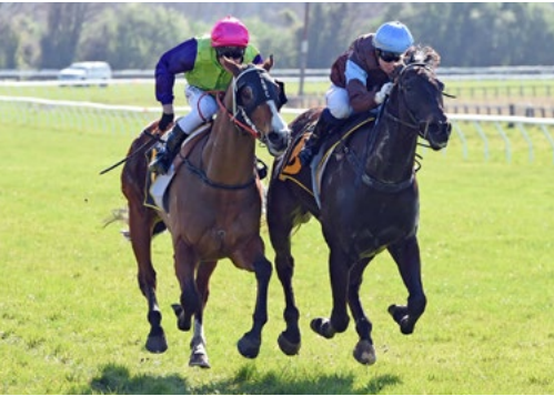
Longchamp (NZ) (Tavistock)