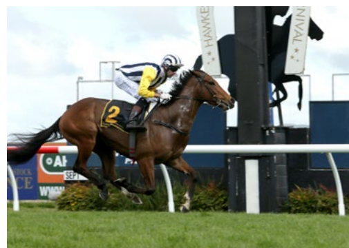
Haussmann (NZ) (Pour Moi)

targeting summer sprint and 1600m features.