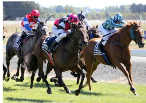
Flying Sardine (NZ) (Flying Spur)

That is the tally Flying Sardine (NZ) (Flying Spur) has accumulated since