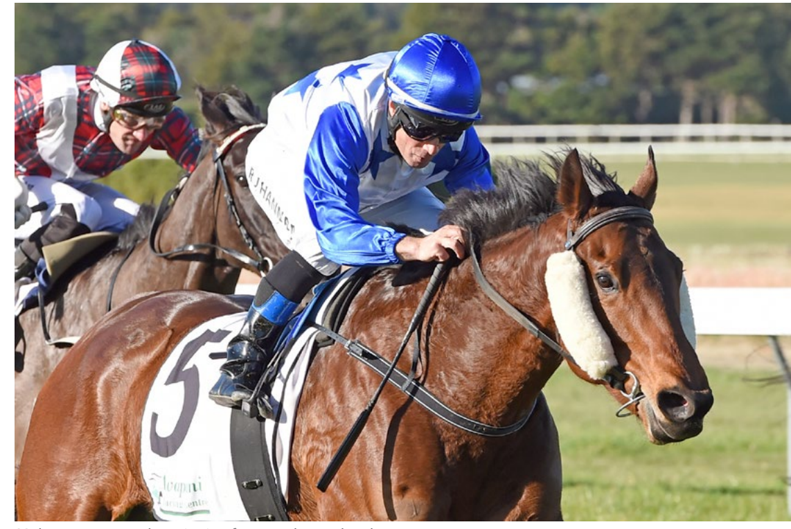
Malacanto returned to winning form on the weekend

The Per Incanto mare had looked to as though she could be a star winter performer when she won three of her first 5 starts, the last of those at Otaki in August. Since then the mare had endured a run of outs that finally came to an end on Saturday as she produced a powerful finishing burst to stride clear of her six rivals and notch win number four for