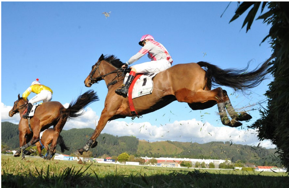
Eventual winner The Oysterman follows runner-up Joking over a fence in midfield action from yesterday's Manawatu Steeplechase.

The Grand National, Great Northern and Awapuni Hurdles