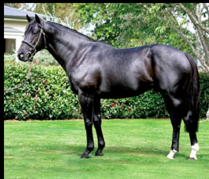
PERFECTLY READY (Aus) More Than Ready - Elle Duccio, Danehill

One of New Zealand's proven Group I sires, leaving winners worldwide.