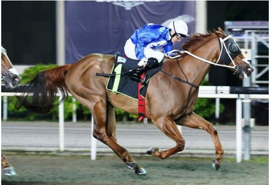
Champagne Rein in winning mode at Kranji on Friday night.

“He was getting the staggers late but it was a terrific effort,”