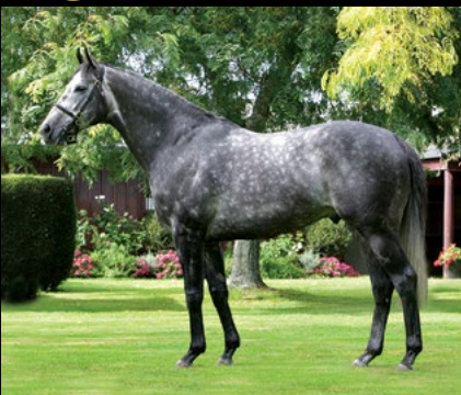
DALGHAR (Fr) Anabaa - Daltawa, Miswaki

Exciting young sire. Huge Karaka Sales series, selling up to $220,000 & overall sales average of $53,000.