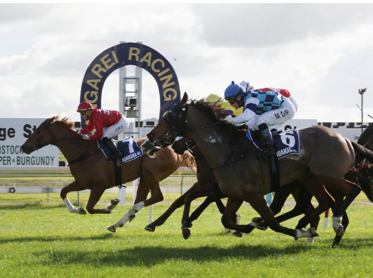
Classy three-year-old Toorak Tower (#7), aided by a rails run, has enough in hand to hold out a parcel of chasers in the Rating 75 mile at Ruakaka.

Toorak Tower has now won twice from seven starts and he measured up favourably against the better three-year-olds in the summer when fourth in the Listed Race 4 Life Salver at Ellerslie.