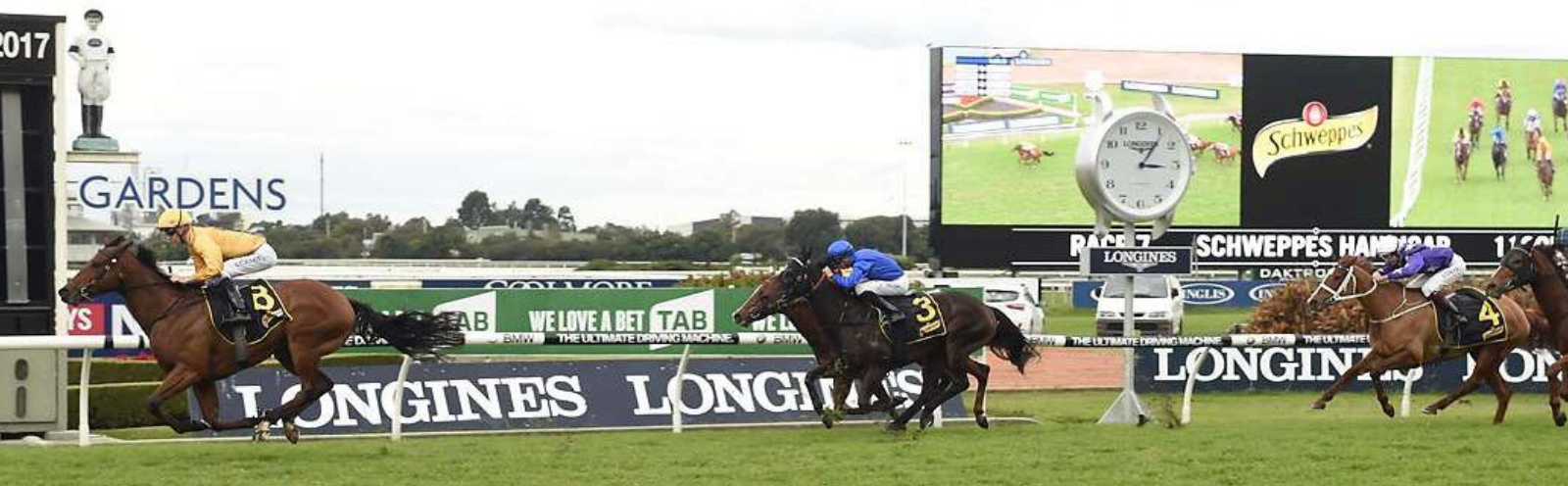
Over his favourite 1100 metre trip, Sir Plush streets 'em at Rosehill.