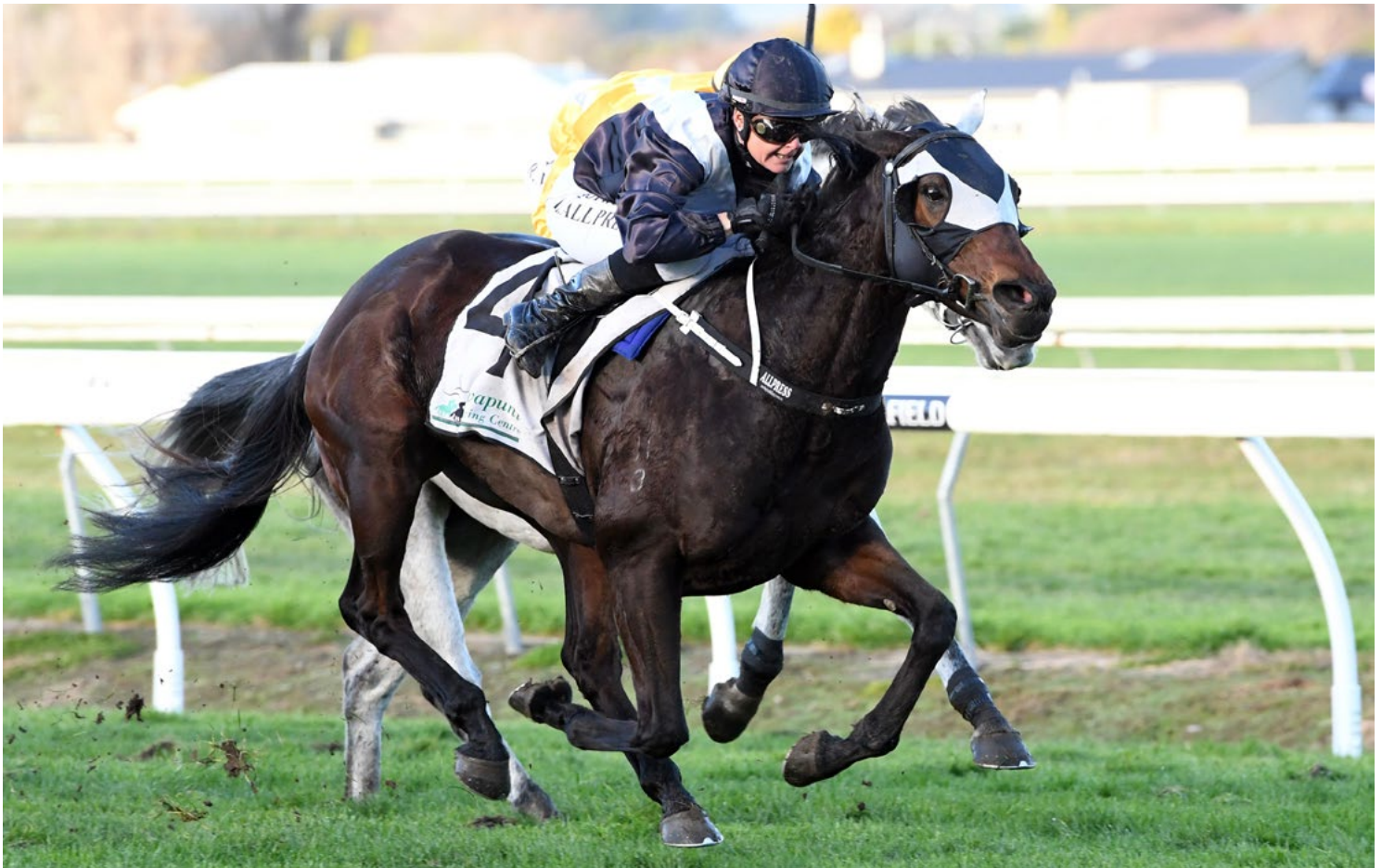
Rosewood cruises home at Awapuni