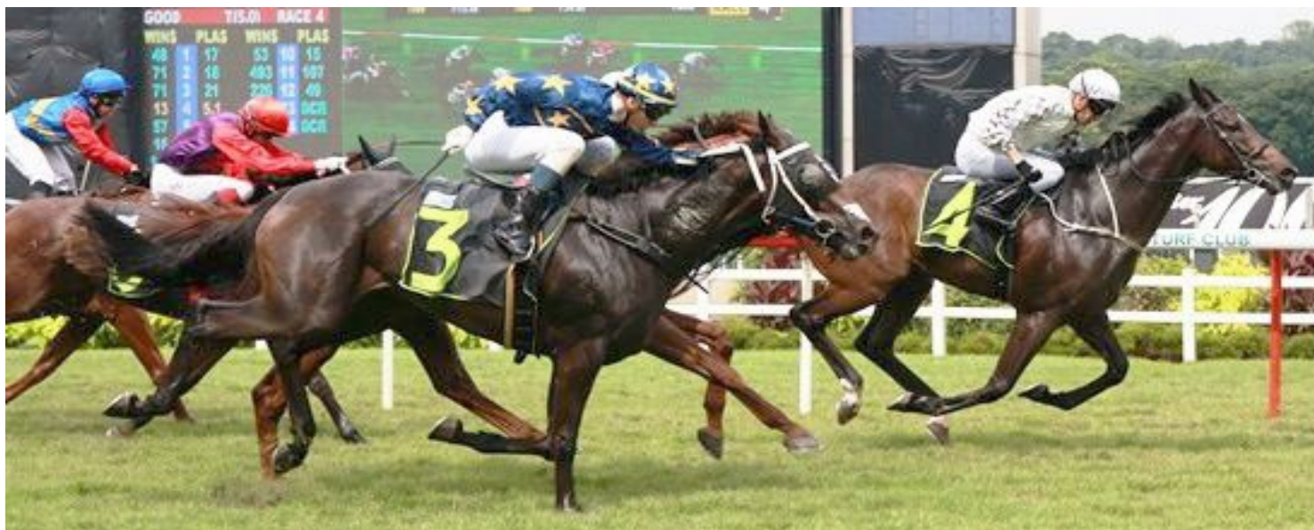
Alamak scorches home to win at Kranji