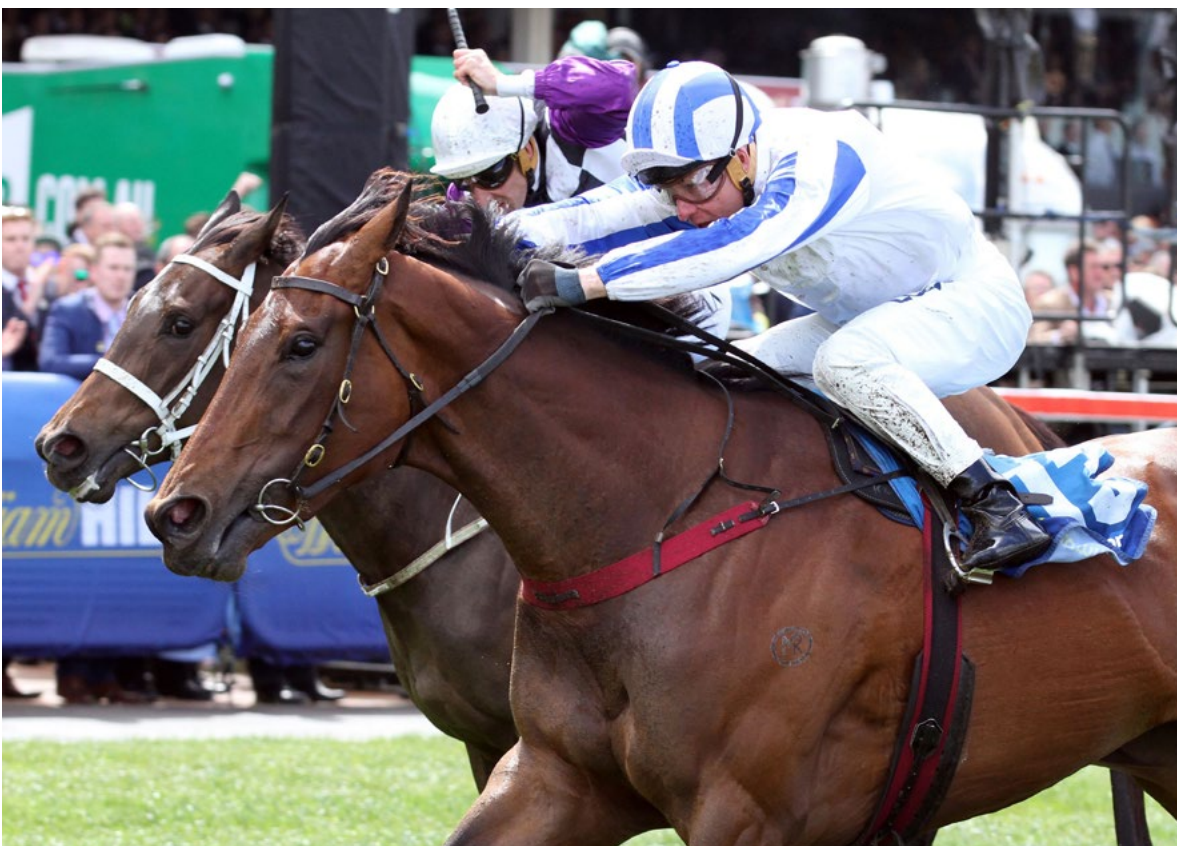
Well performed mare Nurse Kitchen will resume for Kris Lees at Rosehill this weekend