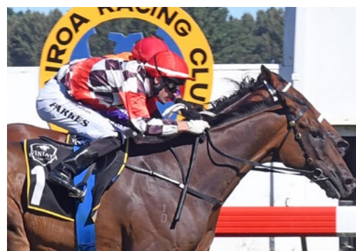
Wait A Sec (NZ) (Postponed)