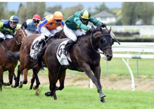
Magnum (NZ) (Per Incanto)

"He's had a few issues and can be a bit temperamental. I'm not 100 per cent sure if he's staying with us - I hope so."