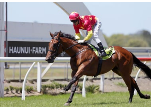
Aim Smart (Smart Missile)