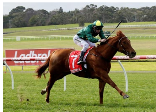
Trilli (NZ) (Per Incanto)

Wise Men Say has won five times over the big fences and is the current Great Northern Steeplechase (6400m) title-holder.