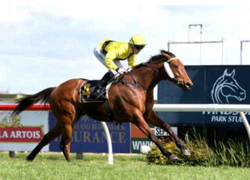
Watch This Space (NZ) (Elusive City)

Wait A Sec won the Gr.1 Livamol Classic (2040m) last spring and subsequently added the Gr.3 Anniversary (1600m) and the Wairoa Cup (2100m) to his record.