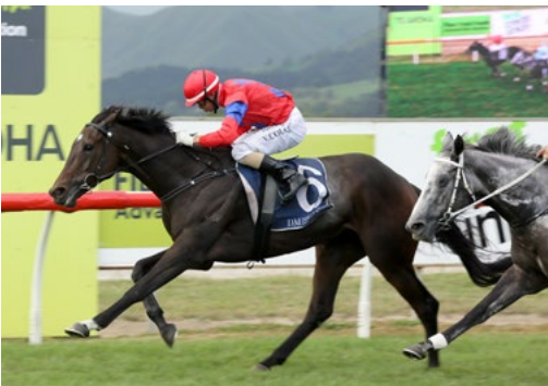
Miss Wilson (Stratum)