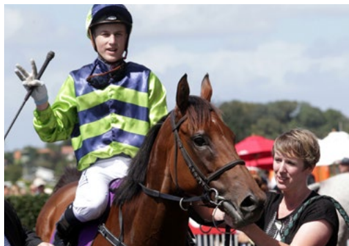
Yearn (NZ) (Savabeel)

Expectations are high for the spring campaign of the multiple winner Yearn (NZ) (Savabeel).