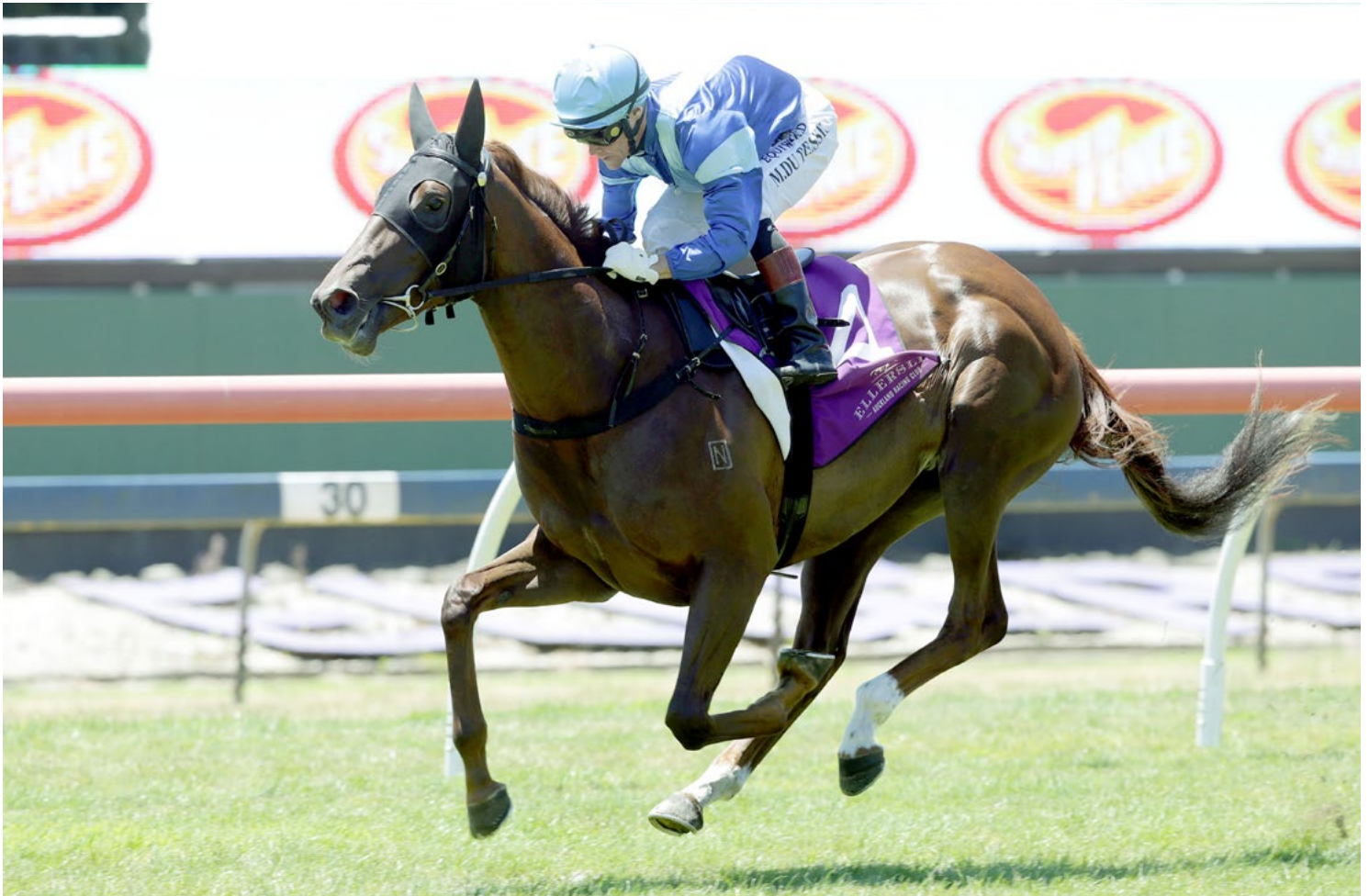
Group One placed filly Spanish Whisper will do her future racing in Australia