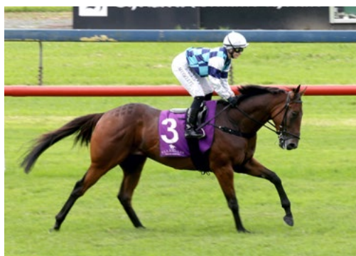
Endowment (NZ) (Savabeel)