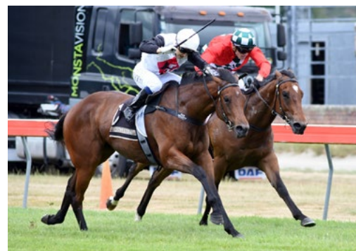
Xpression (NZ) (Showcasing)

"We might be a little bit late to get to the 2000 Guineas - we might still get there - but there's still the Levin Classic and other races," he said.