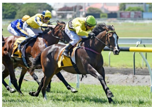
Bit Lippy (NZ) (Showcasing)