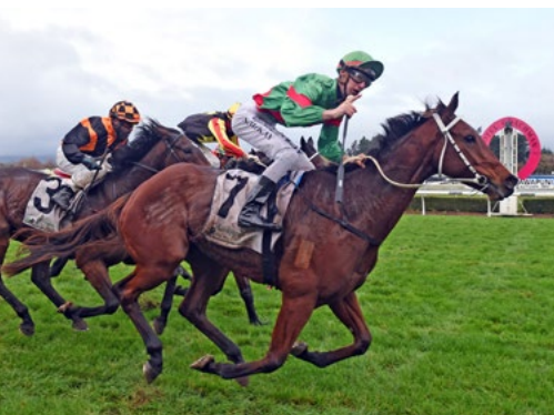
She's Poppy (NZ) (Alamosa)

"I haven't worked anything out for them yet, but we'll be looking at some fillies and mares' races for Livin' On A Prayer."