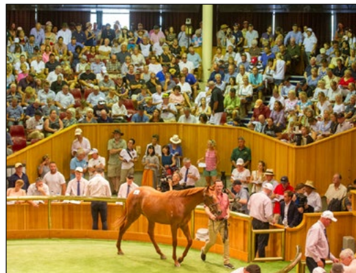
Karaka 2019 will be host to another packed and world-class buying bench with 2018's successful new format to continue.