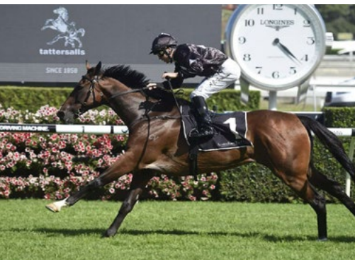
Ecuador (NZ) (High Chaparral)