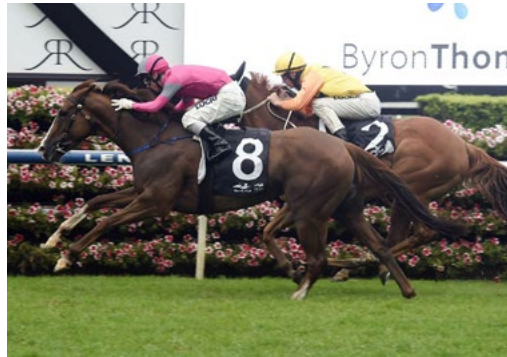
Your Way (NZ) (Thewayyouare)

"He is a handy horse, he has been honest all throughout his career. I like him, he's a nice horse." Full story here