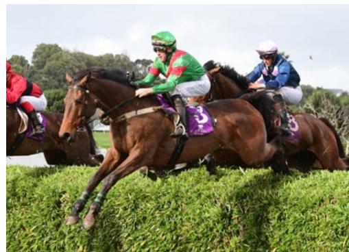
Wise Men Say (NZ) (Yamanin Vital)

A change of venue on Saturday will be far more to the liking of the well-performed jumper Wise Men Say (NZ) (Yamanin Vital).