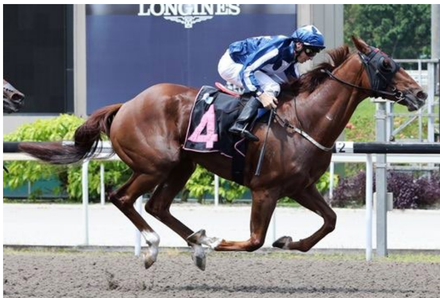
Duke of Normandy is well in charge as he scores at Kranji

“His sectional times have been fantastic ever since he’s been with me. He was more of a 2000m horse before he came to me, but I’m glad he’s shown he can be dropped back and