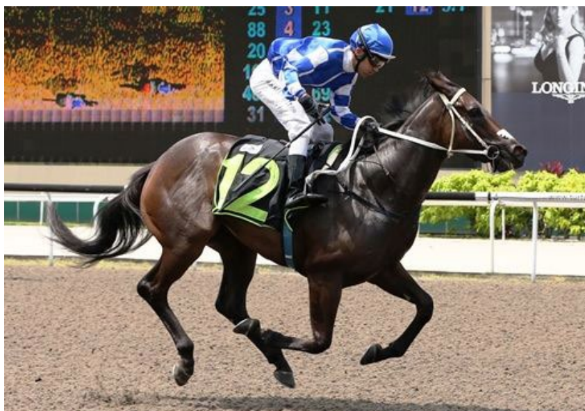
Bringer of War breaks her maiden status at Kranji