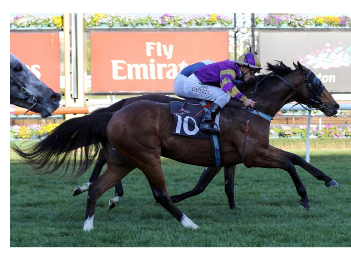
Bullish Stock finds a final surge of energy to snatch a win in the Benchmark 90 1800 at Flemington.

Bullish Stock was racing for the second time this preparation and Hayes said he will step up the distances for