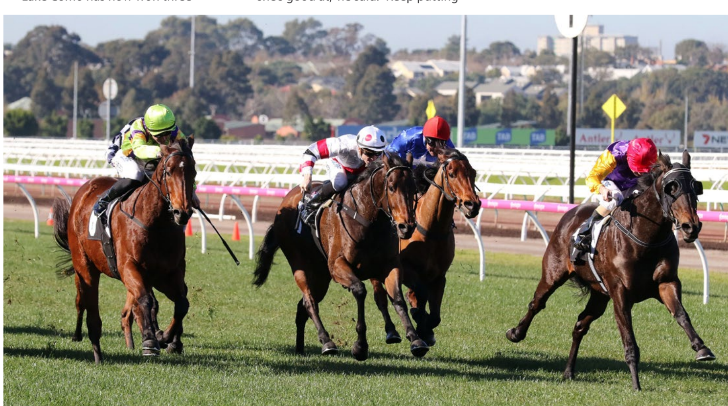
On her favourite track and with the finish in sight, Lake Como (blinkers) knuckles down to the task of holding the opposition at bay.