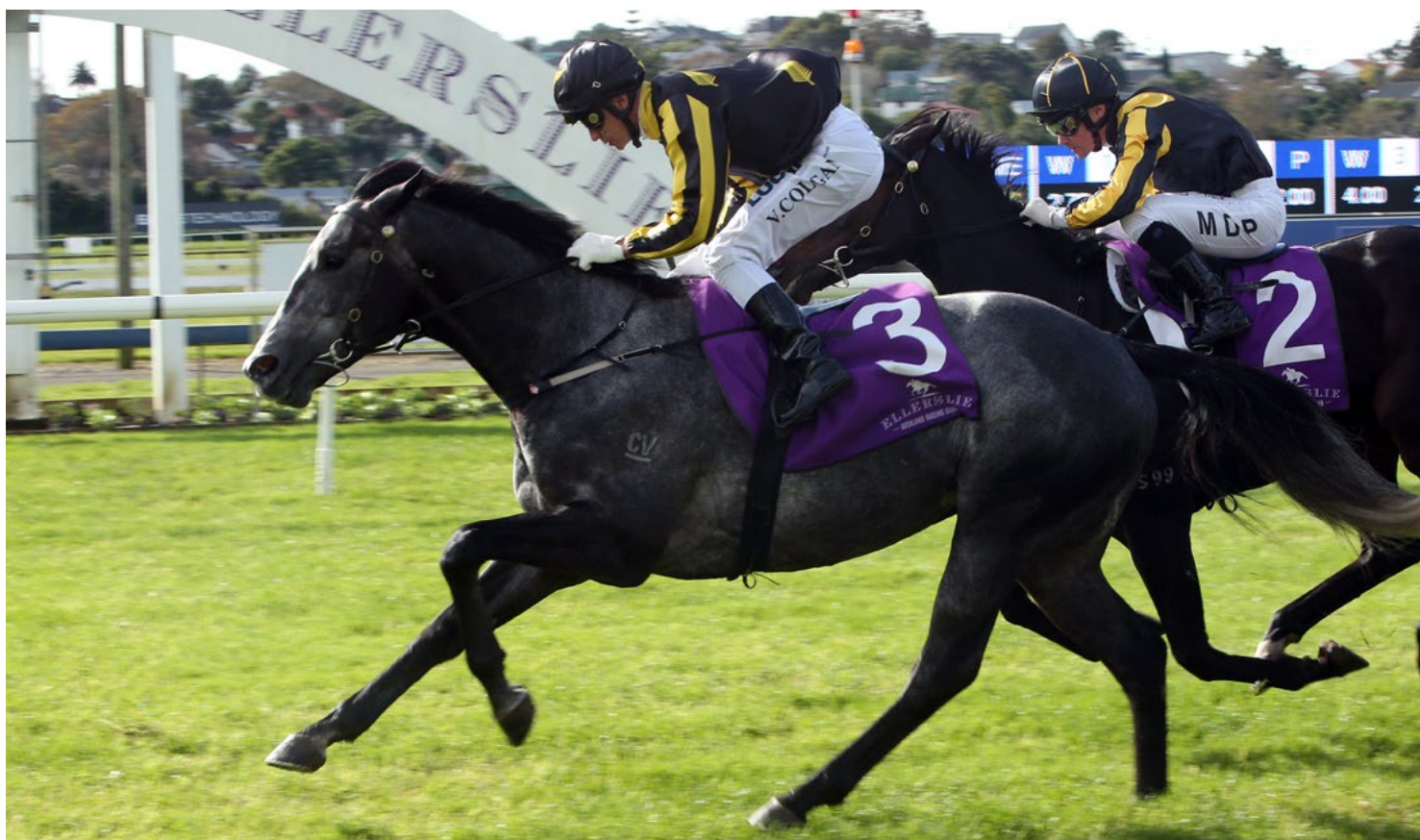
Battle Time outtoughs Brilliant Shine in yesterday's testing conditions at Ellerslie.