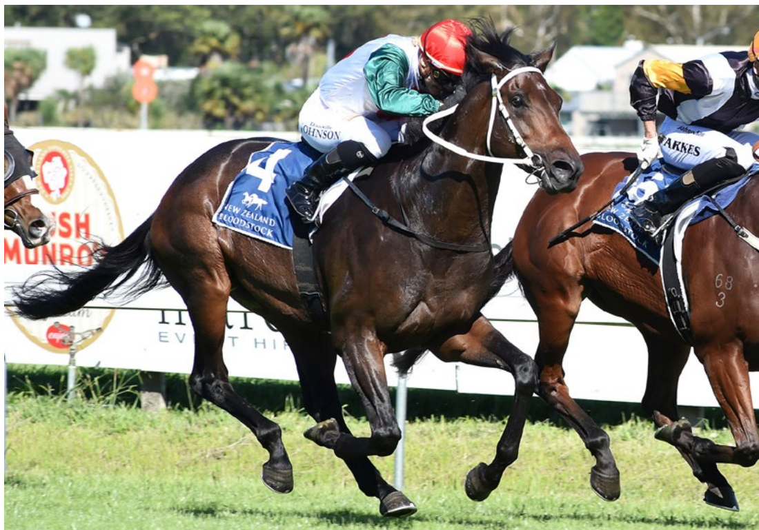
Prince Hareem in winning form at Hastings.

Third in his Australian debut in the Group Three Chairman's Handicap, the four-year-old was all at sea in the heavy ground when unplaced in the Group Three Premier's