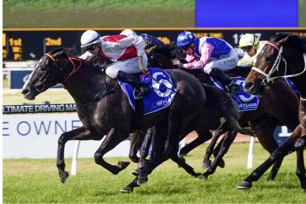
Golden Organic appreciates the 1500 metre journey as he fights on too well for his fellow juveniles at Rosehill.

"We were a bit worried about coming into this race given the barrier that he drew but the horse has been going really well and the alternatives weren't really