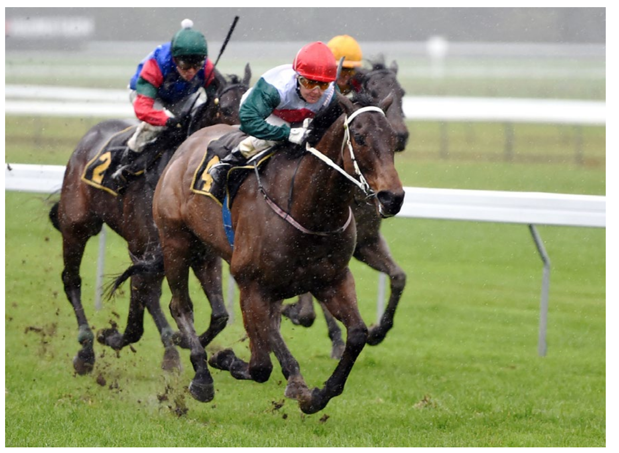
El Duque has the opposition at Otaki well covered.