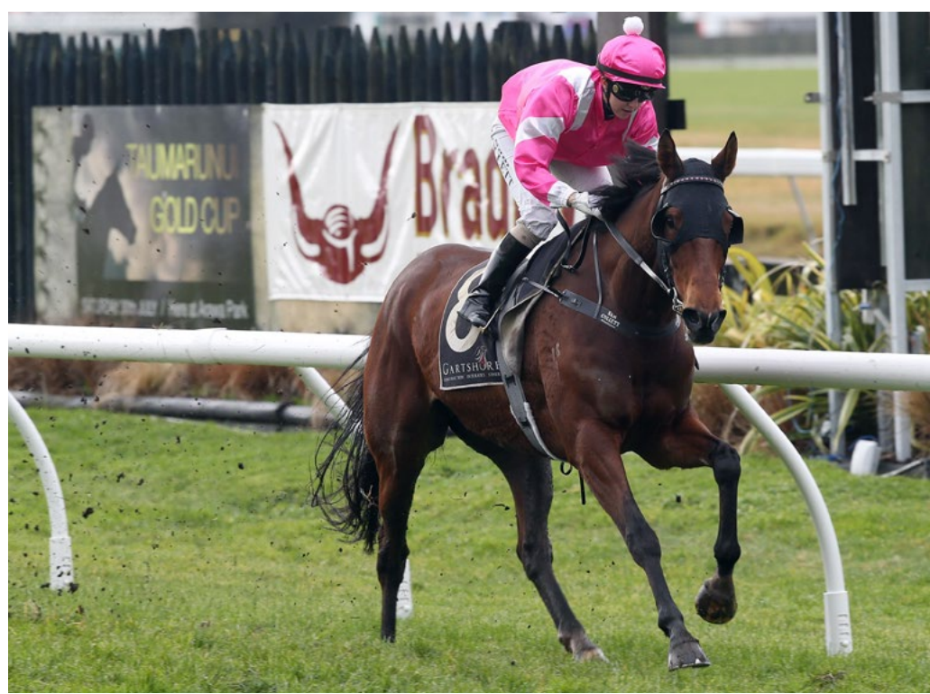
It's Jochen Rindt first, the rest nowhere at the finish of the Taumarunui Gold Cup.