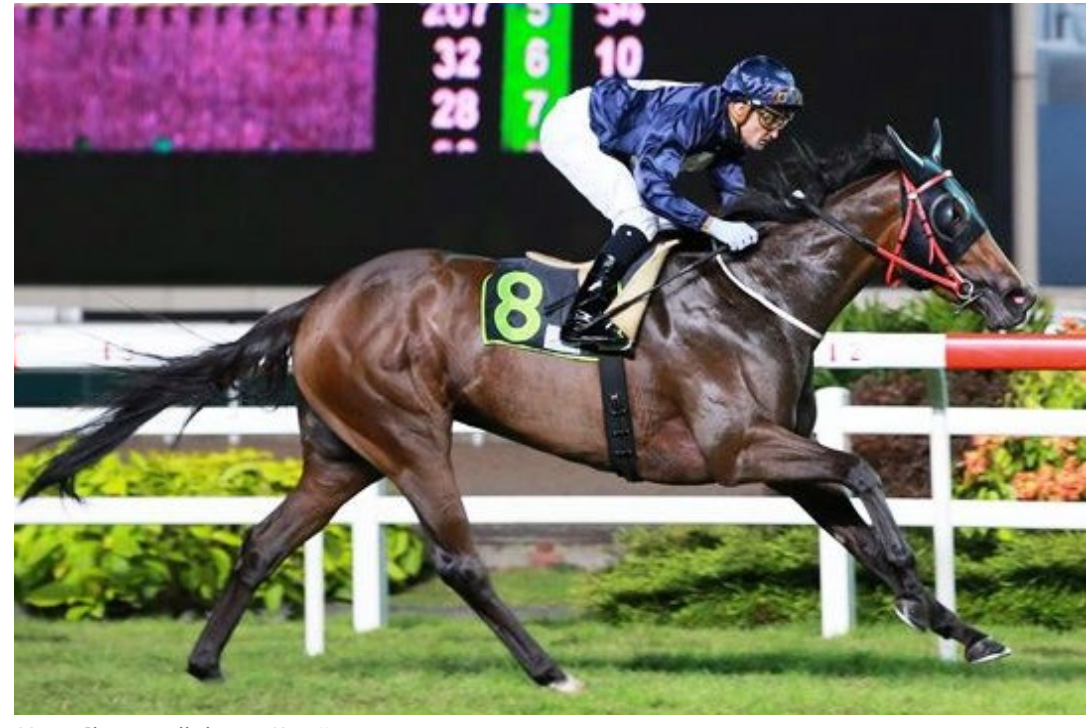
Moon Charm well clear at Kranji.

"She really surprised me with her turn of foot," said the Australian. "She was so relaxed in the running but when Pusong Pinoy left the fence she dropped off and came back for me.