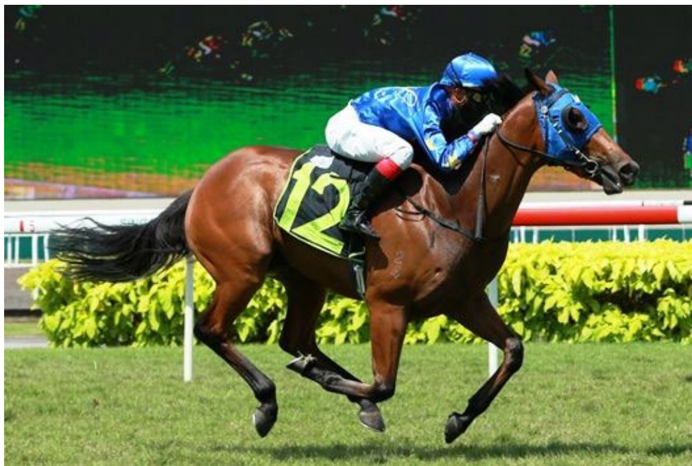
Refresh upsets the favourites at Kranji

"Today, I asked CC Wong to go forward as I worked out