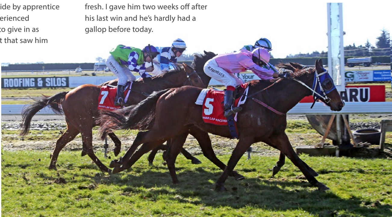
Flicka Of Gold gets in the deciding stride at Timaru