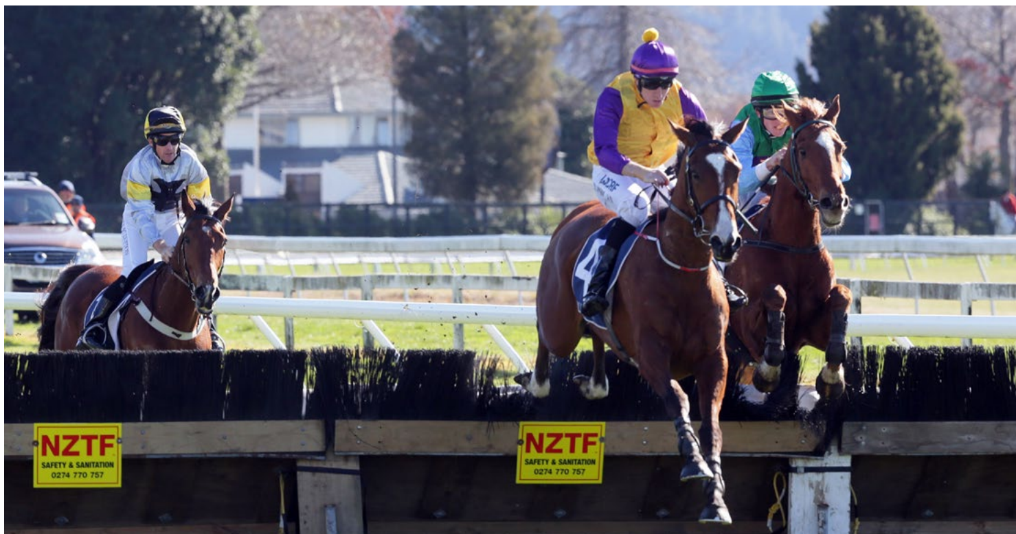
Monarch Chimes leads Ngario over the last in the open hurdles at Rotorua.

A new kid on the jumping block has given a number of his more experienced and better-performed rivals plenty to think about.