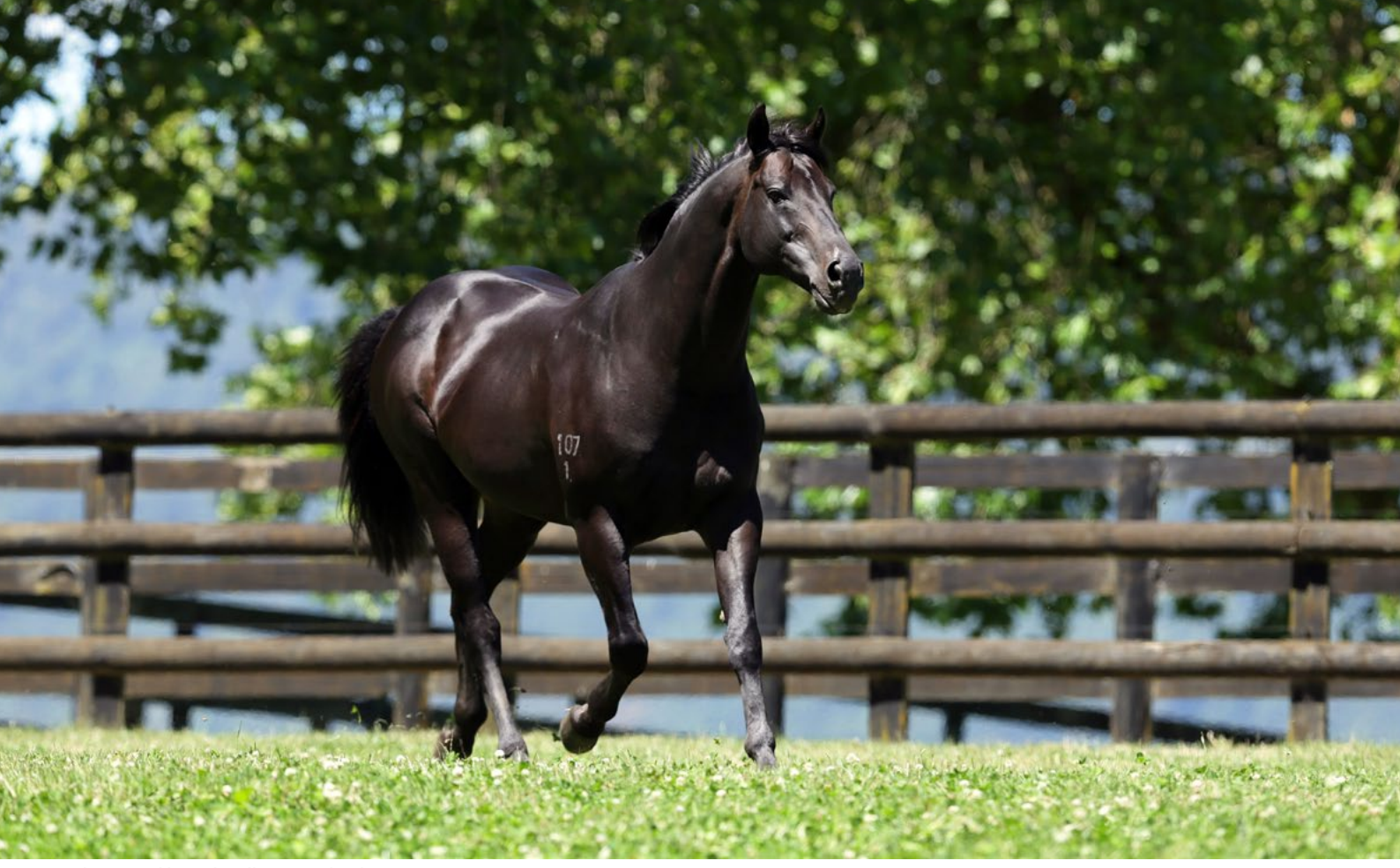
Waikato Stud based stallion Savabeel

t might seem like business as usual but closer examination of champion stallion Savabeel's achievements from the past 12 months reveals just how good his season has been.