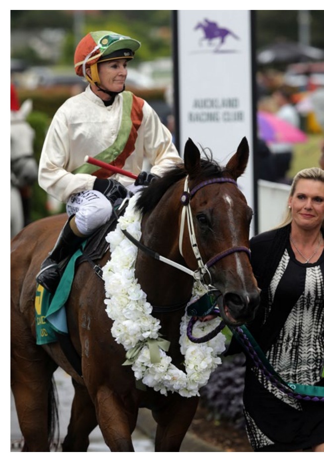
Veteran galloper Authentic Paddy returns to the winner's enclosure after winning the Gr.1 Zabeel Classic

"We have him nominated for all three days at Hastings so safely through Te Rapa he will head to the Tarzino Trophy on the first day of the Carnival there."