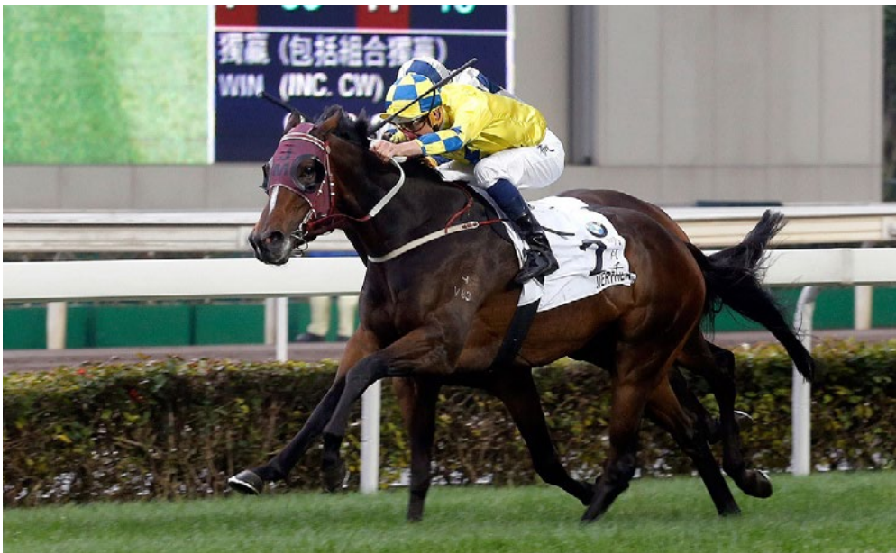
Hong Kong based superstar Werther in action. His dam Bagalollies is a contender for New Zealand Broodmare Of The Year.

Three stallion Awards will also be presented at the New Zealand Thoroughbred Horse of the Year Awards: the Grosvenor Award based on New Zealand stake earnings, the Dewar Award based on the combined stake earnings in Australia and New Zealand, and the Centaine Award based on worldwide earnings.