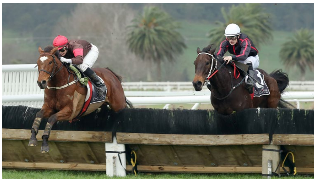
Raisafuasho (inner) is about to dash away from a game D'LLaro at Te Aroha