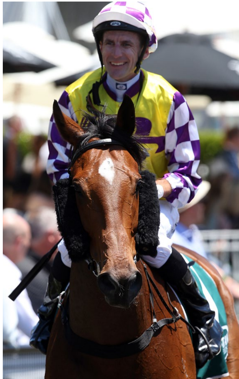
Gr. 2 Avondale Cup winner Sacred Master will make his Australian debut this weekend

He has also won 15 Group One races this season, headed by Winx's (Street Cry) Cox Plate and Doncaster Mile.