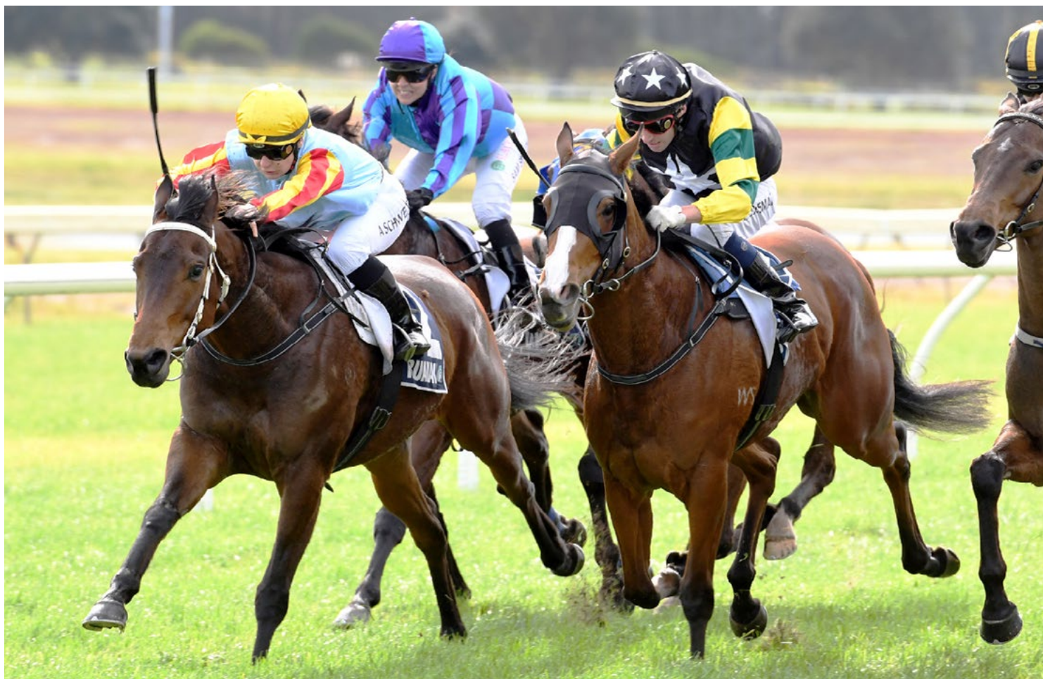
Magic Of The Sun scores narrowly at Ruakaka