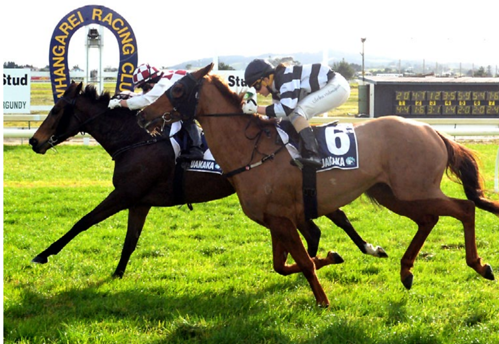
Illuminati and Viktoria Gatu add their fifth win as a combination at Ruakaka on the weekend

Foote admitted to a degree of confidence on the weekend due to several factors including the Dead6 rated Ruakaka surface.