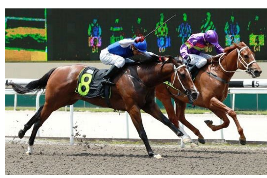
Yabadabadoo (inner) snatches victory on debut at Kranji