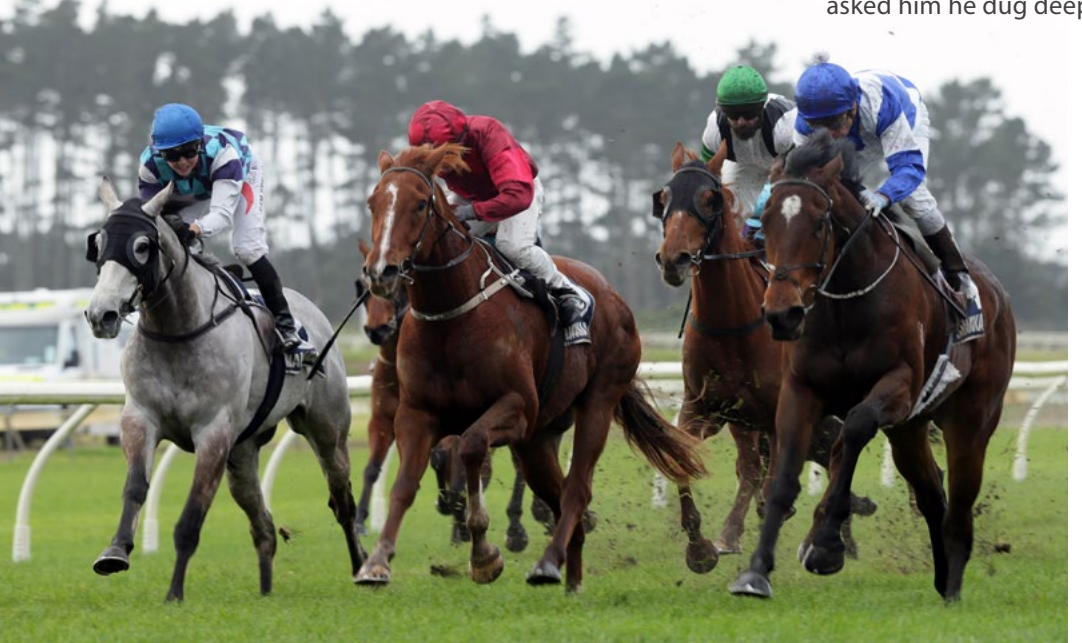
Mastercard (blue & white colours) storms home out wide to secure victory at Ruakaka