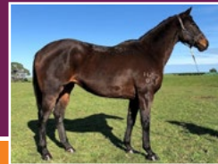
EMPTY DUAL WINNER BY STREET CRY.