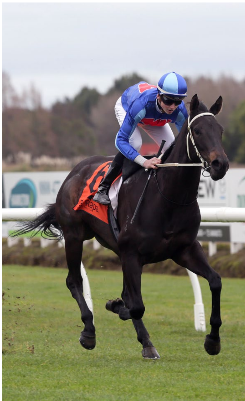
Classy filly (Our) Malambo has made a winning debut in Sydney