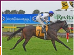
WINNING DARCI BRAHMA FILLY. RACE OR BREED.