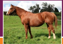
WELL-RELATED IMPORT IN FOAL TO TAVISTOCK.

BIDDING CLOSSES FROM 7PM MONDAY 23 JULY - REGISTER ONLINE NOW TO BID.