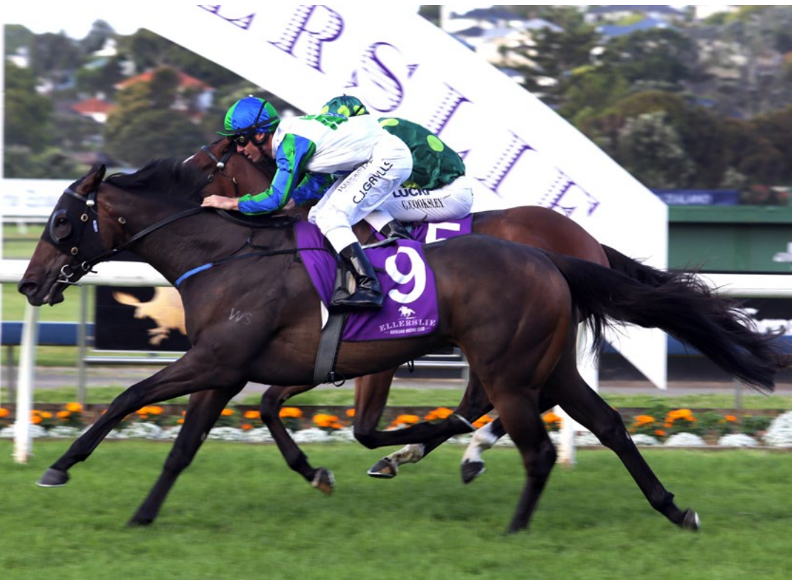
Well performed mare Coldplay will race from the Chris Waller stable during her spring campaign before heading to the broodmare paddock