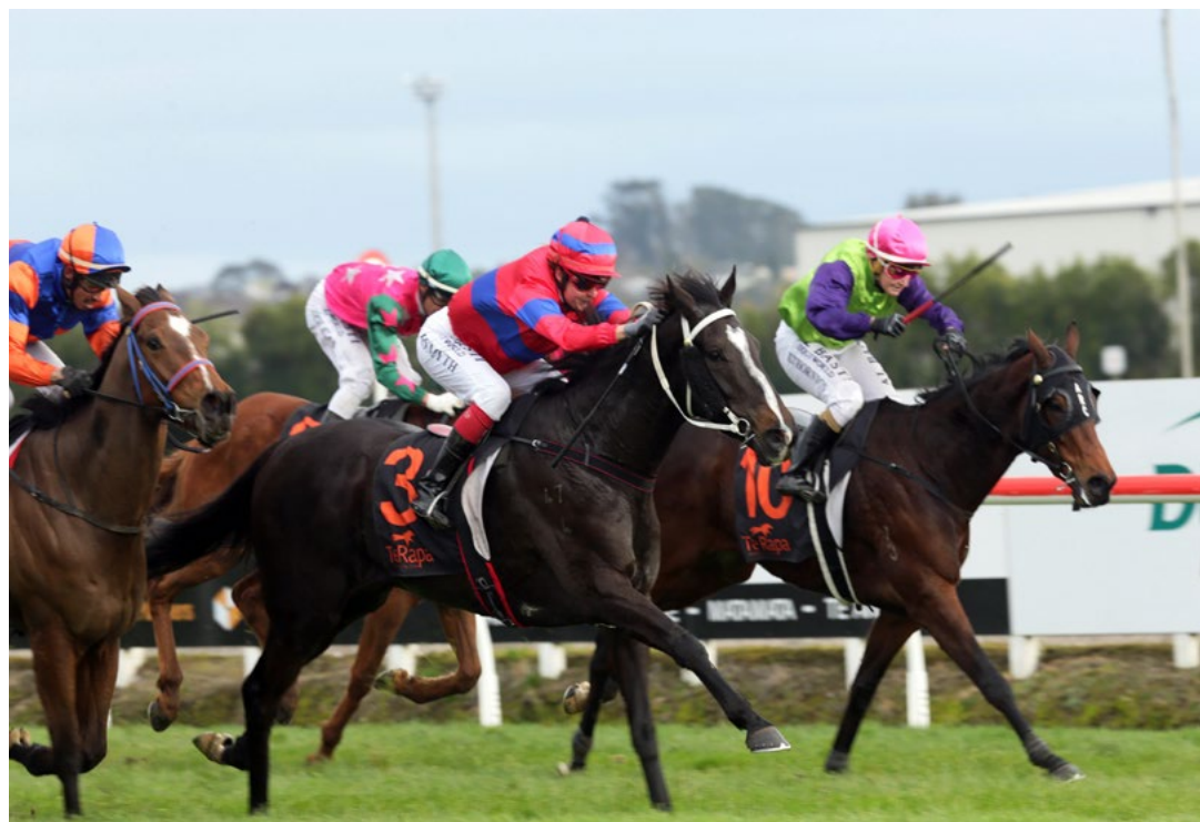
Promising galloper Verry Flash adds to his impressive record at Te Rapa