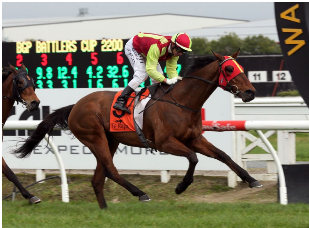
Athena Baby salutes for the first time on New Zealand soil

"He's still quite a way down on the order of entry for Hastings but if he performs in the Foxbridge, which is a