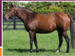
WELL-RELATED WINNER IN FOAL TO BURGUNDY.