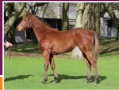
UNRESERVED PINS FILLY.