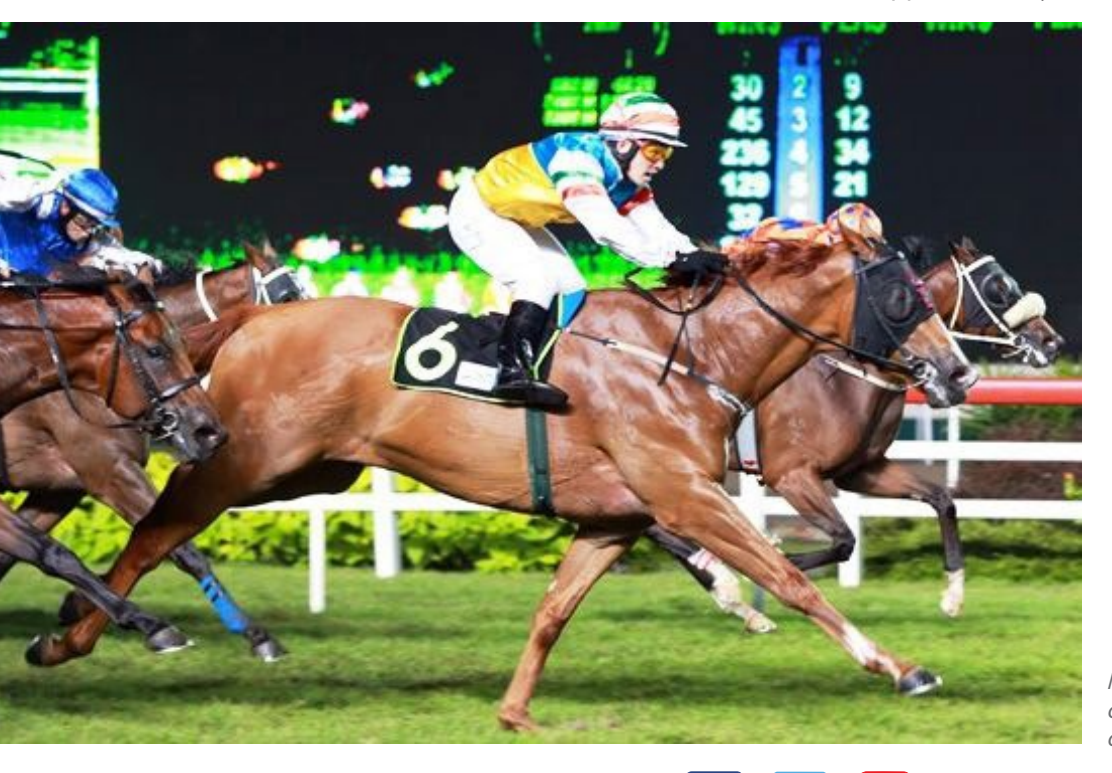
Muscular Sprinter (nearest camera) hangs on grimly to clear maidens at Kranji.