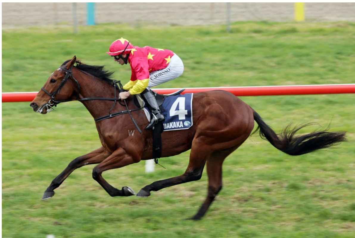
Classy customer Aim Smart bolts home at Ruakaka