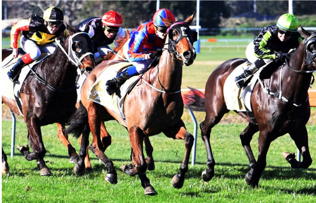
Gritty mare Red Sierra made it three wins from four starts in this campaign with her Trentham victory

"She's a funny little thing (Red Sierra) but she keeps doing the job so