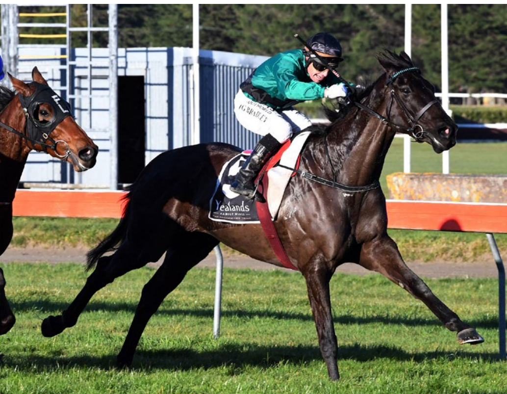
Dez may be heading to the Riccarton Winter Carnival after his gritty Trentham victory