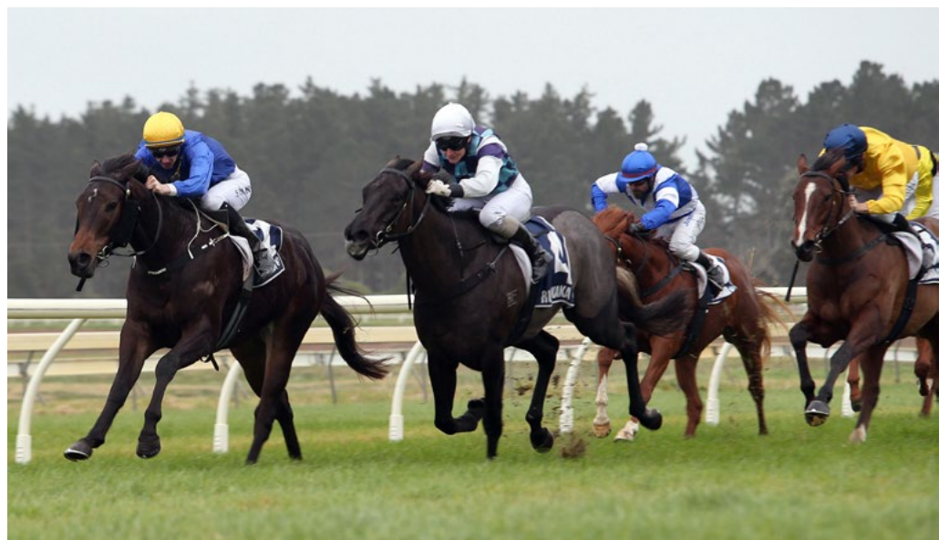
Barcelo (gold cap) slips through on the inside of Barabas to win the juvenile event on yesterday's Ruakaka card.