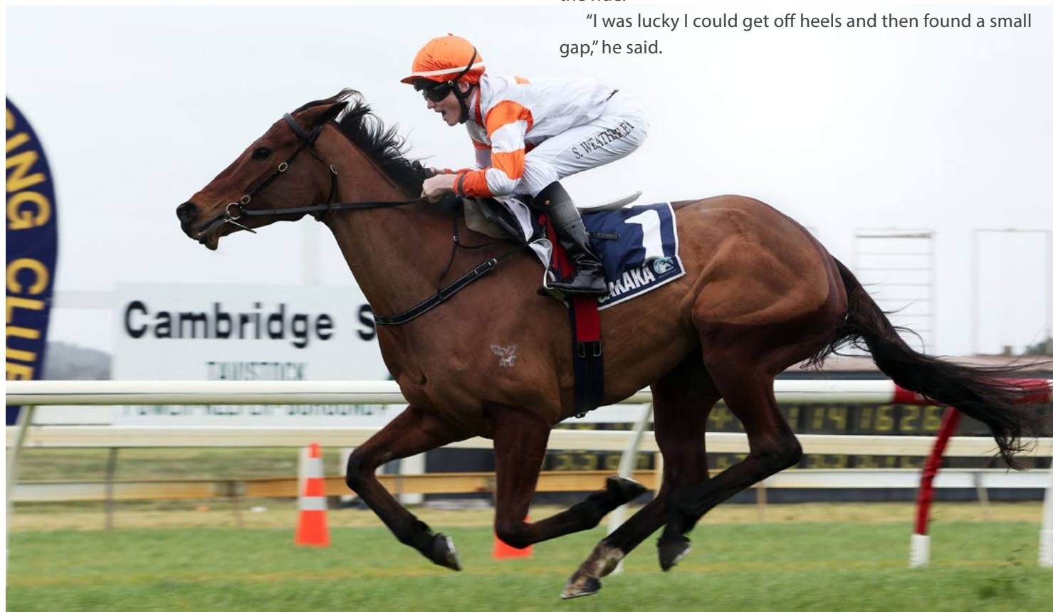
The class horse of the field, Candle In The Wind shows it at the end of a tough 2100 metres at Ruakaka.