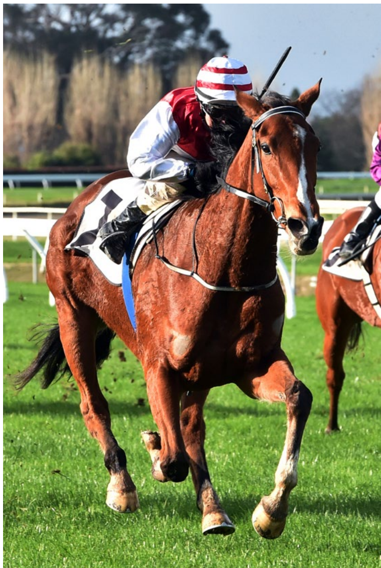
Ladies First travelling comfortably close to home in the three-year-old sprint at Awapuni.

Ladies First is scheduled to make her next appearance in a three-year-old race at New Plymouth in a fortnight.