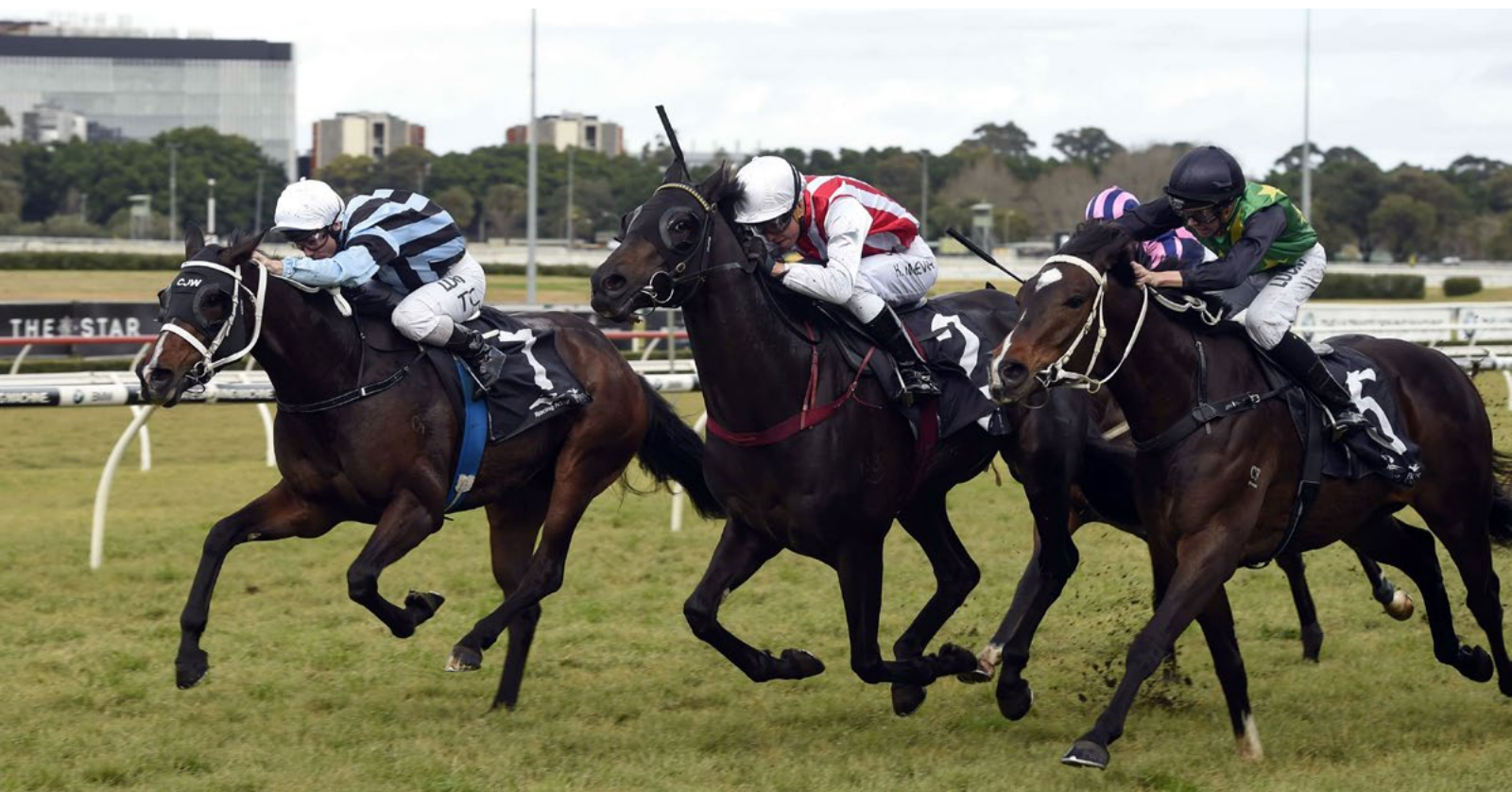
The race fitness of Firebird Flyer (blue and black colours) tells as she edges out her three-year-old staying rivals at Randwick.

One-time Queensland Oaks prospect Firebird Flyer (NZ) (Stravinsky) has made it back-to-back wins in Sydney.