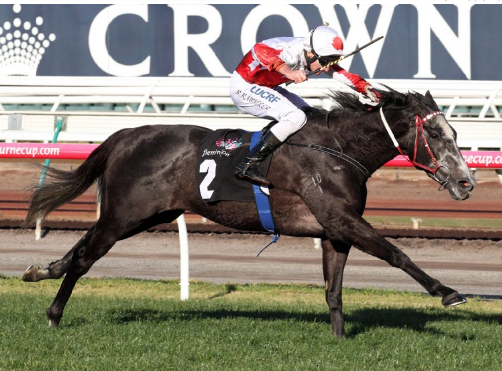
Master Of Arts clears out to easily win the Banjo Paterson Series Final at Flemington.

"You've got to pinch yourself, I guess."