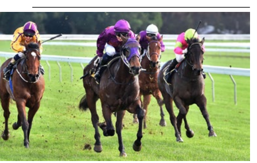
Manhattan Street (Manhattan Rain)

"The racing industry in China is still in its infancy, but thanks to people like Mr Lang it is growing at a rapid rate and we are privileged to be a part of it.