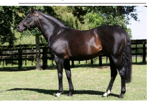
Pentire (Be My Guest)

The Karaka sale will be held on Friday, July 29 commencing at 12pm.