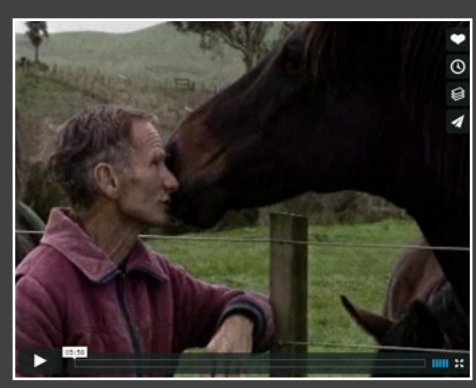
CLICK TO PLAY