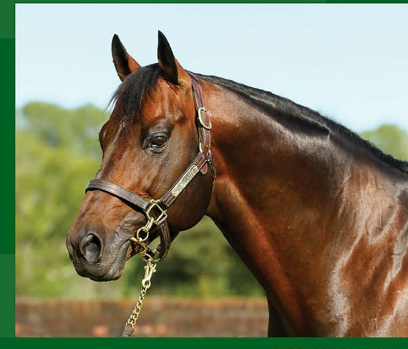
PER INCANTO $15,000 +gst LFG