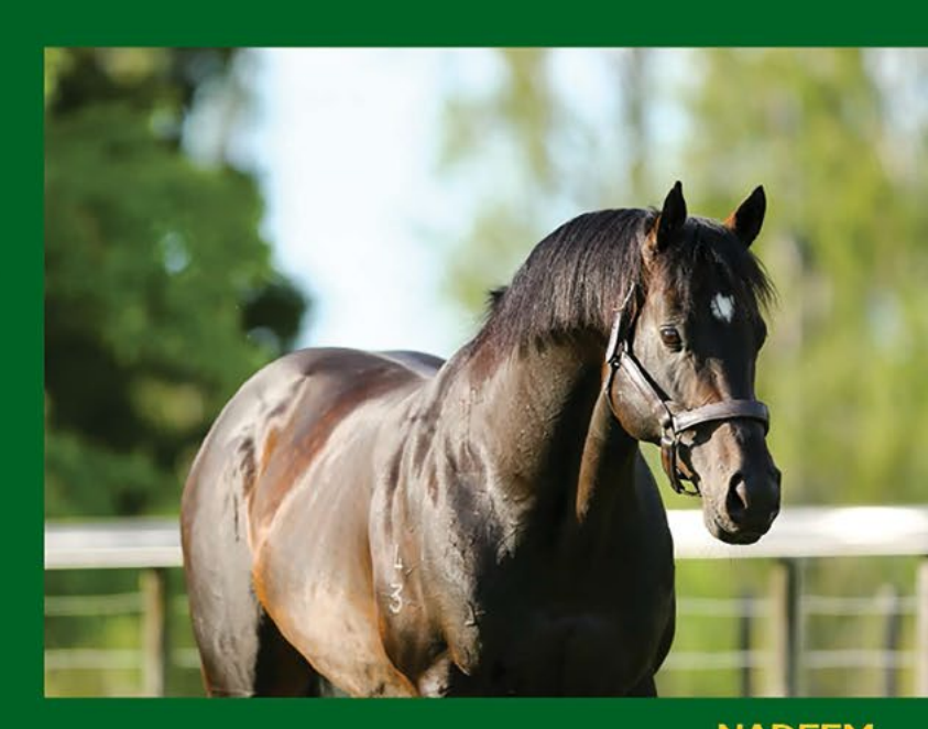
NADEEM $6,500 +gst LFG