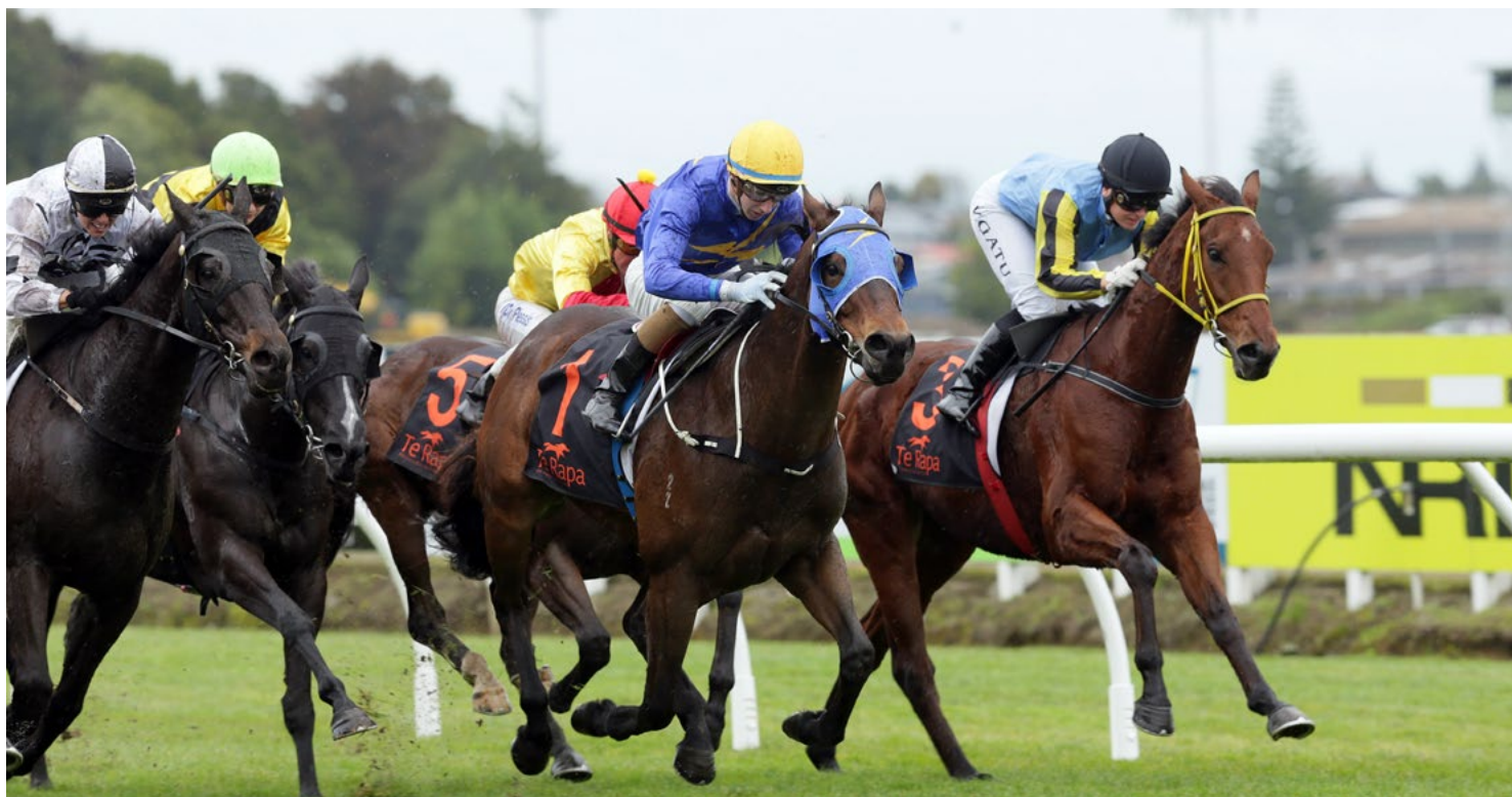
Amarula (gold cap) completes a strong effort under a big weight over 1600 metres at Te Rapa.