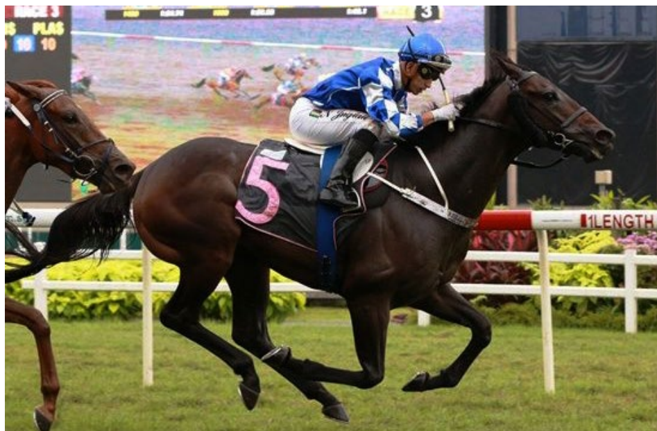
Song To The Moon returns to winning form