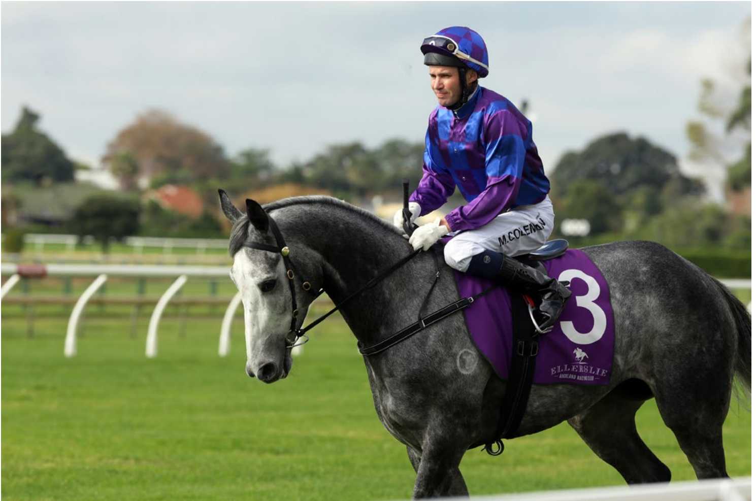
Classy galloper Megablast has taken out the Listed Caloundra Cup