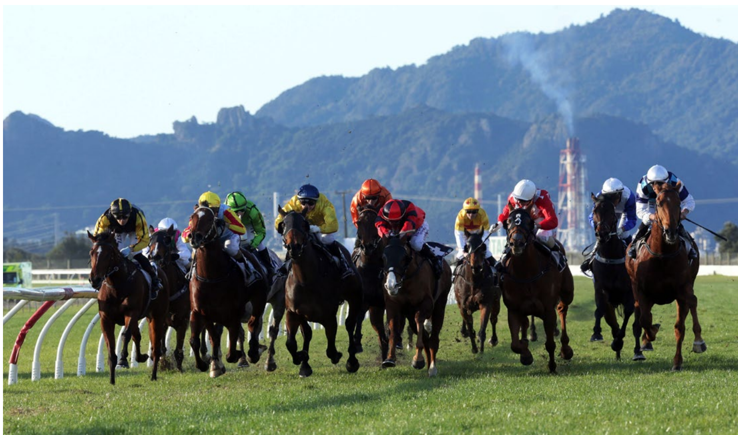
Ohceedee (red & black colours + white blaze) scores in a blanket finish