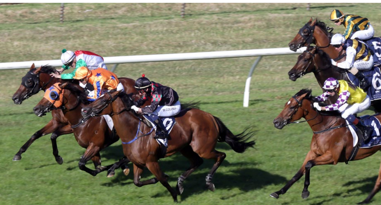
Volpe Veloce stretches hard (outer) to maintain her unbeaten record in a desperate three-way finish

focus switches to the Gr.1 Australian Guineas at Flemington on March 4.