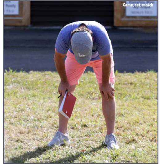
Game, set, match