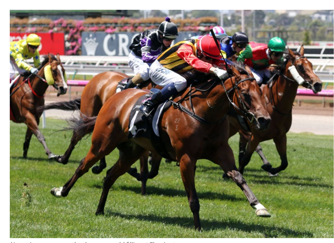
Navagio overpowers the three-year-old fillies at Flemington.

"The race turned out perfectly for us," the expat-Kiwi jockey said. "She