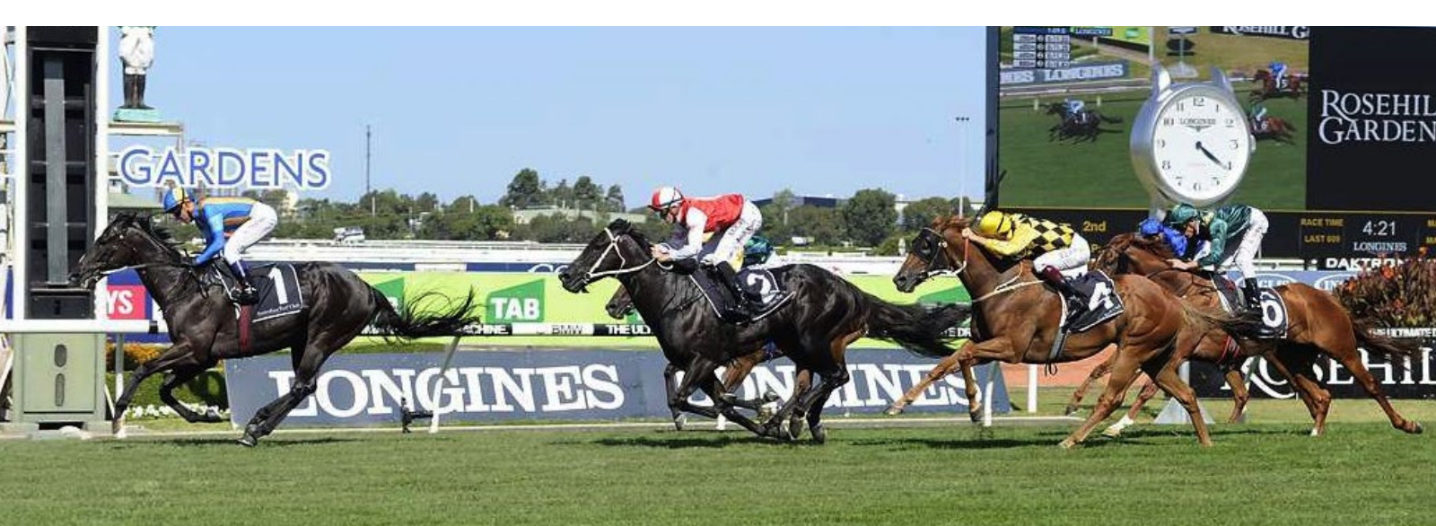
Music Magnate has no trouble winning the Expressway Stakes from fellow Kiwi-bred Kuro.