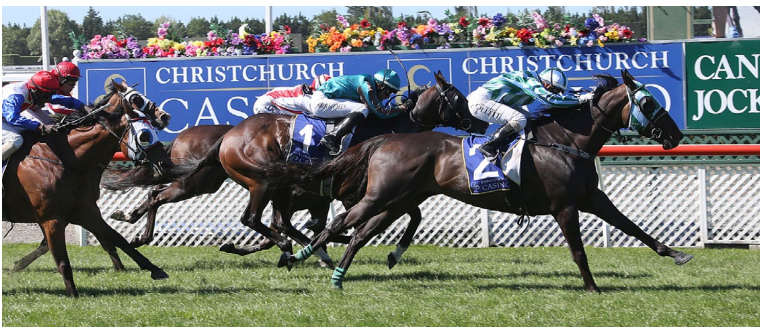
Maybe Miami stamps his class on the Timaru Stakes.

ocal runner Maybe Miami (NZ) (Iffraaj) mastered the gusty Riccarton wind with aplomb yesterday as he snatched a valuable black-type victory on his home track in the Listed Speight's Timaru Stakes.