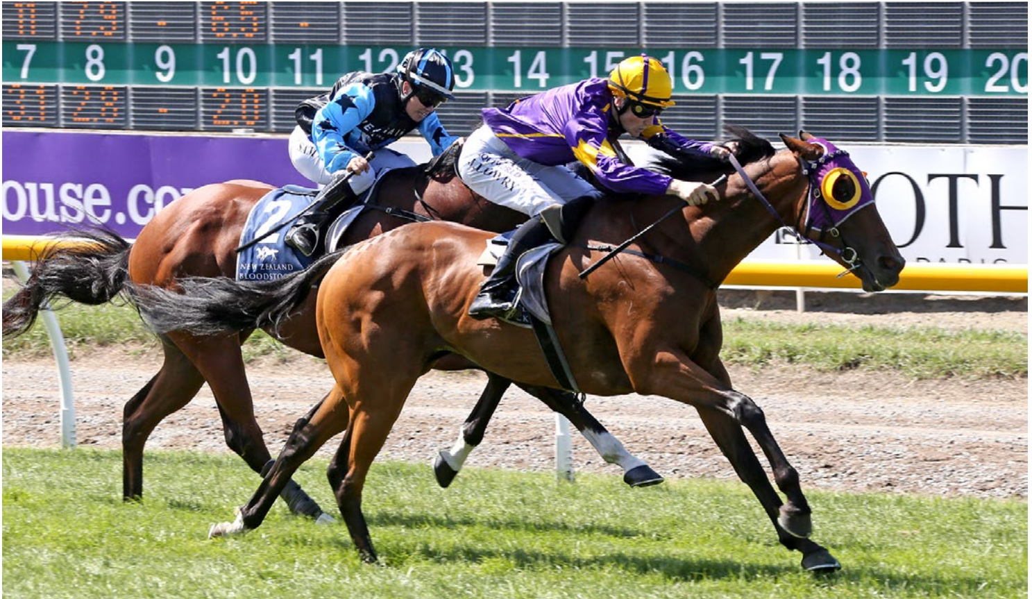
Consistent galloper Boots 'N' All' claims his first stakes success at Riccarton