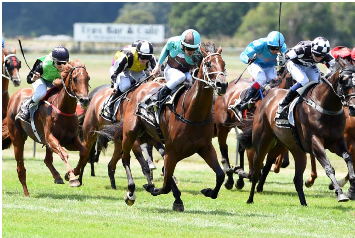
Smart three-year-old Irish Flame winning at Trentham

Fresh-up this season he finished third in the Listed El Roca – Sir Colin Meads Trophy (1200m) at Hastings and was unplaced