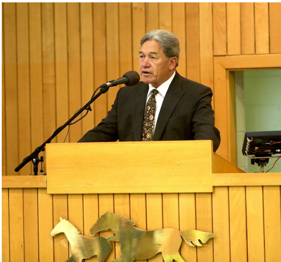
Deputy Prime Minister Winston Peters addresses the audience at Karaka

Peters also indicated that work was underway to introduce one or more artificial racing surfaces for the thoroughbred industry although locations and the timing of the developments were still to be confirmed. Peters expected more details would be available once the government finalised its first budget in May.