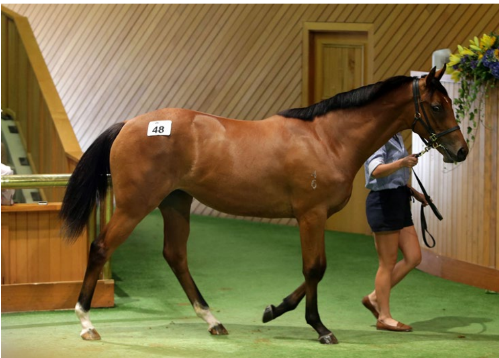
Lot 48, the stylish Tavistock filly that fetched $500,000 on Day One at Karaka