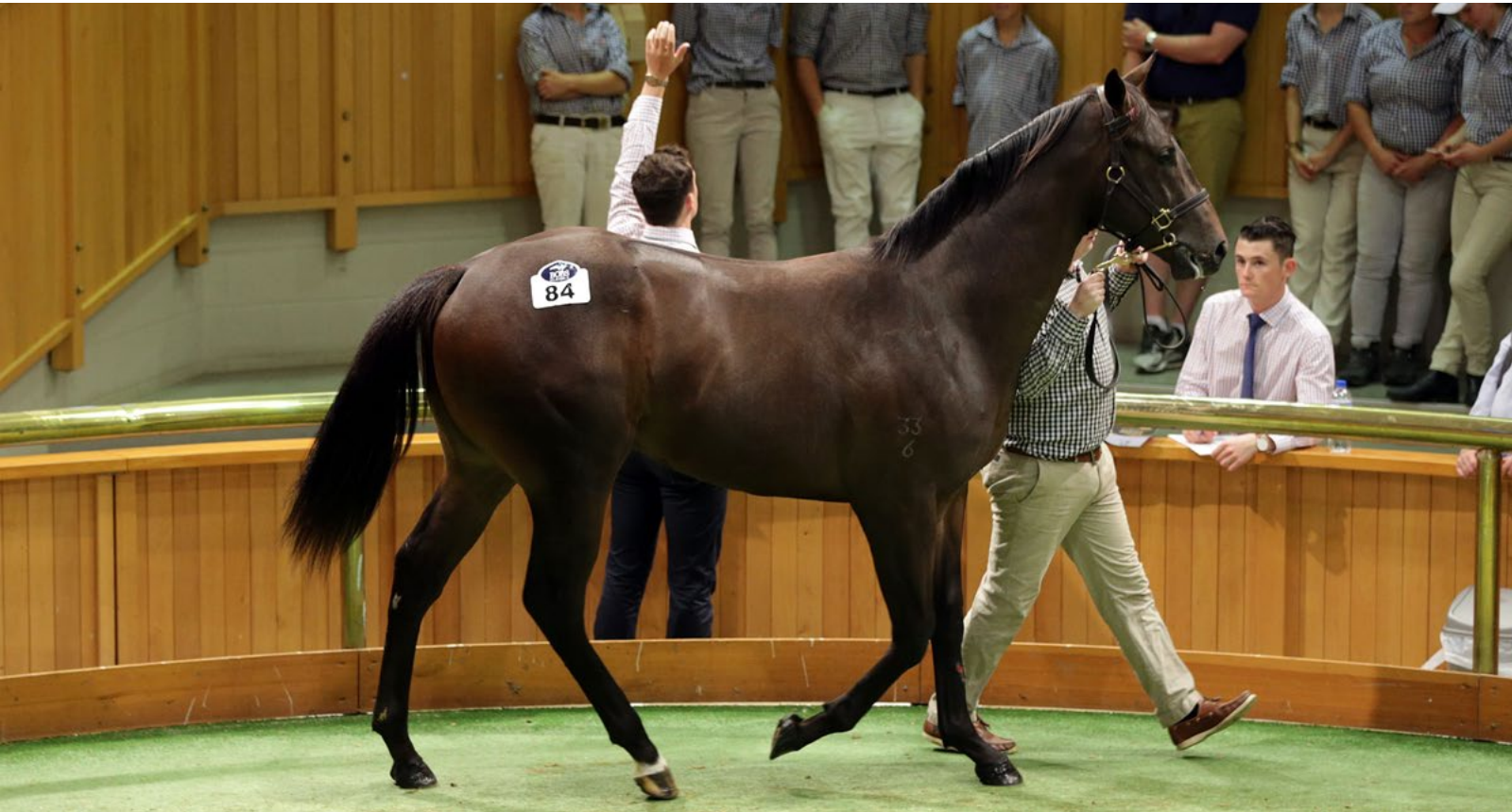
Lot 84, the More Than Ready ex Buckling colt