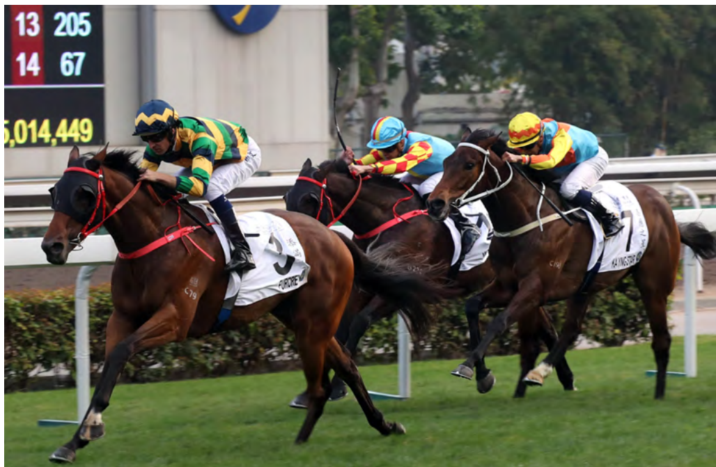
Furore winning the Hong Kong Classic Mile

Bowman backed that assessment. The Australian ace was on the ground