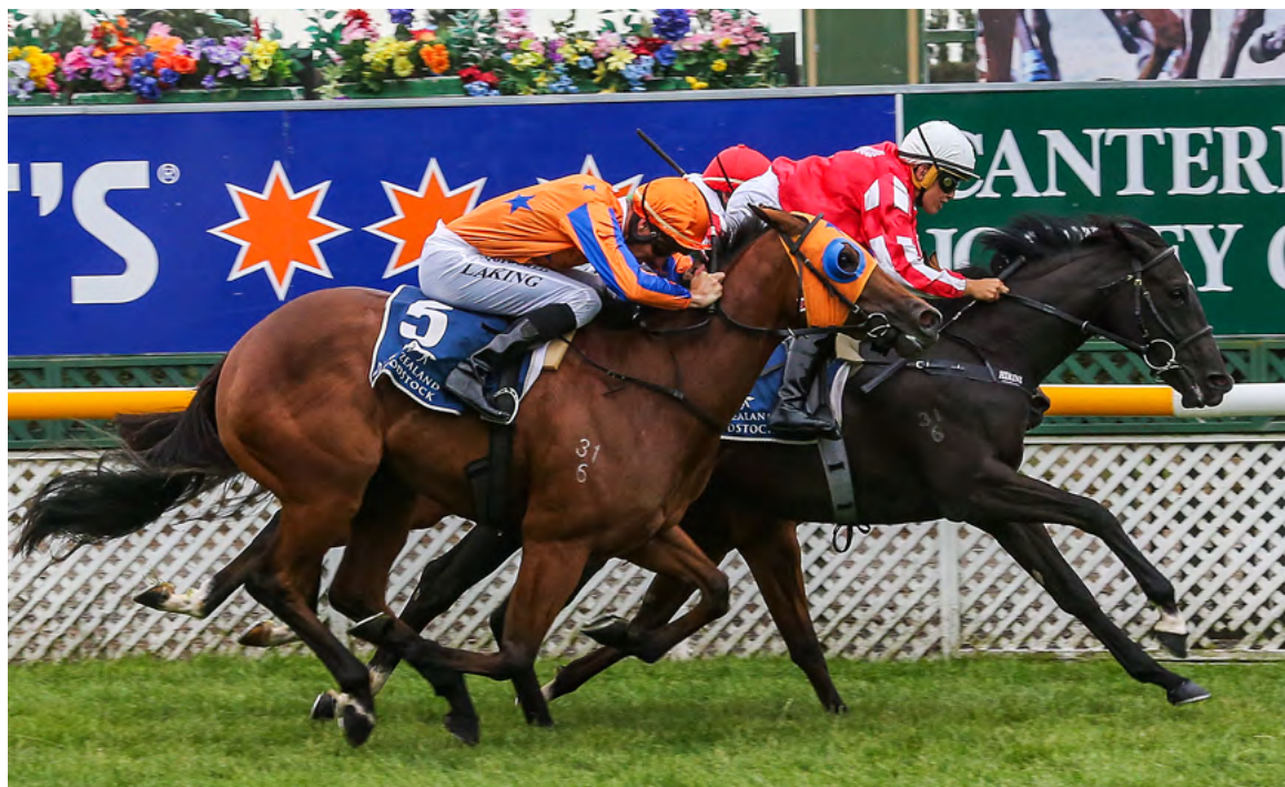
All About Magic finishes best to win at Riccarton