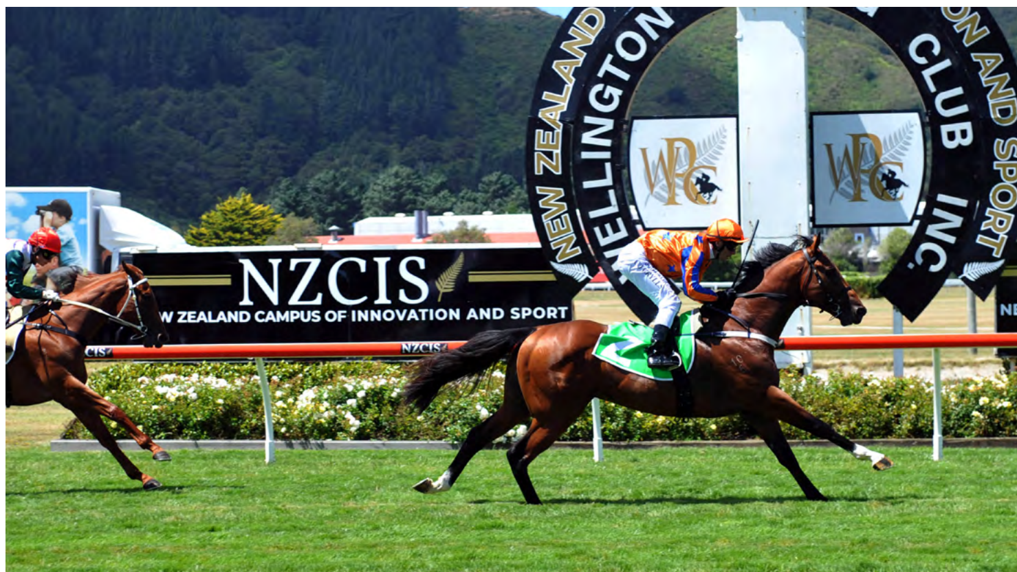
Exciting youngster Equinox cruises to victory at Trentham

O n the eve of the New Zealand Bloodstock National Yearling Sale series it was appropriate that one of the star individuals of the 2018 edition should create plenty of attention with a winning racetrack debut.