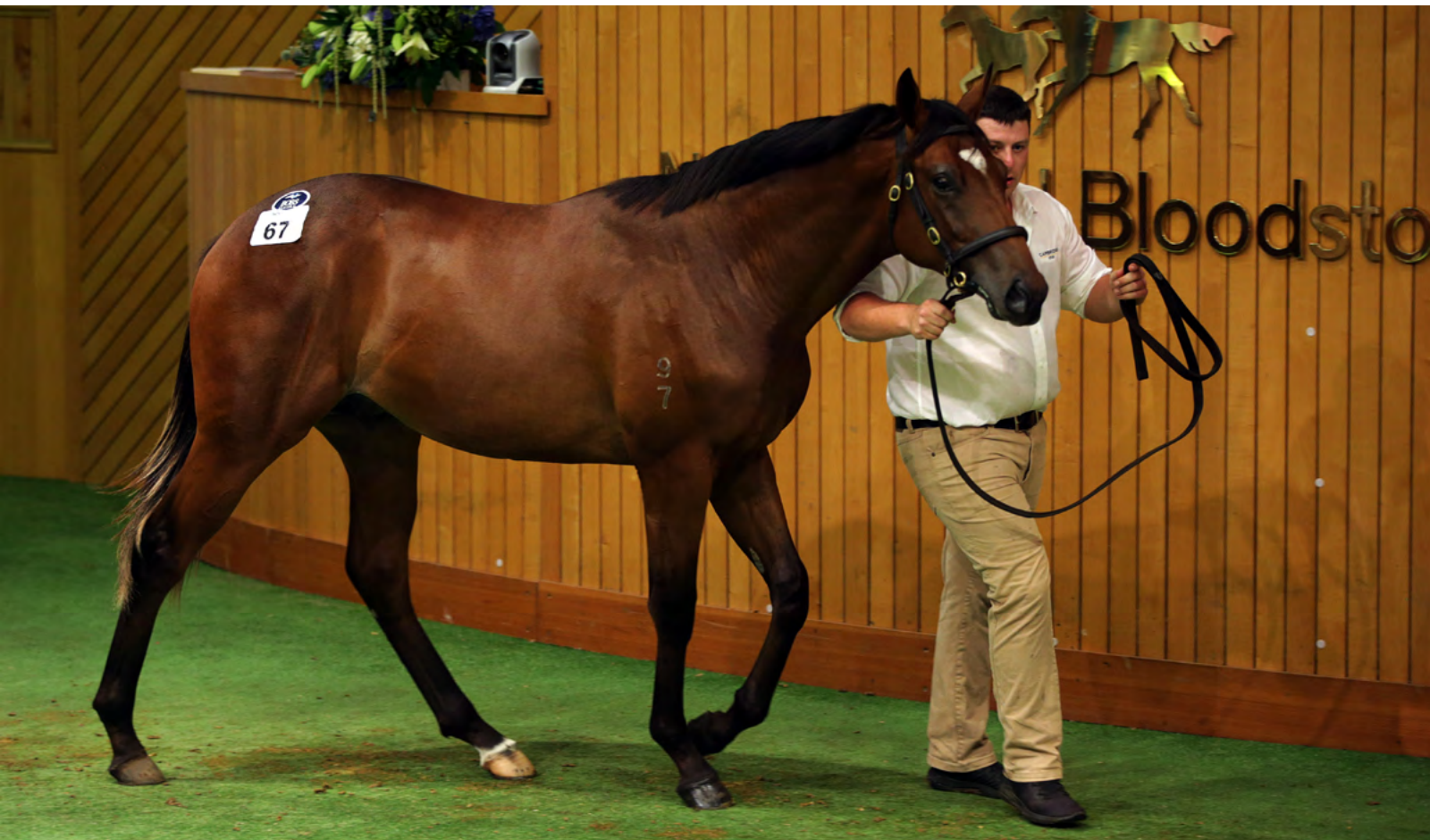
Lot 67, the sale-topping Redoute's Choice colt during Day One at Karaka (Trish Dunell)

B loodstock agent James Bester and Aquis Farm teamed up to secure the top lot on the opening day of New Zealand Bloodstock's Book 1 Sale on Sunday - lot 67, a Redoute's Choice colt out of Group One-winning mare Griante (Good Journey).