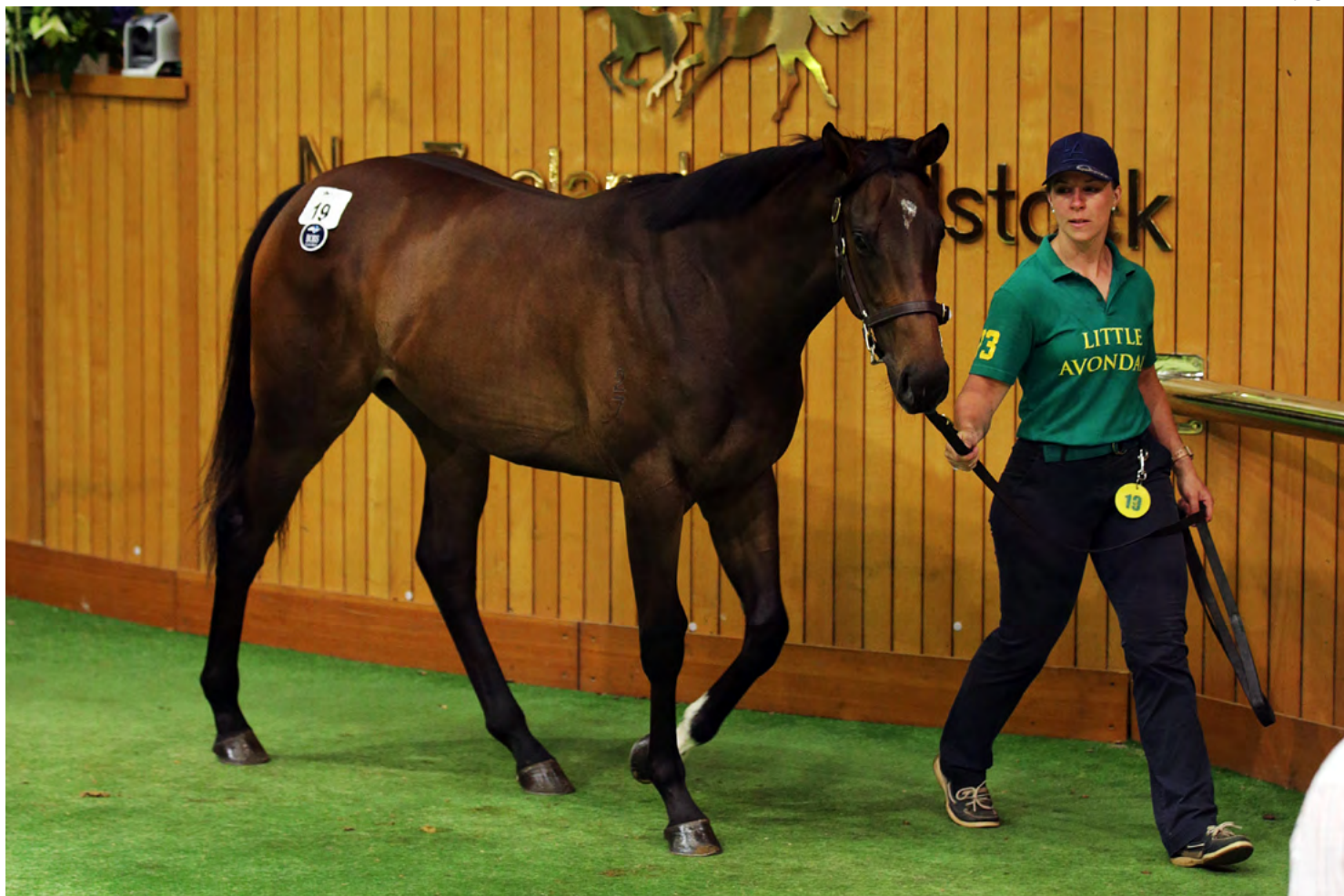
Lot 19, an I Am Invincible filly from the Little Avondale Stud draft parades in the auction ring at Karaka