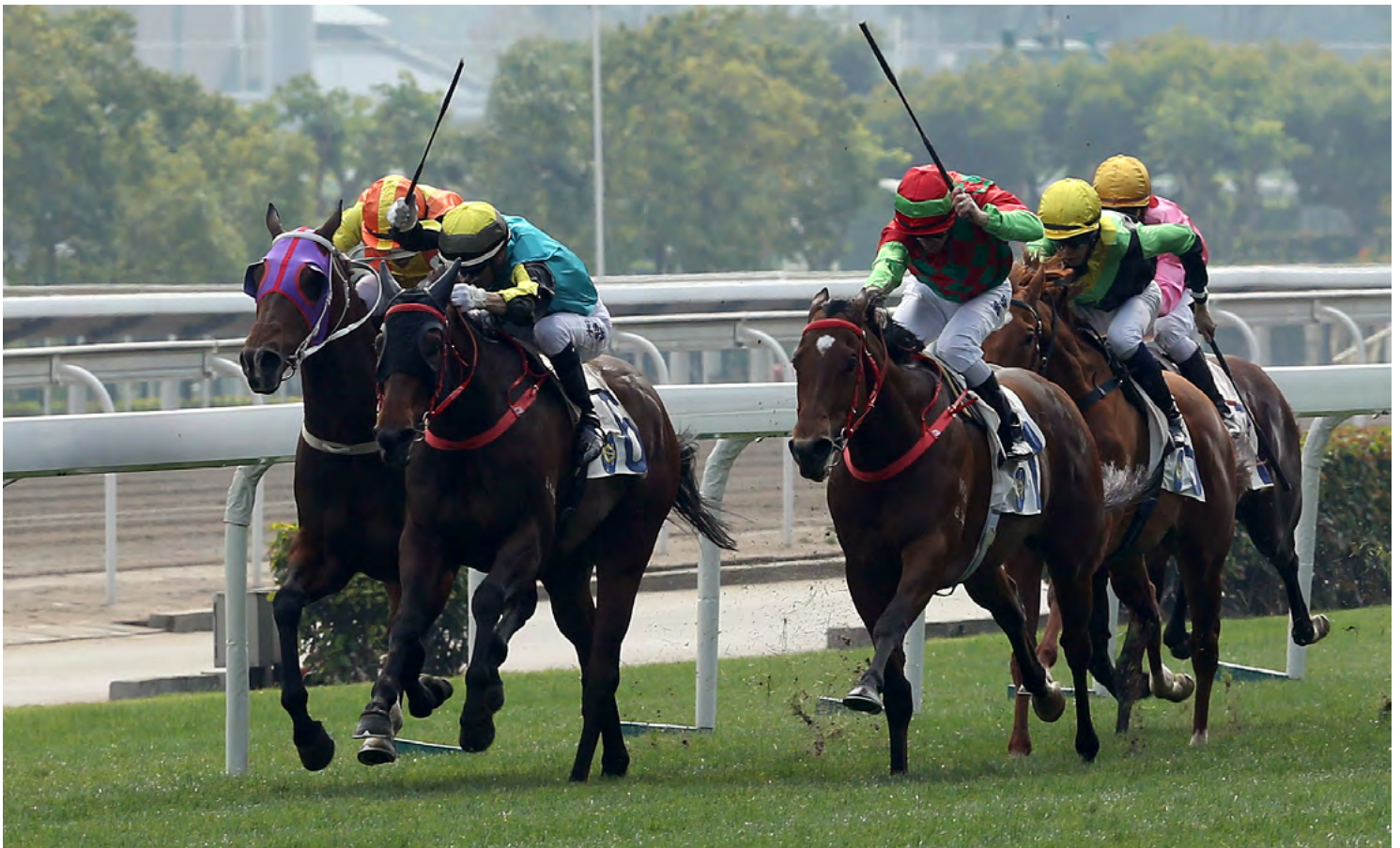
Regency Legend is unbeaten in three starts in Hong Kong