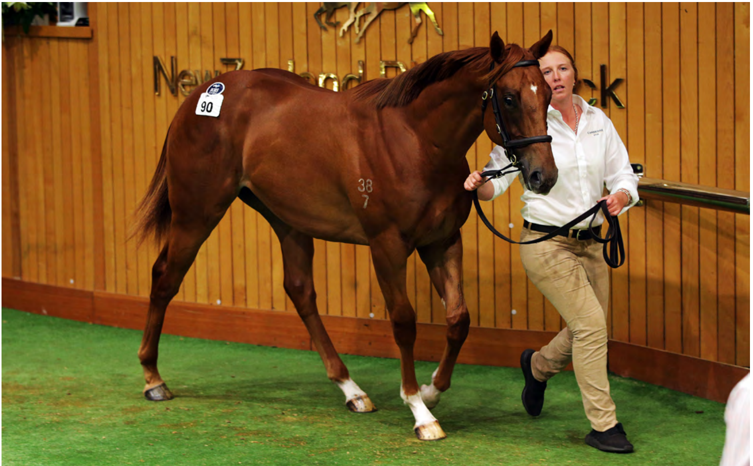
Lot 90, a Zoustar filly that fetched $600,000 on Day One at Karaka.

The variety and strength of the international buying bench in attendance at the National Yearling Sale at Karaka this year was in evidence throughout the opening day of the Book 1 sale.