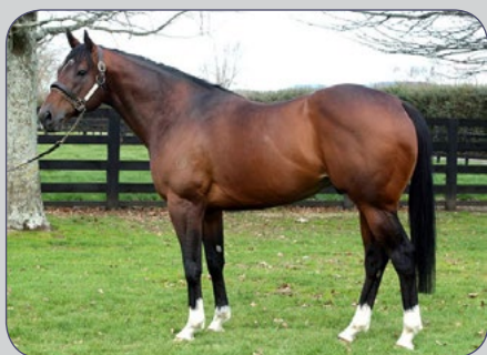
Shamexpress (O'Reilly x Volkrose by Volksraad) 19 Premier, 18 Select, 1 Festival 2014 Stud Fee: $16,000+GST

K araka 2017 will showcase the first yearling crops of 18 exciting new sires. Among the first crop sires are the New Zealand-based quartet – Shamexpress, Ferlax, Jakkalberry, and Sweet Orange. Below is a brief synopsis on each of the new sires represented, commencing with the NZ domiciled stallions.