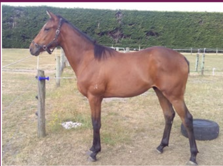
3/4 in blood to Rising Romance.

Featuring 11 lots including yearlings, broodmares, unraced and raced horses.