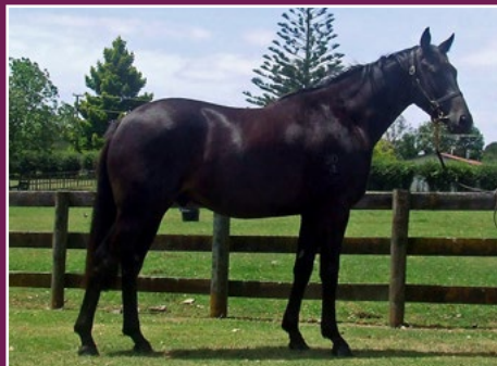
Nadeem 2yo from the Belle family.