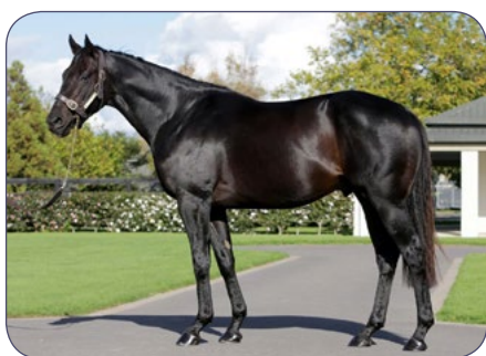
Ferlax (Pentire x Legs Akimbo by Marscay) 3 Premier, 14 Select, 7 Festival 2014 Stud Fee: $7,000+GST

For a link to the full list of yearlings by Shamexpress, click here .