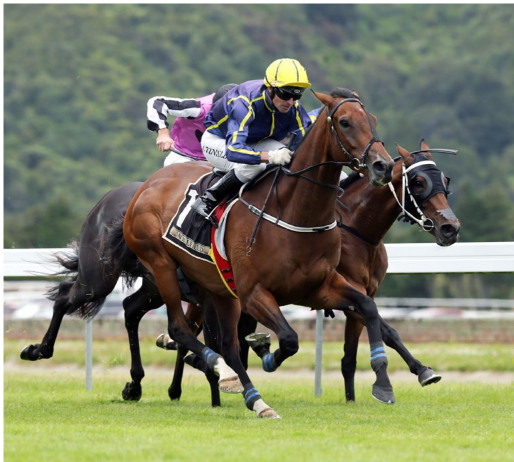
A trip to Ellerslie this weekend is a possibility for dominant Trentham winner Travimyfriend

Although forced to bullock his way between runners at the 200 metre