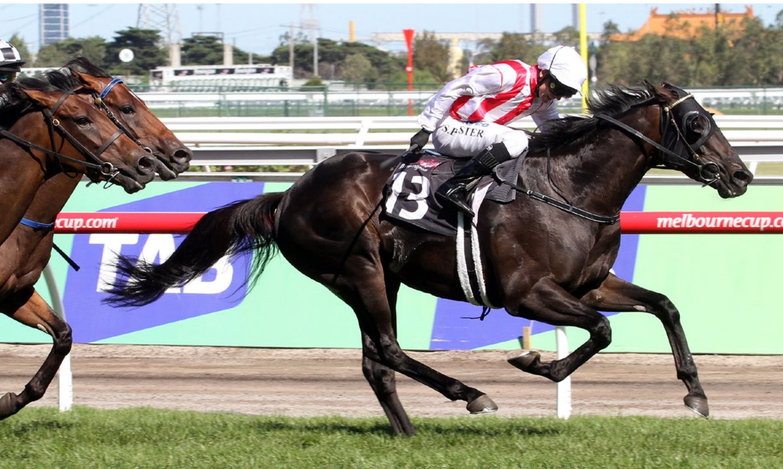
Ferlax winning the 2013 Gr. 1 Australian Guineas

The local thoroughbred breeding industry suffered a major loss over the weekend when the Haunui Farm based Gr. 1 Australian Guineas winner Ferlax (NZ) (Pentire) was euthanized after sustaining a paddock injury on Thursday afternoon.