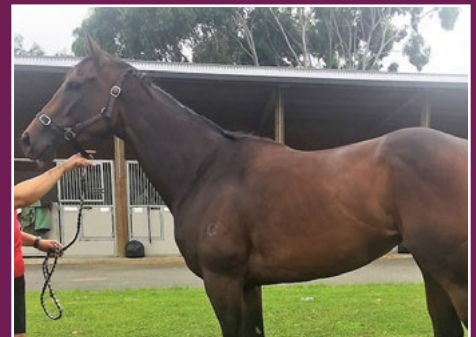
Fastnet Rock mare - race or breed.

NEXT NZ AUCTION DATES • Accepting listings from Tuesday 24 January • Listings close 7pm Monday 30 January • Catalogue published online 5pm Tuesday 31 January • Bidding from 5pm Tuesday 31 January to close of auction on Monday 6 February • Lots close in sequential order from 7pm on Monday 6 February.