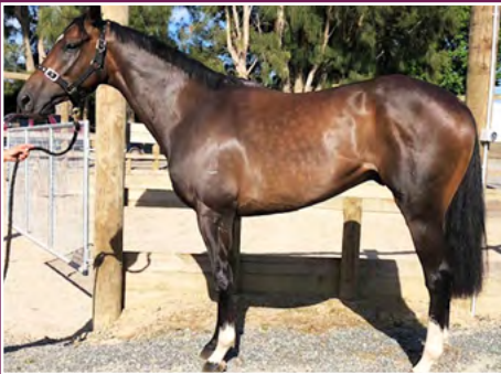
TRIAL WINNING SON OF HE'S REMARKABLE.