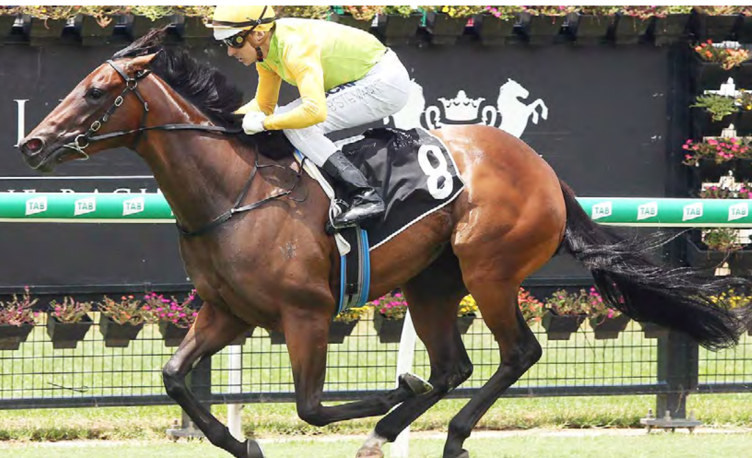
Speedy filly Epaumada will be reserved for the Queensland Winter Carnival instead of travelling to Ellerslie