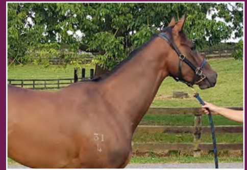
HALF-SISTER TO A GR.1 WINNER BY POUR MOI.