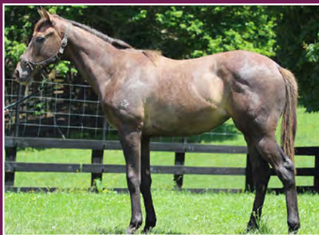
RELIABLE MAN FILLY OUT OF A WINNING GROSVENOR MARE.