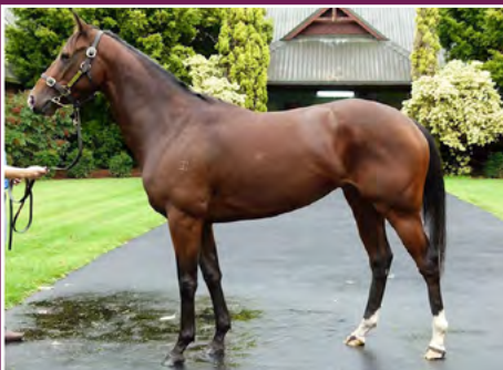
WINNER FROM THE FAMILY OF HONOR BABE, RACE OR BREED.