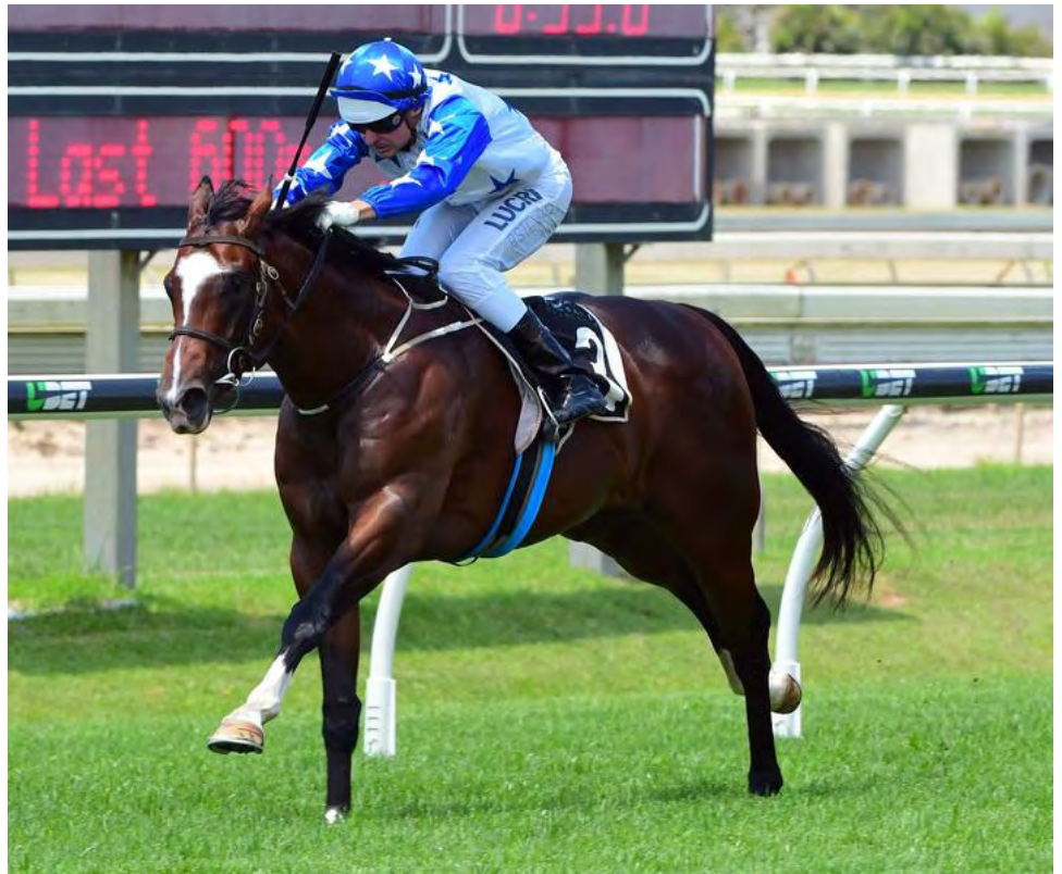
Aussie raider Neptune's Spear is on target for Saturday's Karaka Million 2YO at Ellerslie

Successful on debut at Doomben in November after leading throughout over 1050m, Neptune's Spear finished