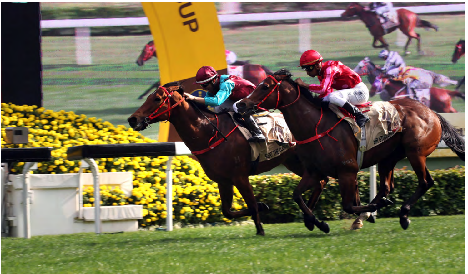
Beat The Clock holds out Mr Stunning at Sha Tin