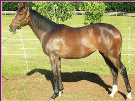
YEARLING FILLY BY SHOCKING OUT OF A MULTIPLE WINNER.