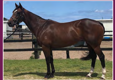
TAVISTOCK MARE, RACE OR BREED.