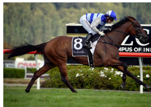
Supera (NZ) (Savabeel)

Talented four-year-old Supera (NZ) (Savabeel) landed her first stakes success last weekend when winning the Gr.3 Tui-Backing A Winner Since 1889 Anniversary Handicap (1600m) and the well-related