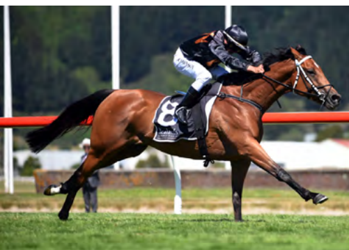
Consensus (NZ) (Postponed)