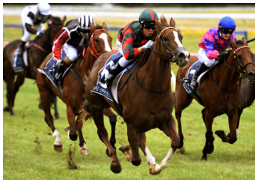
Autumn Wild (Snitzel)

The three-year-old filly settled at the rear of the field for apprentice jockey Taiki