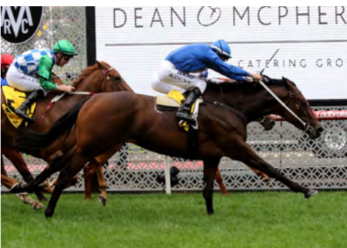
Oceanex (NZ) (Ocean Park)