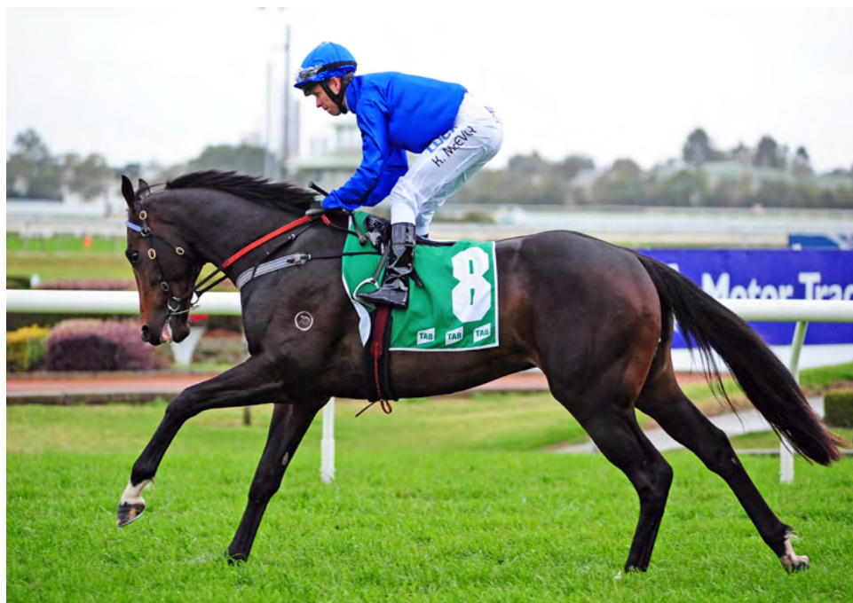
Novara Park resident stallion Sweynesse eight in Book 3.

There are five yearlings in the Karaka Book 1 catalogue, with 10 in Book 2 and