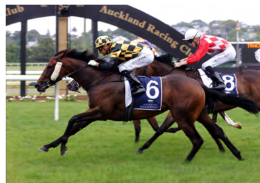
Probabeel (NZ) (Savabeel)

"It was good catching up with everyone at trackwork and hopefully I can form some good associations again," Grylls said. Full story here