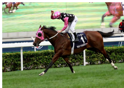
Beauty Generation (NZ) (Road To Rock)

Three men and their cameras faced the cold breeze that nipped along Sha Tin's backstretch at 7.31am on Thursday morning, all to capture on file Beauty Generation's