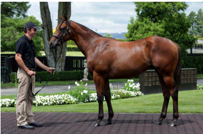
Lot 122 Iffraaj ex Katie Lee colt

"Transparency is so important to buyers and by using the Horse Passport, we can provide potential buyers with not only increased confidence but with a convenient and time-saving vital information service as well."