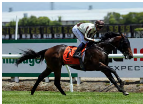
Excalibur (NZ) (Tavistock)