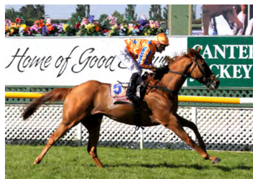
Te Akau Shark (NZ) (Rip Van Winkle)

The son of Ocean Park was sold out of Blandford Lodge's 2016 New Zealand Bloodstock Yearling draft and the Matamata farm will offer a half-sister by Savabeel at Karaka later this month as lot 427.