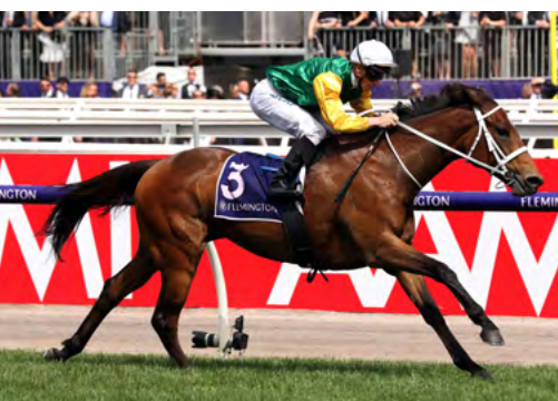
Shillelagh (NZ) (Savabeel)

"She has pulled up well, she was home just after midnight on Saturday night, she looks really well."