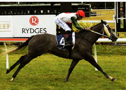
Shesonfire (NZ) (Zacinto)

Te Akau Shark is part-owned by NRL legend Paul Gallen.