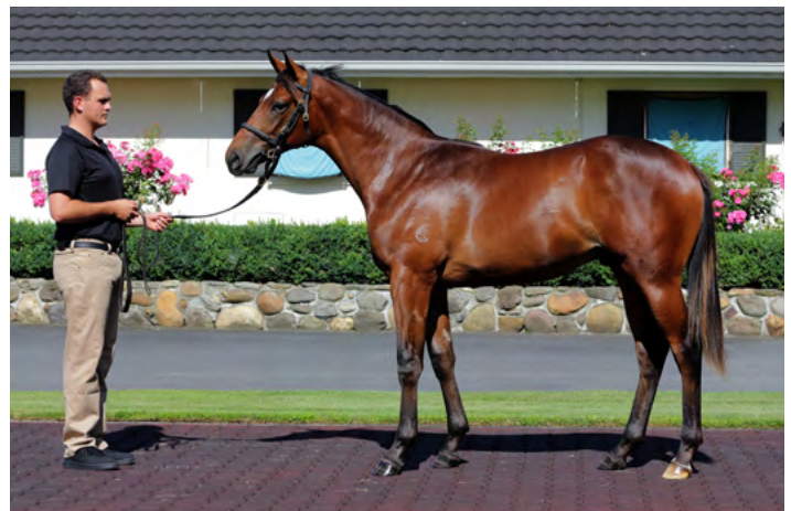
Lot 67 Redoute's Choice ex Griante colt