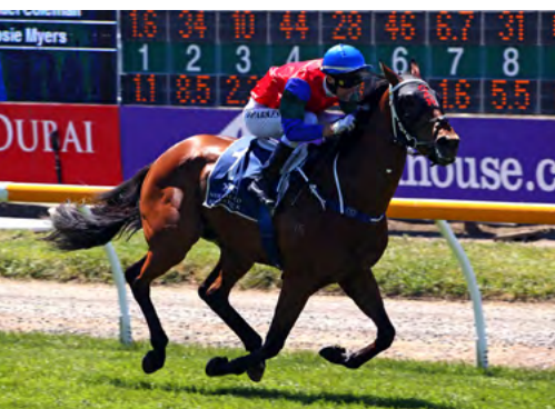
More Wonder (NZ) (Mossman)