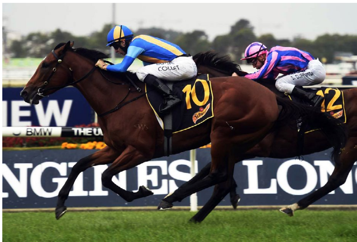
Imposing Lass gets a well-deserved Group race win in Gosford's Belle Of The Turf Stakes.