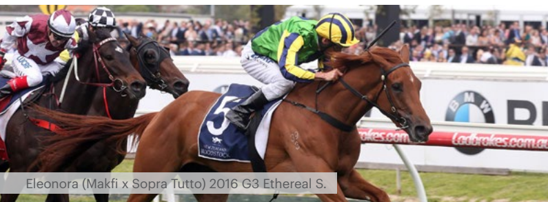
Eleonora (Makfi x Sopra Tutto) 2016 G3 Ethereal S.