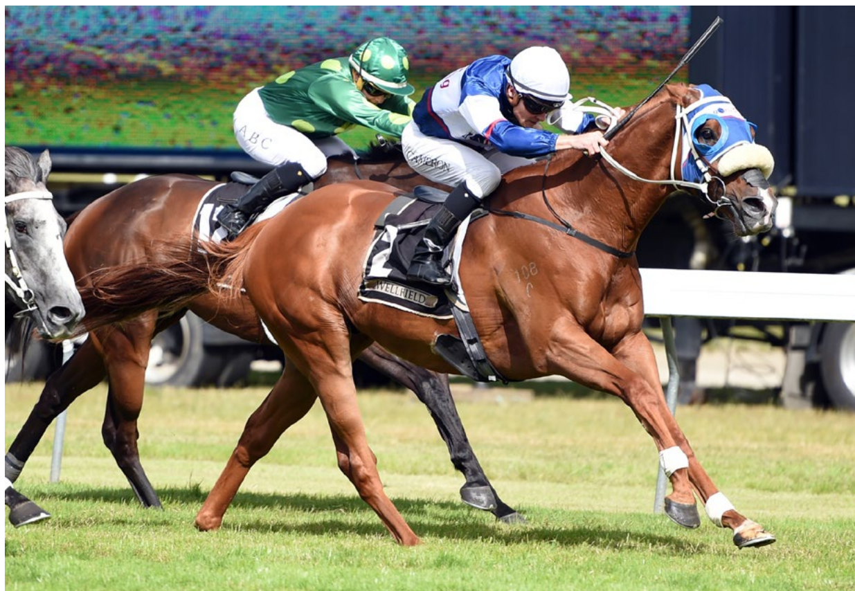
Seize The Moment holds a strong gallop to the line to win the Anniversary.