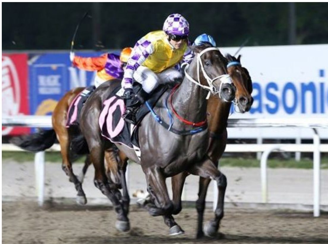
Viviano races away with the feature race on Friday night's Kranji card.

"He's won over 1400 metres before and I will probably