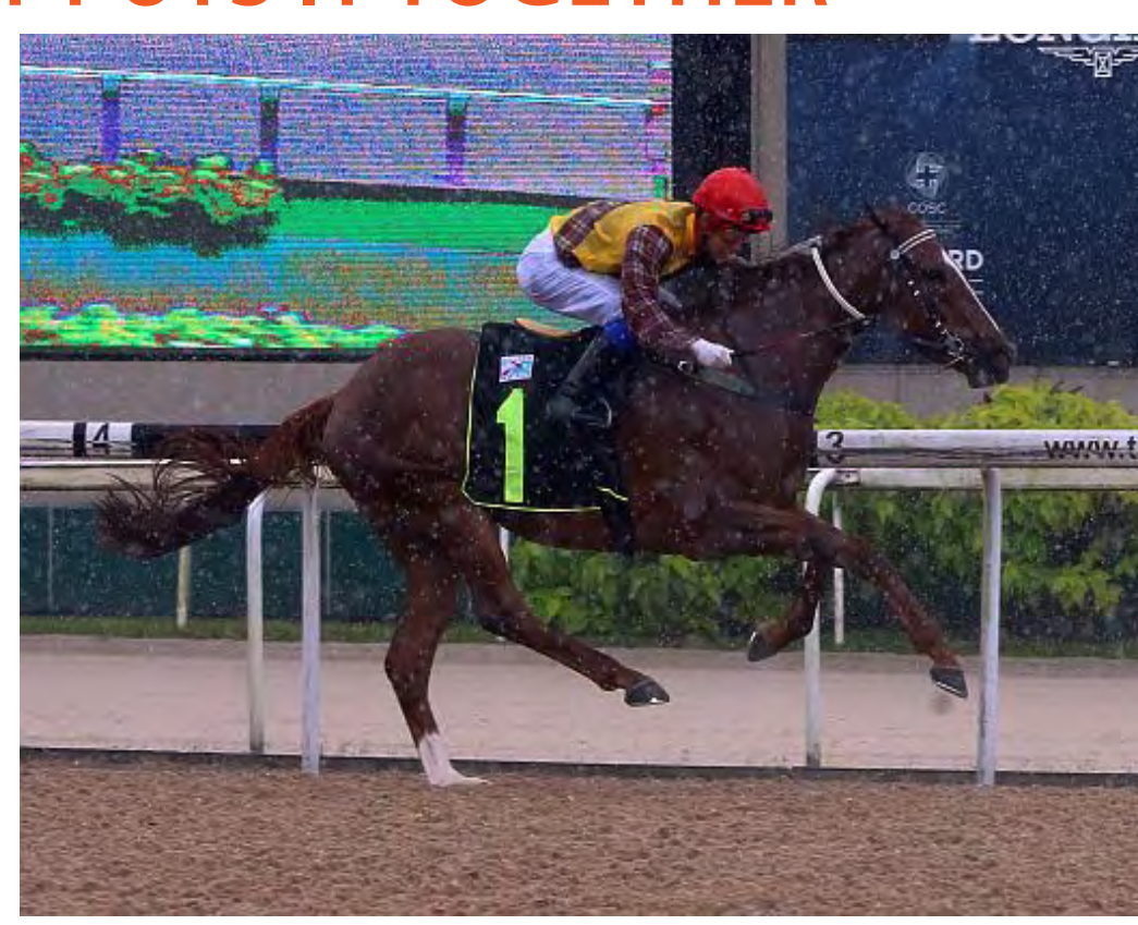
Boy Next Door puts it all together to break his maiden status at Kranji

"The boss said to send him forward. There was a little bit of pressure from the start, the pace was quite strong.