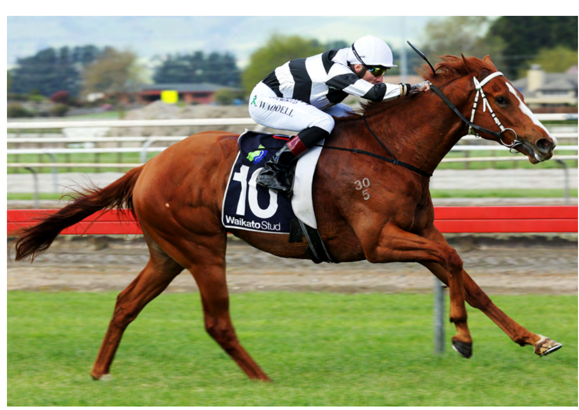
Classy three-year-old Dawn Patrol is on target for the Karaka Million 3YO Classic despite a slight hiccup over the weekend

"He was as good as gold by the afternoon, so I don't believe it was anything serious, but it was enough to see him withdrawn from Sunday's race."