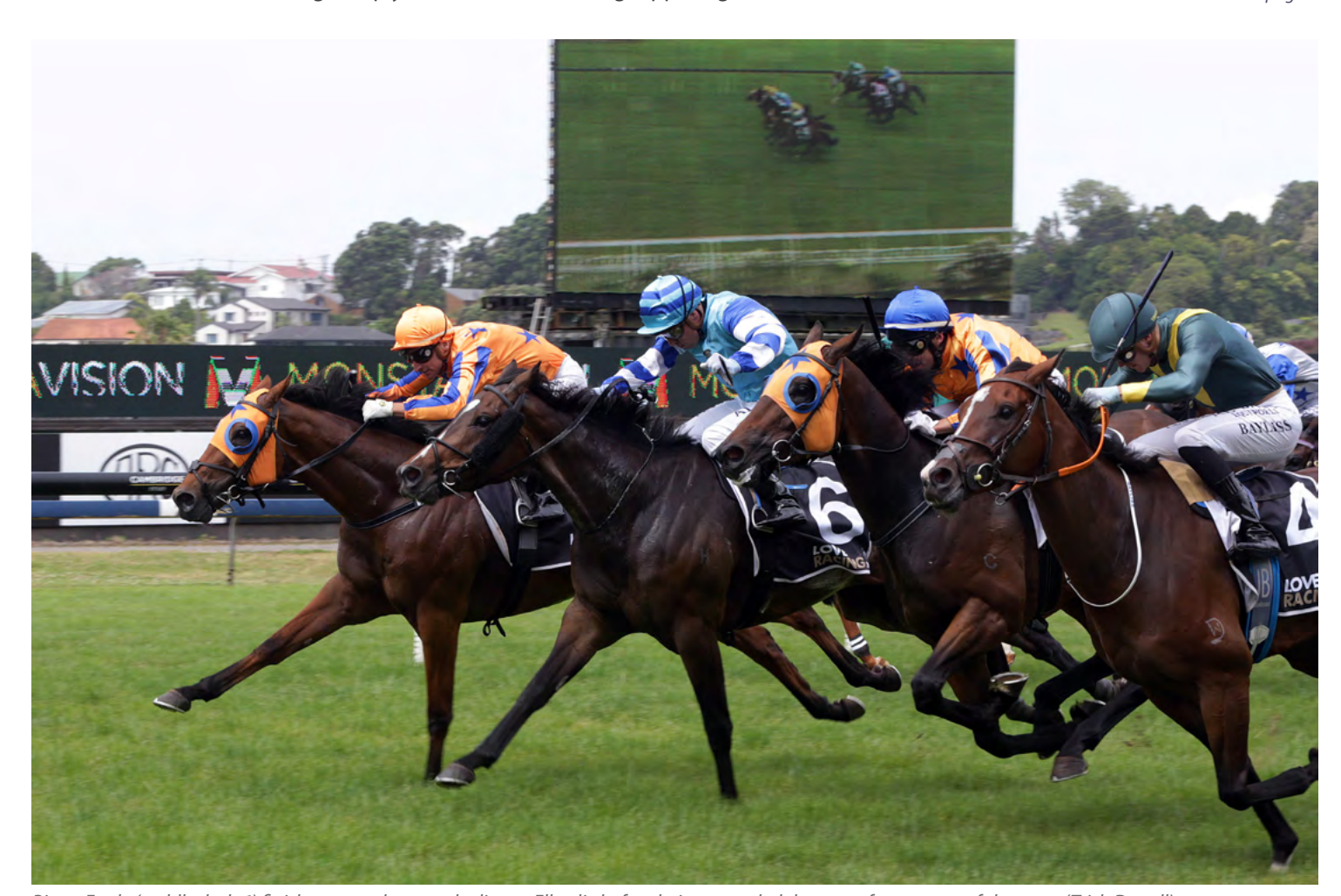
Rippa Eagle (saddlecloth 6) finishes second across the line at Ellerslie before being awarded the race after a successful protest (Trish Dunell)