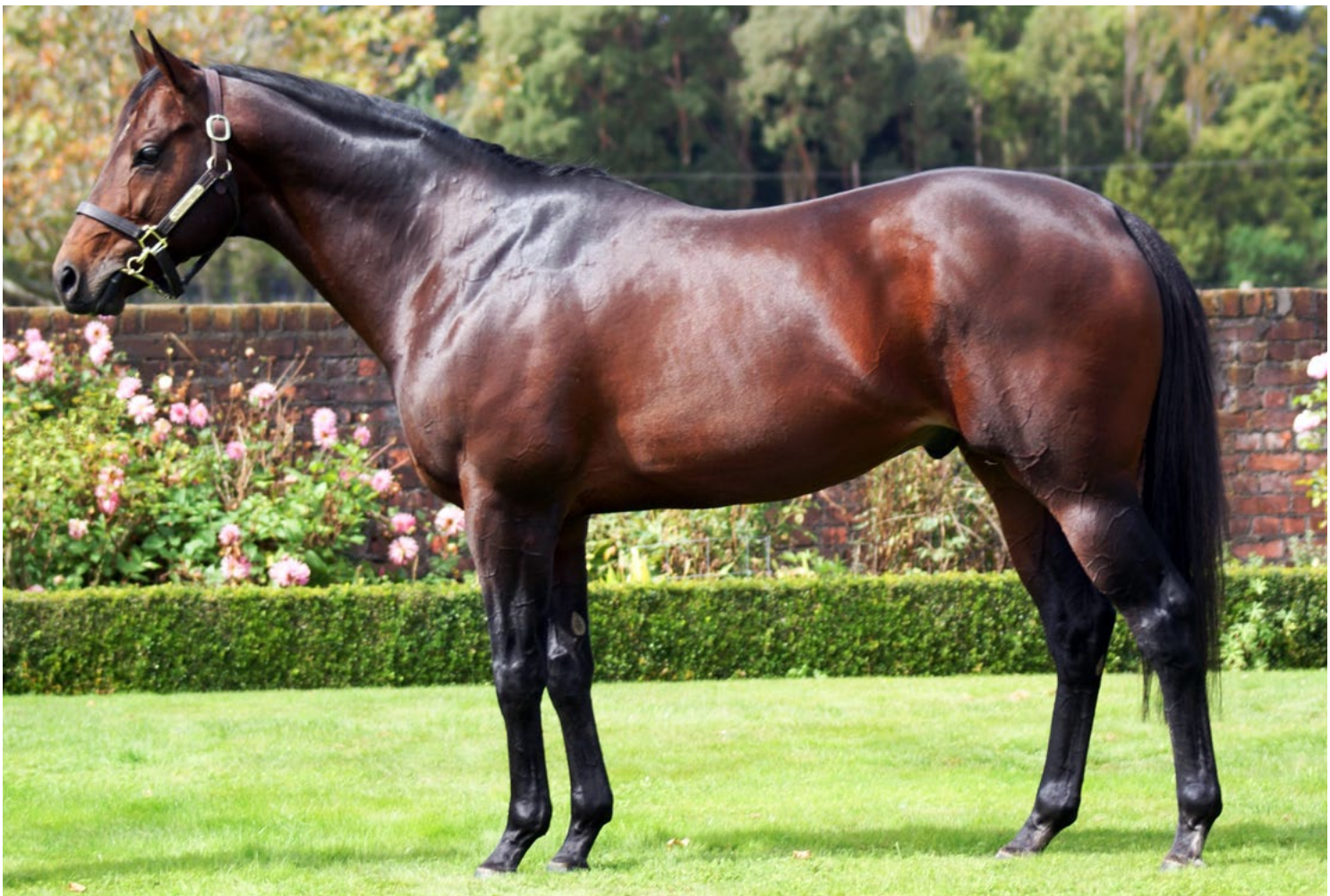
Little Avondale stallion Per Incanto

he breakthrough victory for former Group One winning juvenile Dal Cielo (NZ) (Per Incanto) in Sydney on Saturday couldn't have come at a better time for his sire Per Incanto (Street Cry).