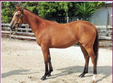
Yearling filly by Jimmy Choux.

Featuring 9 lots including yearlings, broodmares, unraced and raced horses.