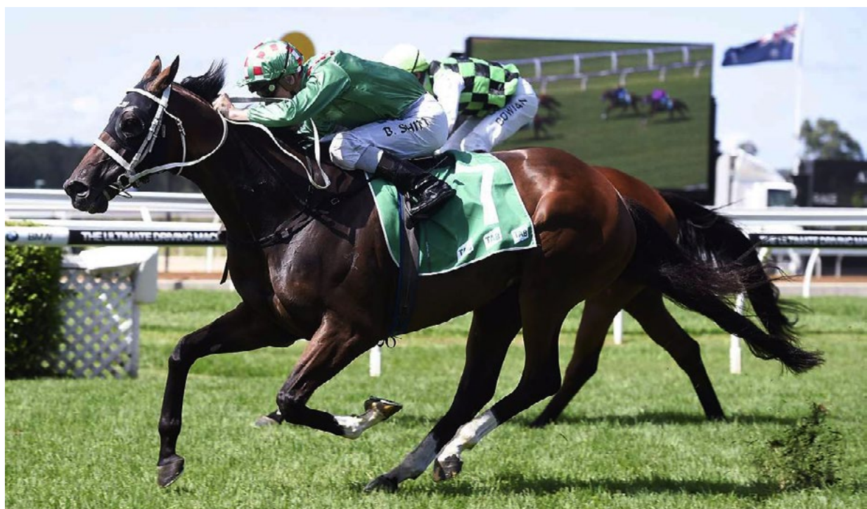
Cauthen's Power is strong through the line as he takes the Tabcorp Mile at yesterday's Warwick Farm meeting.