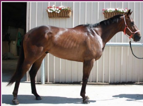
Promising stayer by Shocking.