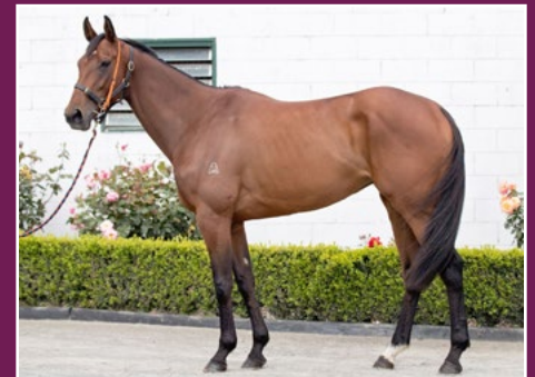
Winning Exceed and Excel mare.

NEXT NZ AUCTION DATES • Accepting listings from Tuesday 10 January • Listings close 7pm Monday 16 January • Catalogue published online 7pm Tuesday 17 January • Bidding from 7pm Tuesday 17 January to close of auction on Monday 23 January • Lots close in sequential order from 7pm on Monday 23 January