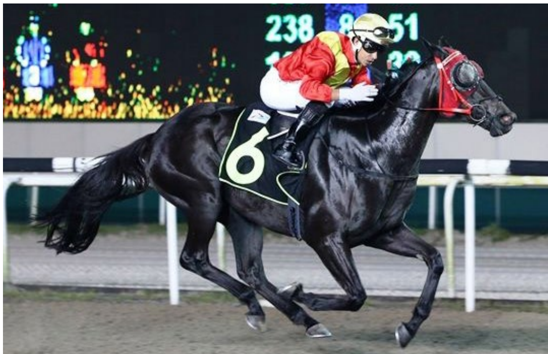
Mongolian Chief appreciates a step up in distance to record Friday night's runaway win.