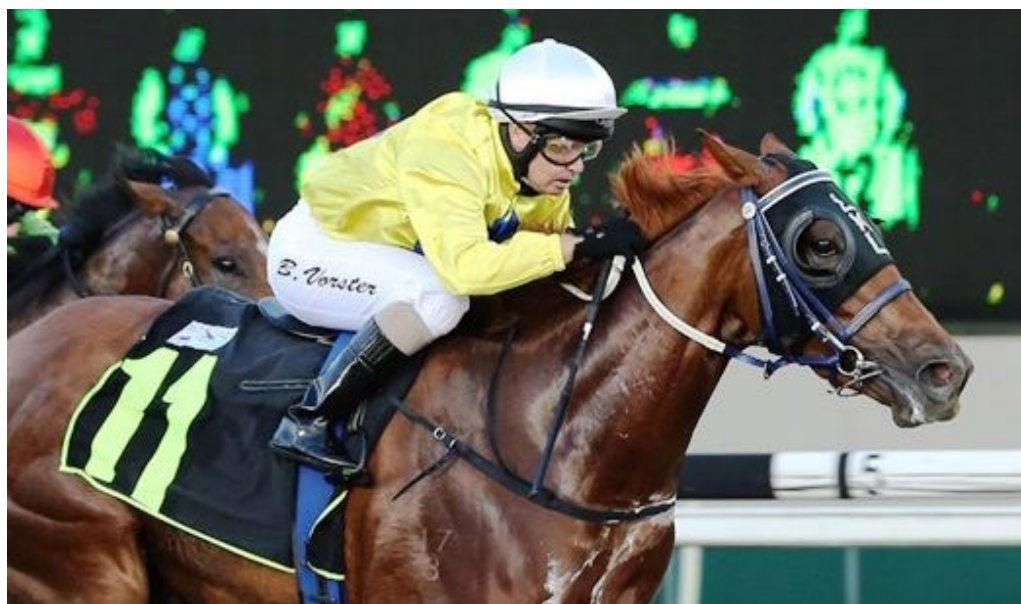
Aotearoa commences her Singapore career with a win.