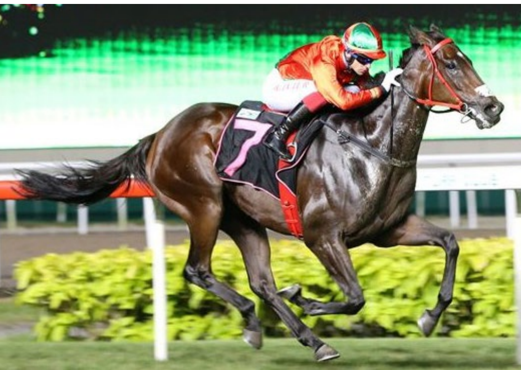
Robin Hood well clear of his rivals in the main race at Kranji on Friday night.