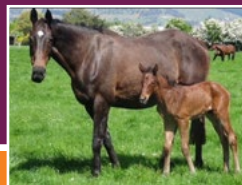
FOR SALE NOW on gavelhouse.com