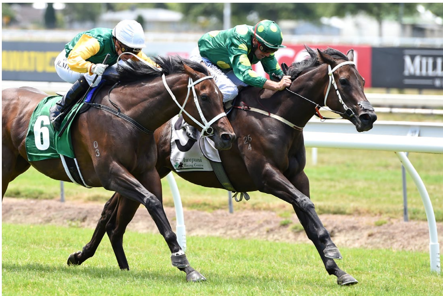
Speedy filly Gift Of Power (inner) may contest the Gr. 1 JR & N Berkett Telegraph (1200m) at her next assignment