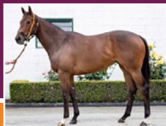
FOR SALE NOW on gavelhouse.com