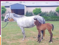
FOR SALE NOW on gavelhouse.com

NZ catalogue online now with 11 Lots on offer - bidding closes 7pm tonight.