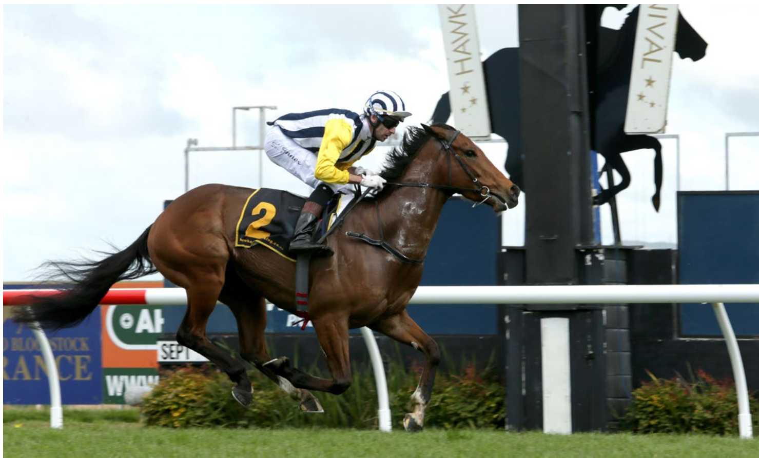
Haussmann is on target for his Trentham Group One target this Saturday