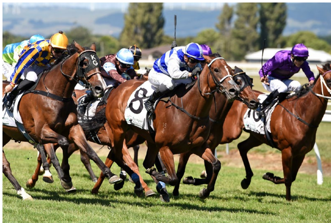
Royally-bred mare Seraphim (blue & white hoops) lands her first major prize with victory in the Listed Gallagher Marton Cup