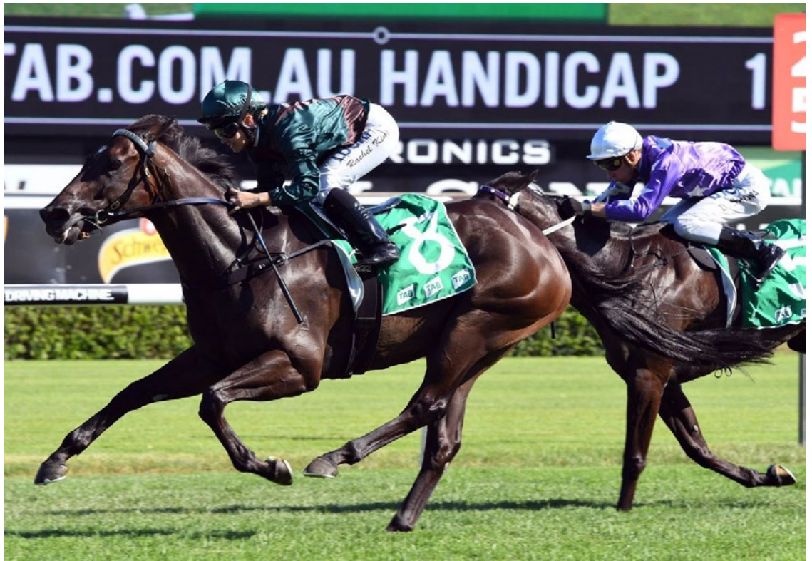
Lanciato powers home to score at Randwick

"I planned (this run) the same as his last preparation where he carried a big weight first up and ran third. A month