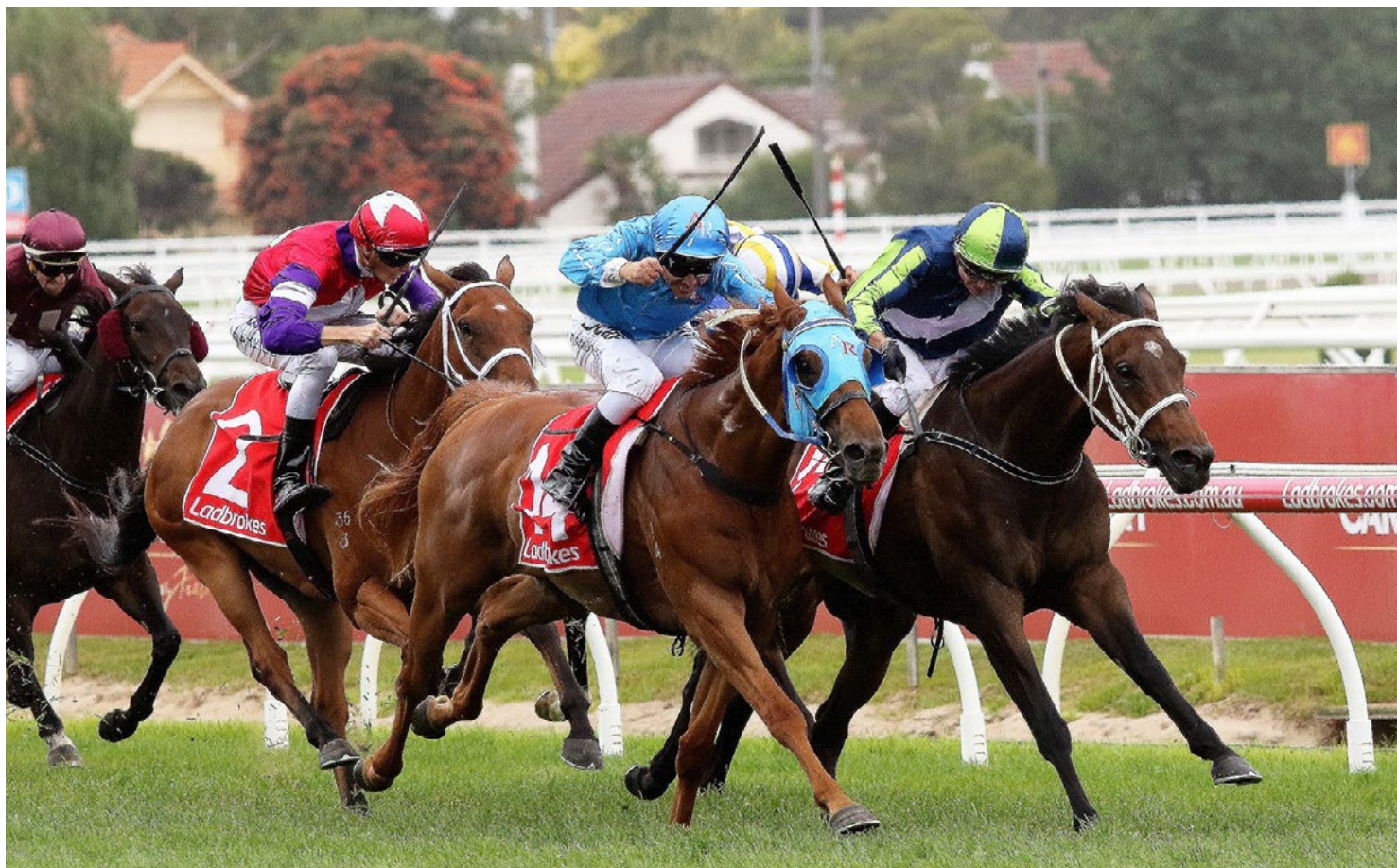
Keen (inner) maintains his unbeaten record with a victory at Caulfield