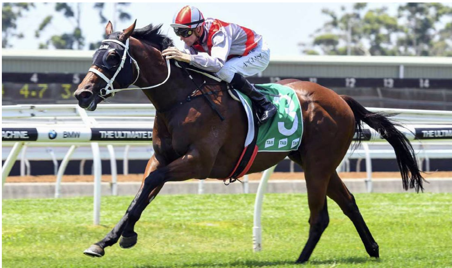
Chris Waller is sending Scream Park to Ellerslie to contest the Listed Karaka Million 3YO Classic (1600m)

Scream Park (NZ) (Ocean Park) will return home to New Zealand for the inaugural Listed Karaka Million 3YO Classic (1600m) despite being beaten at Randwick.