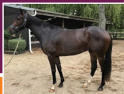
FOR SALE NOW on gavelhouse.com