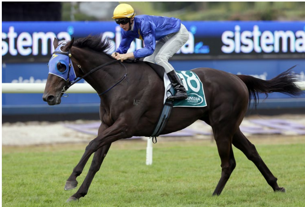
He may have been fortunate to make the field but Clarify left no doubt about his credentials when striding clear of his rivals in the Dunstan Stayers Final.