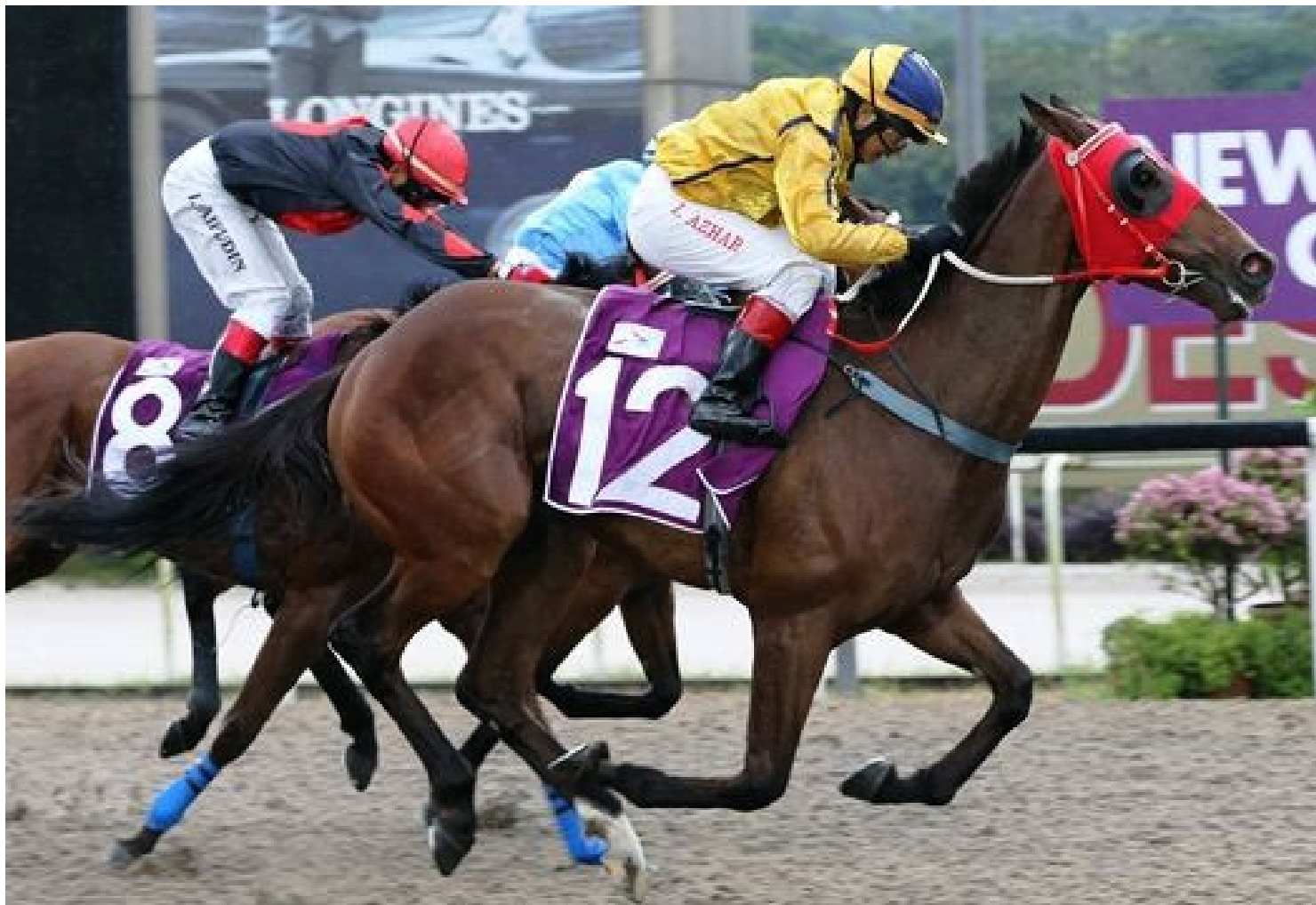
Guru-Guru outtoughs the opposition in Singapore's New Year Cup.

After missing the cut in the Dester Singapore Gold Cup, Guru-Guru (NZ) (Faltaat) got a nice form of redemption in the shape of a gritty win in the $S200,000 Sgp-Group Three New Year Cup at Kranji yesterday.